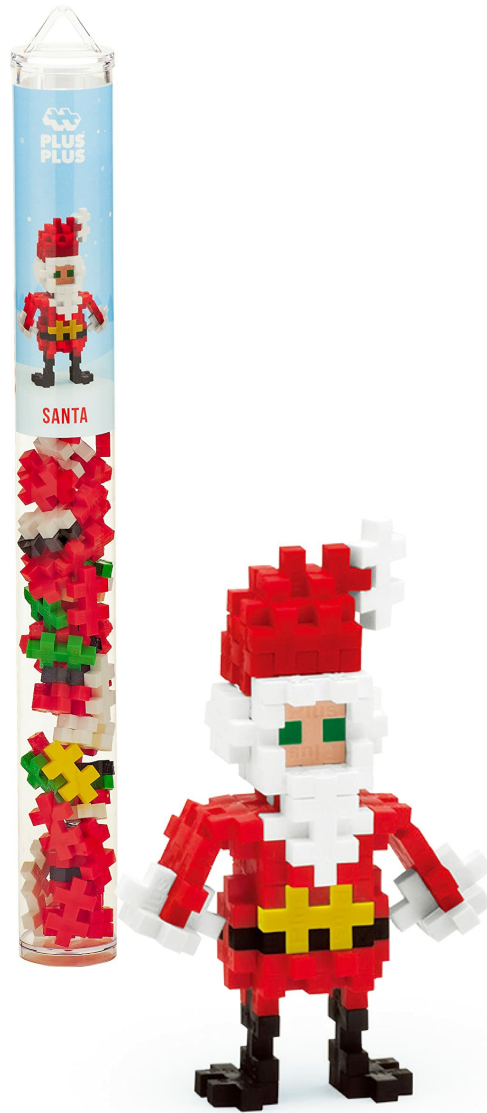
Figure of the assembled Santa Claus made from PLUS PLUS blocks.