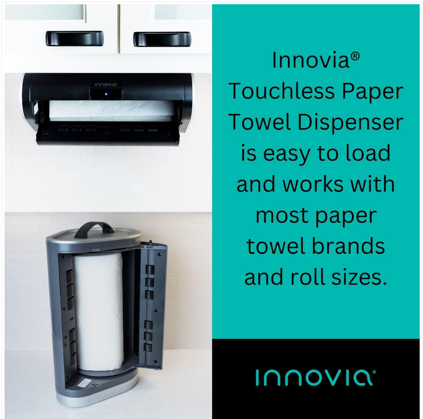
Figure 3: Loading a paper towel roll.