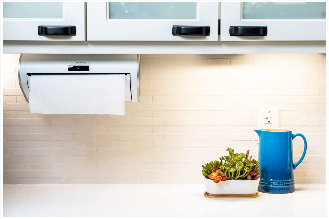
Figure 2: Dispenser mounted under a kitchen cabinet.

The Innovia dispenser can be mounted under your cabinet or on a wall. Use the included mounting bracket and installation template. Ensure the chosen location is near an AC power outlet.