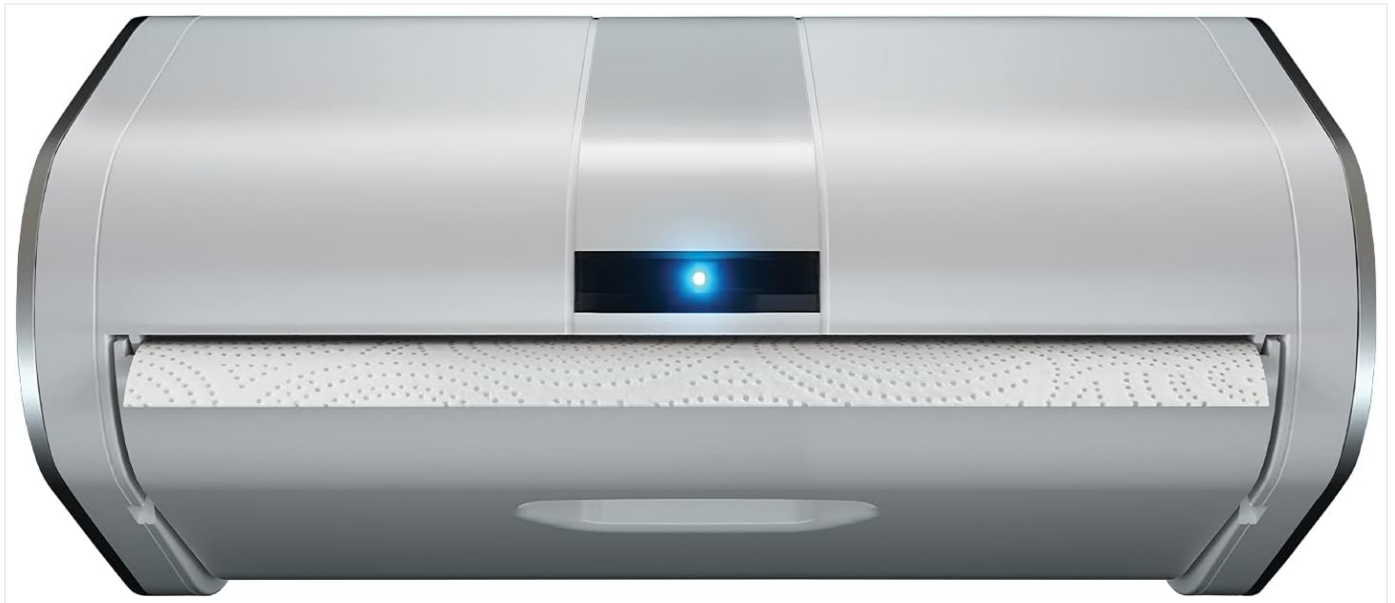
Figure 1: Front view of the Innovia Automatic Paper Towel Dispenser.

This manual provides detailed instructions for the installation, operation, and maintenance of your Innovia Automatic Paper Towel Dispenser. This touchless dispenser is designed for convenience and hygiene, working with most paper towel brands and sizes. Please read these instructions carefully before use to ensure proper functionality and longevity of your device.