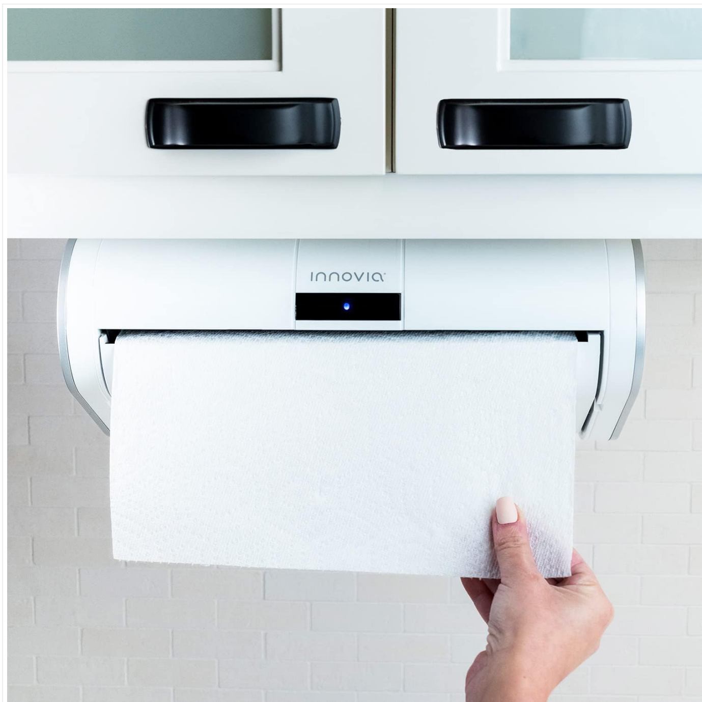
Figure 5: Touchless dispensing in action.