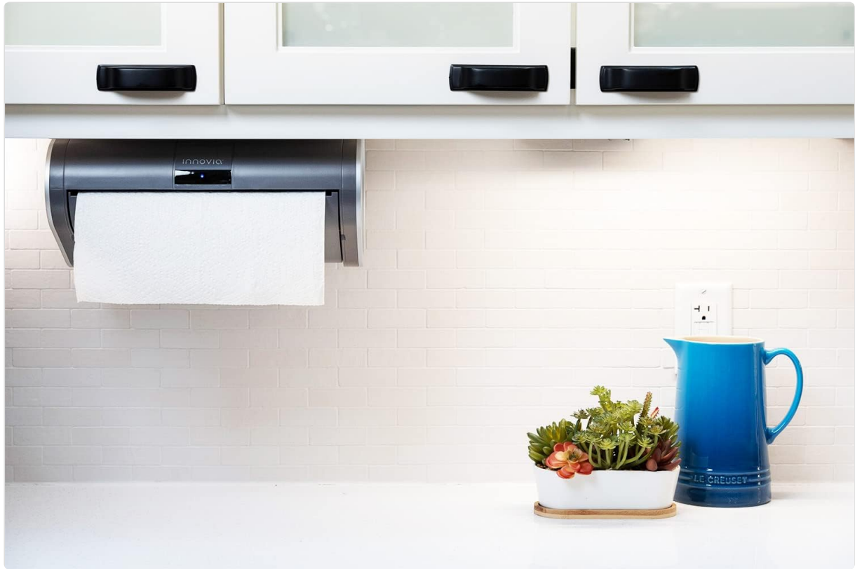
Image: The Innovia Automatic Paper Towel Dispenser mounted neatly under a kitchen cabinet, demonstrating its space-saving design.