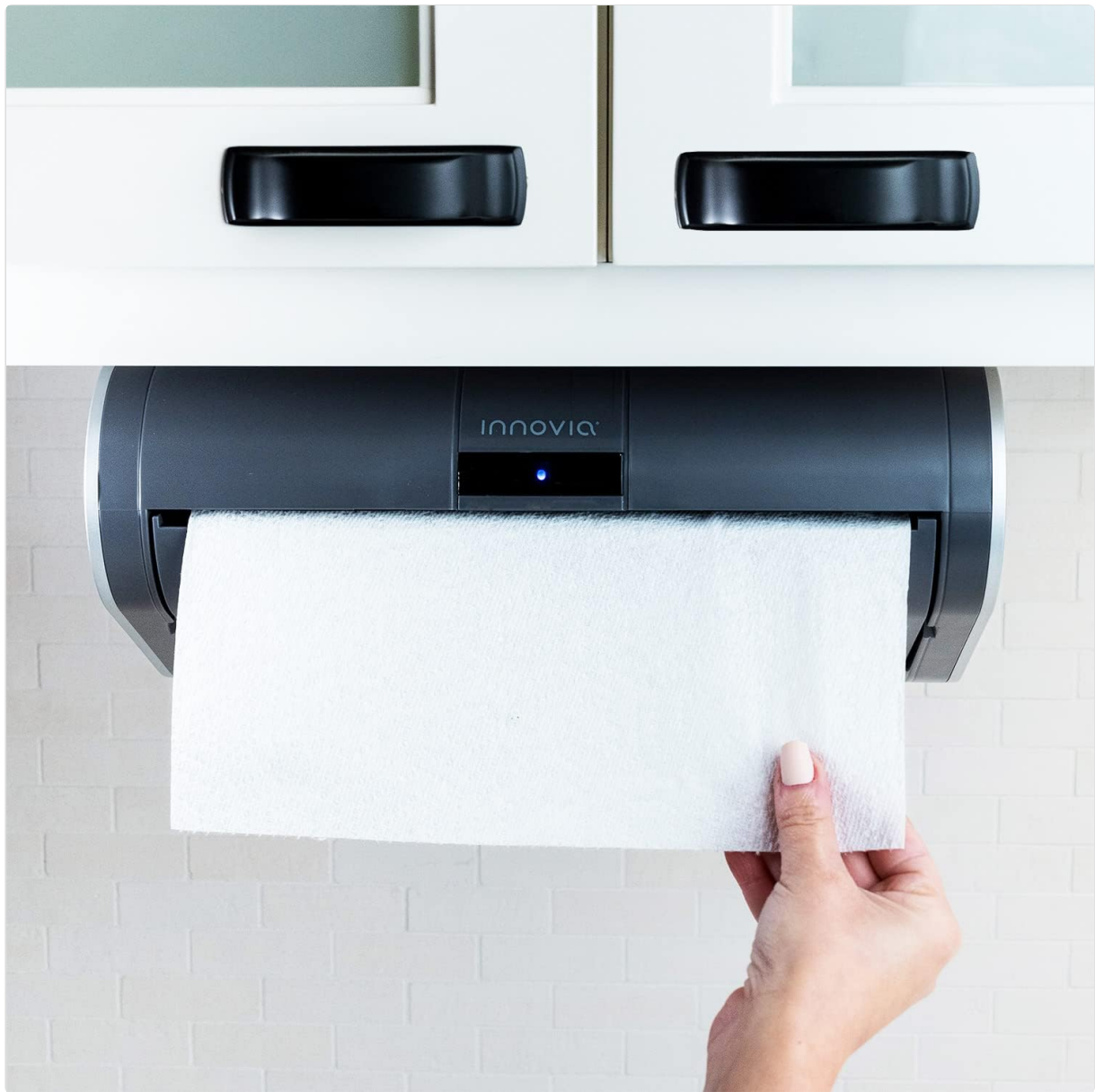
Image: A hand activating the sensor of the Innovia dispenser, showing the touchless operation.