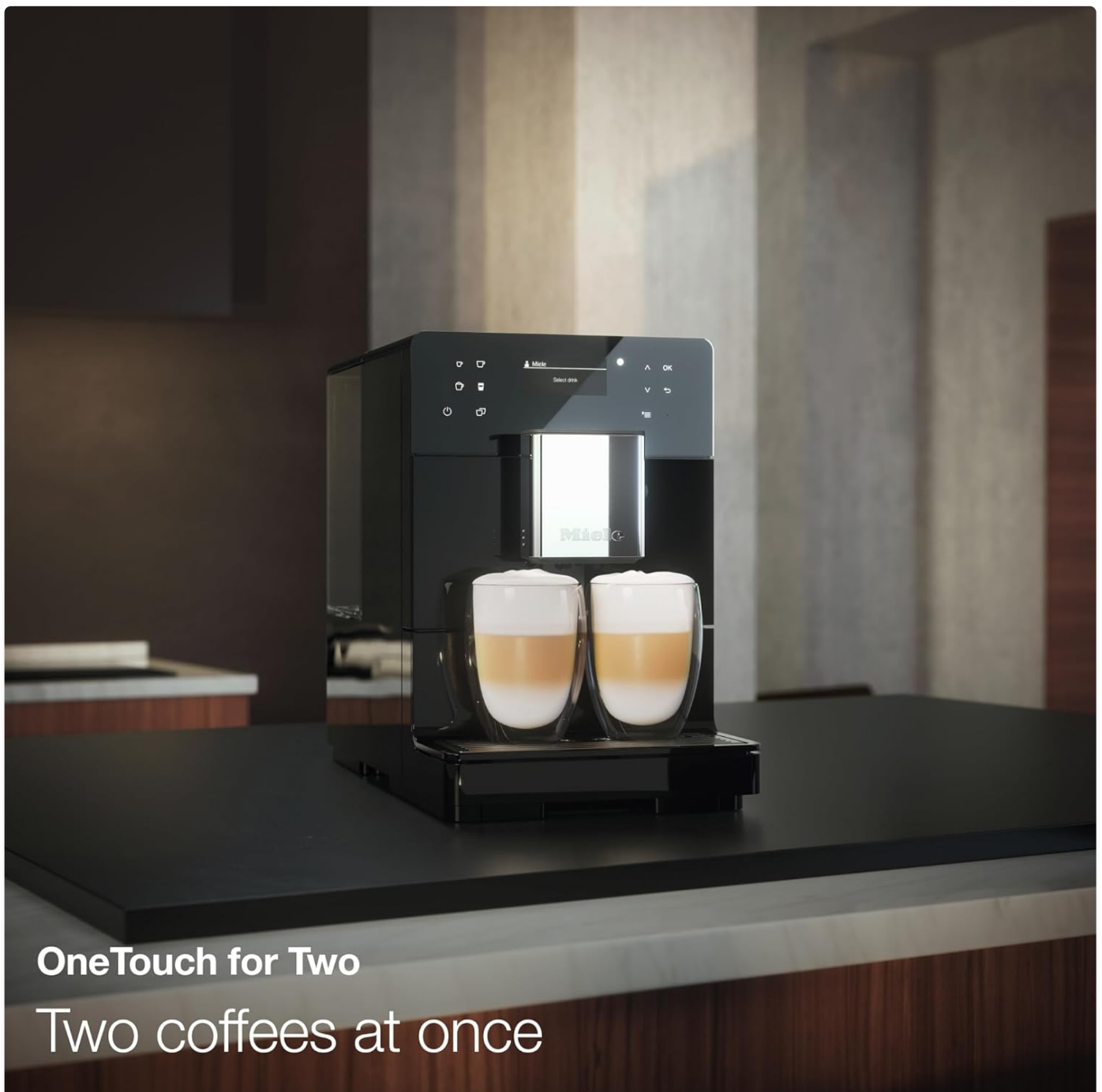
Figure 5: The OneTouch for Two function in action, brewing two beverages.