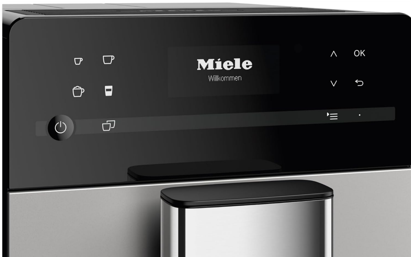
Figure 4: The intuitive DirectSensor control panel for beverage selection.

Long coffee, Cappuccino, Latte Macchiato, Hot milk, Milk froth, Caffè Latte, and Hot water. The machine also has a coffee pot function to prepare up to 8 cups at a time (coffee pot sold separately).