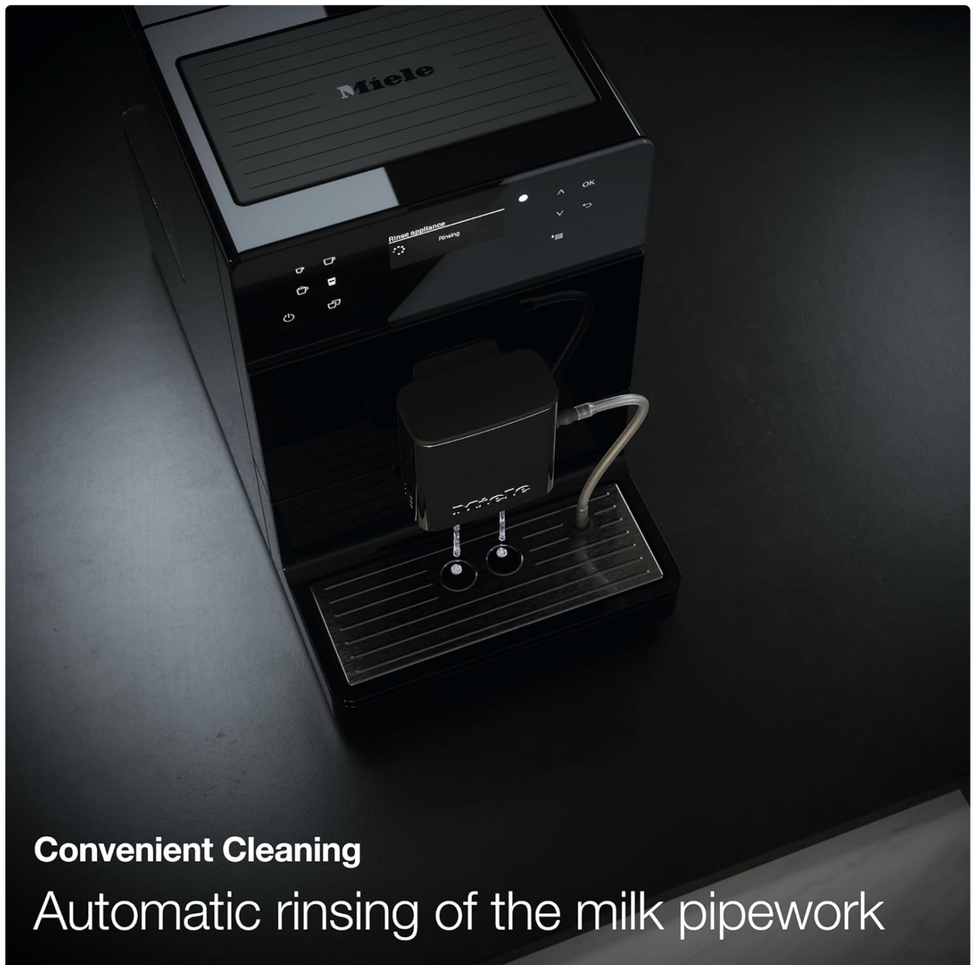
Figure 6: The automatic rinsing function for the milk pipework.

The machine performs automatic rinsing of the milk line with water from the water container. This helps maintain hygiene and prevents blockages.