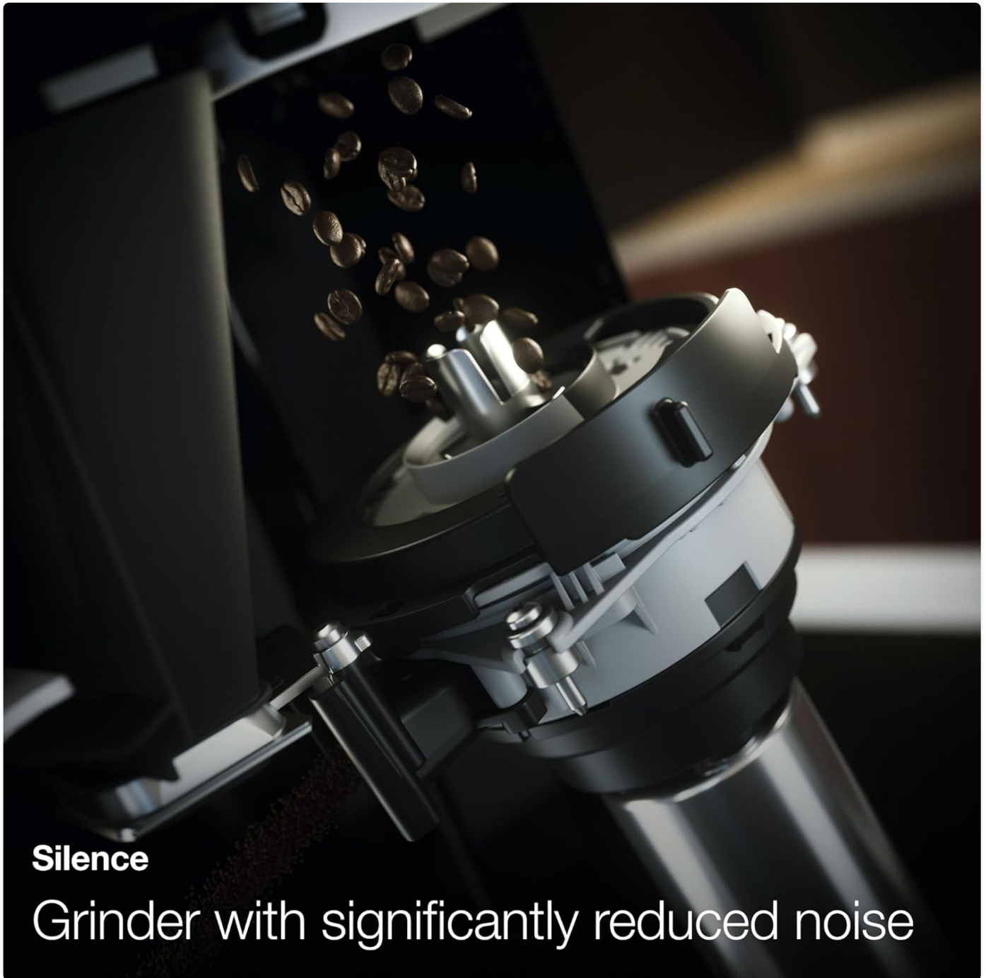
Figure 3: Detailed view of the coffee bean container and grinder mechanism.

The bean container is located at the top rear of the machine. Open the lid and fill with whole coffee beans. The bean container has a capacity of 7 oz. It is recommended to use non-flavored beans to prevent damage to the grinder.