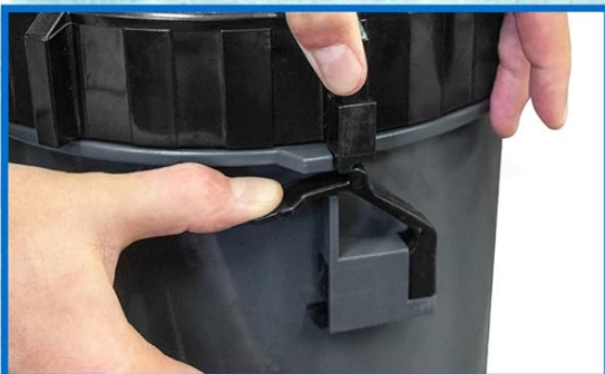
Ring & Latch Lock System