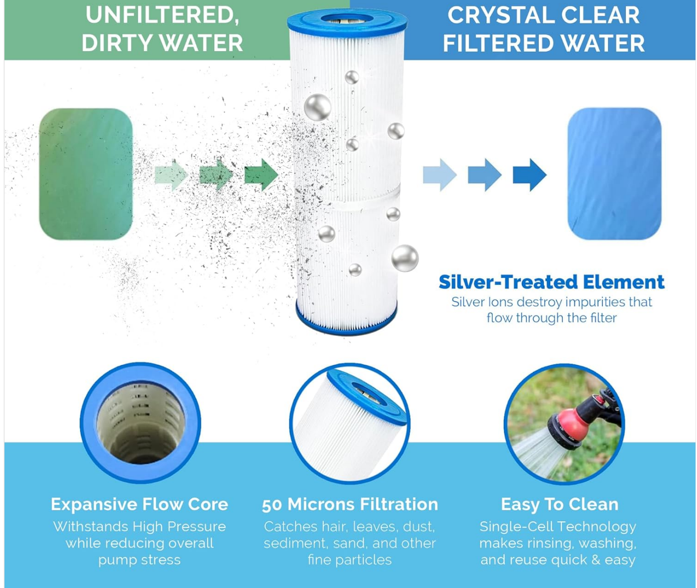
Figure 5: How the Sure-Flo filter system cleans your pool water.