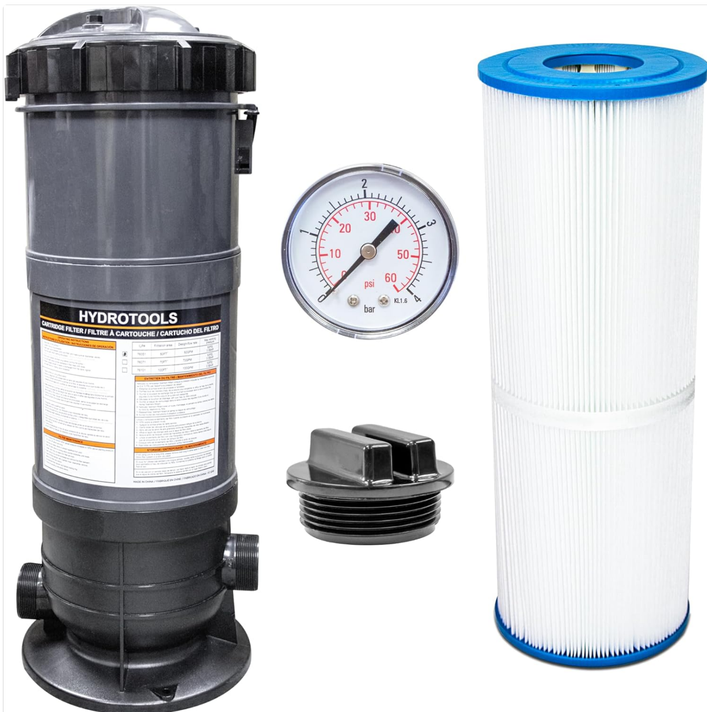
Figure 1: Main components of the Sure-Flo Cartridge Pool Filter System.