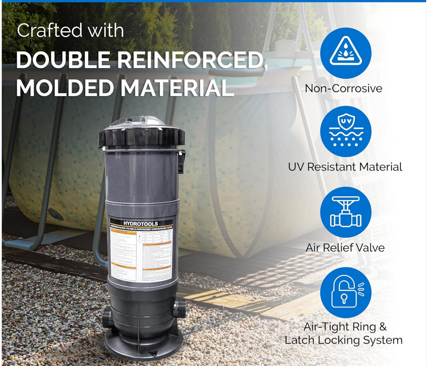
Figure 2: Durable construction features of the filter tank.