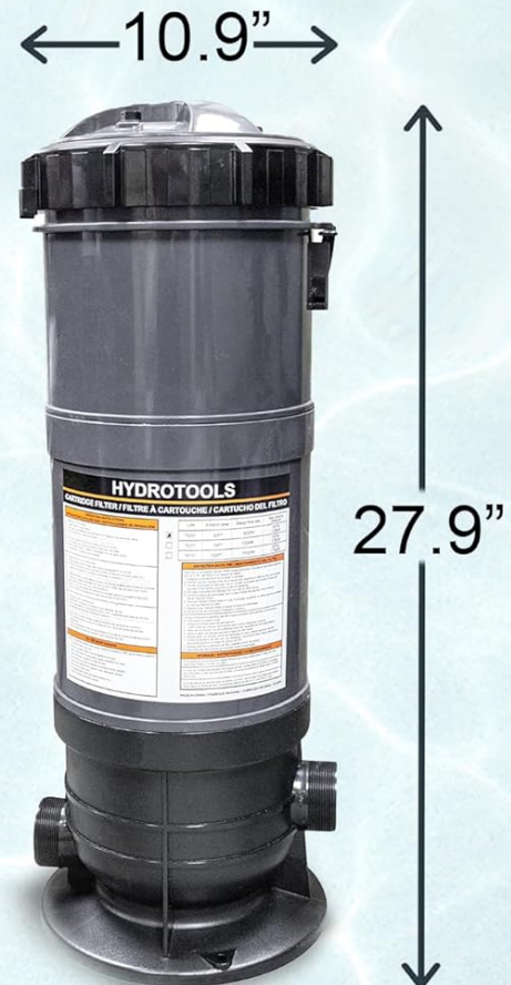
Figure 3: Filter system dimensions and compatibility details.