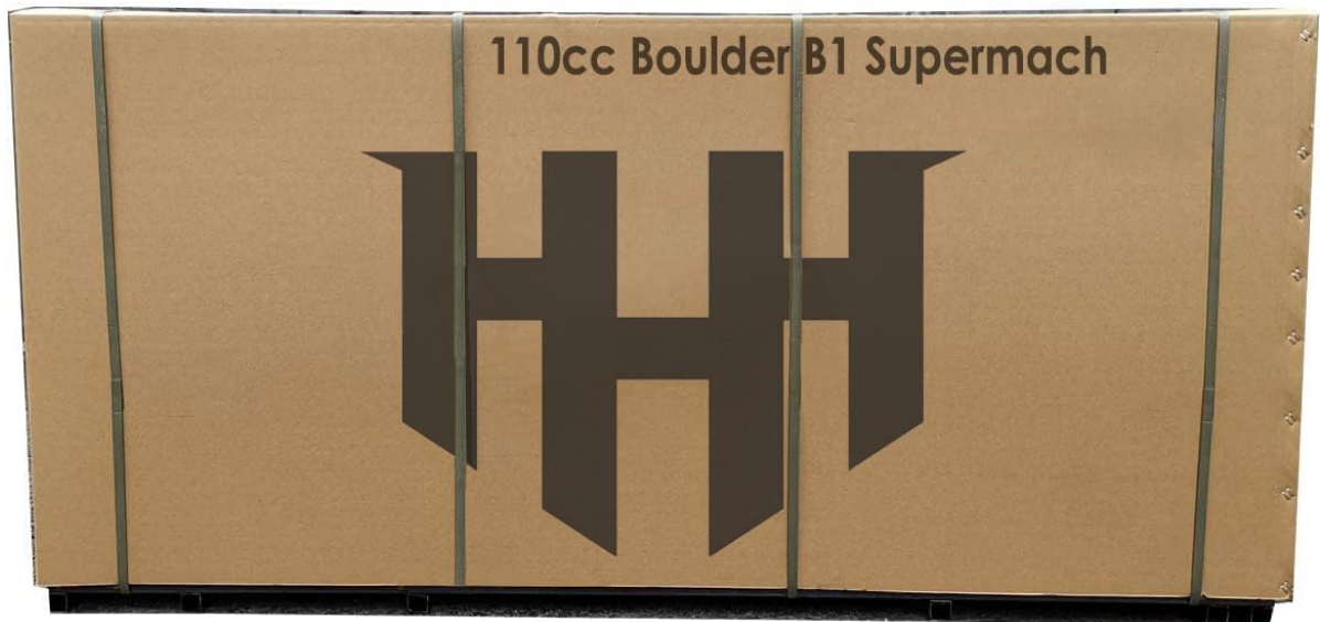
Image: The HHH 110cc ATV Boulder 110B1 securely packaged within its metal shipping crate, ready for unboxing and assembly.

Carefully remove the outer cardboard packaging. The ATV is secured within a metal frame. Use appropriate tools (e.g., wrenches, pliers, cutters) to unbolt and cut the ties securing the ATV to the frame. Remove the top and side sections of the frame.