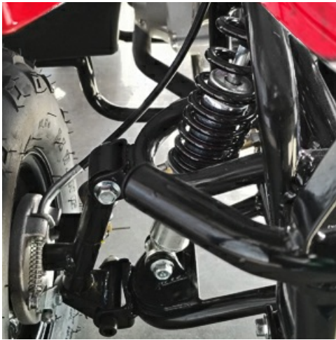
Image: A detailed view of the front suspension system, highlighting the shock absorber and the attachment point for the front wheel.