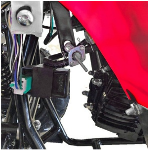
Image: A close-up of the fuel valve, typically located near the engine, which controls fuel flow to the carburetor.