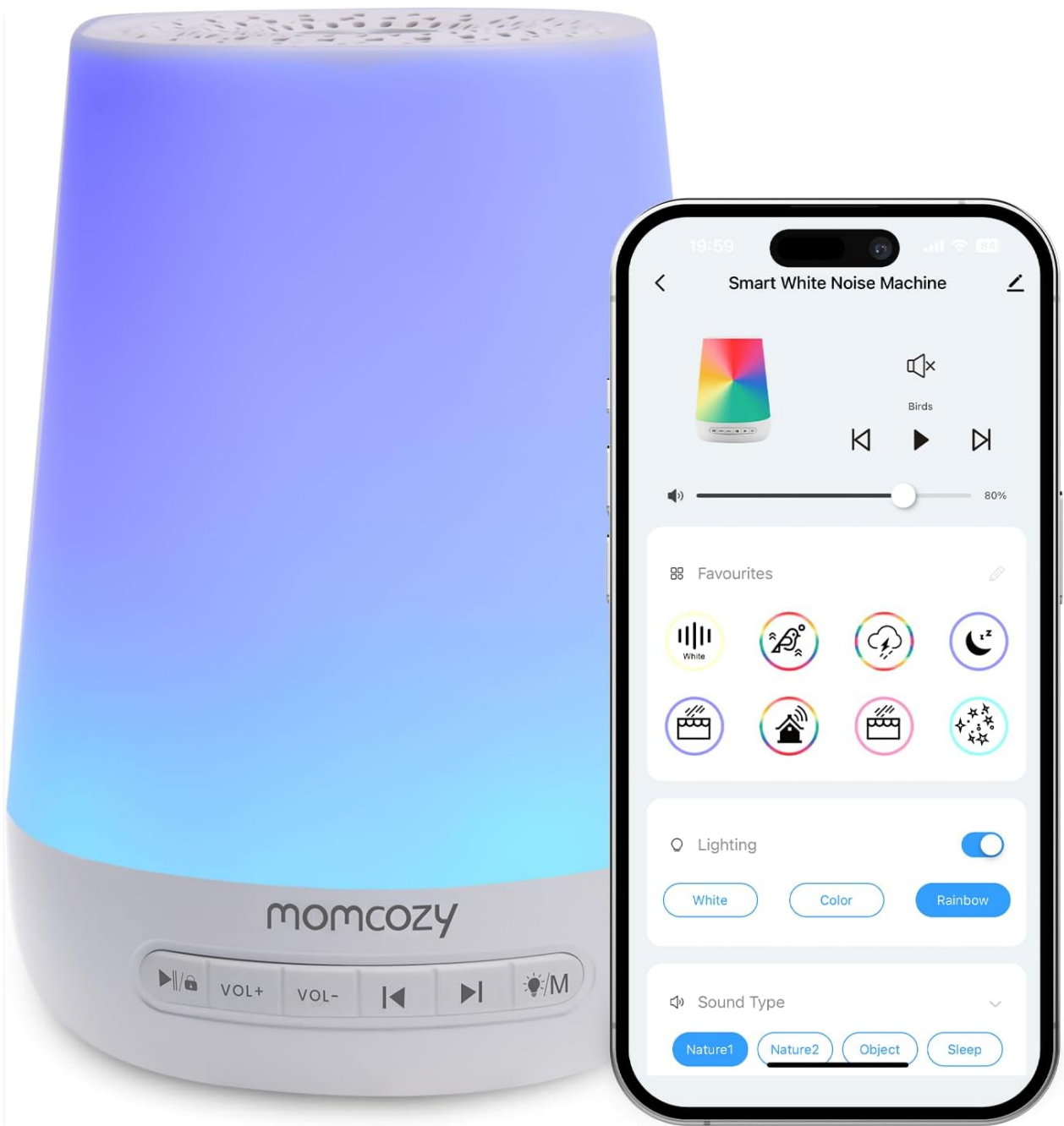
Image 1: Momcozy M21FWDB03 White Noise Machine with smartphone showing app interface.