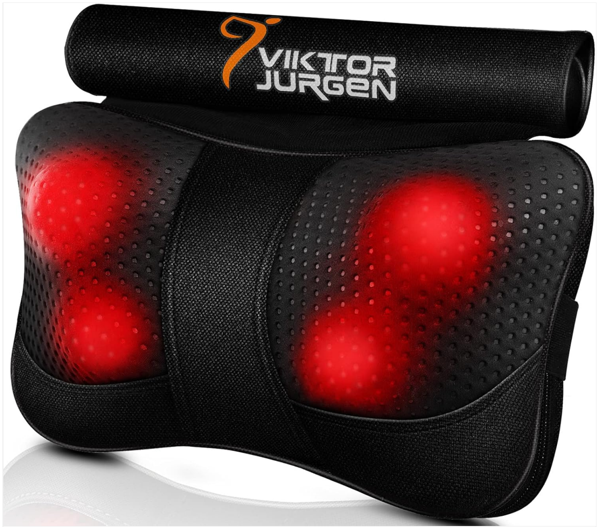
The massager features four rotating shiatsu massage nodes that illuminate red when the heat function is active.