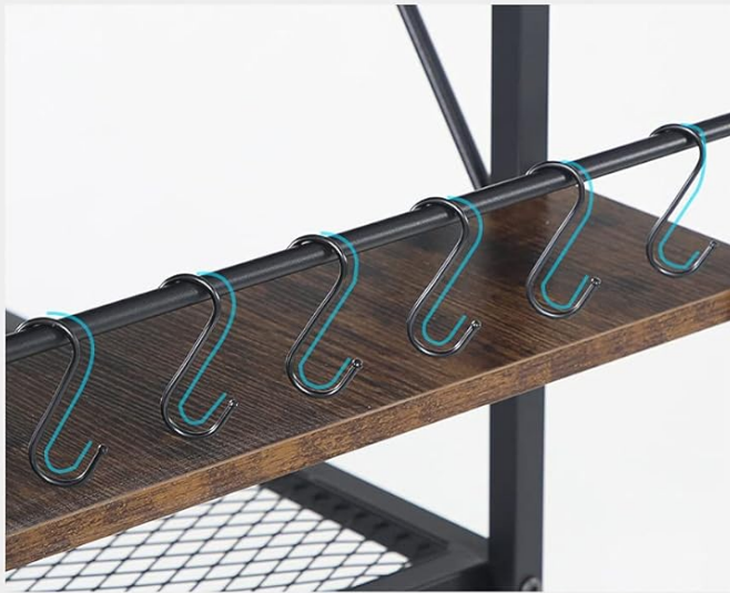
▲ 12 S-Shaped Hooks