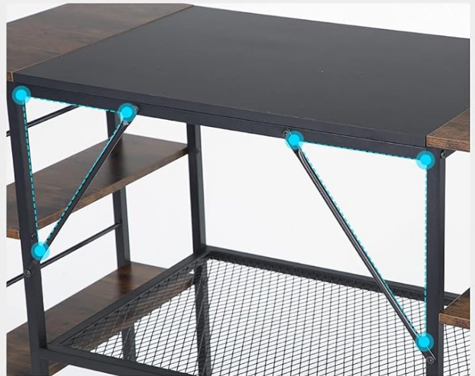
▲ Stable Triangular Design