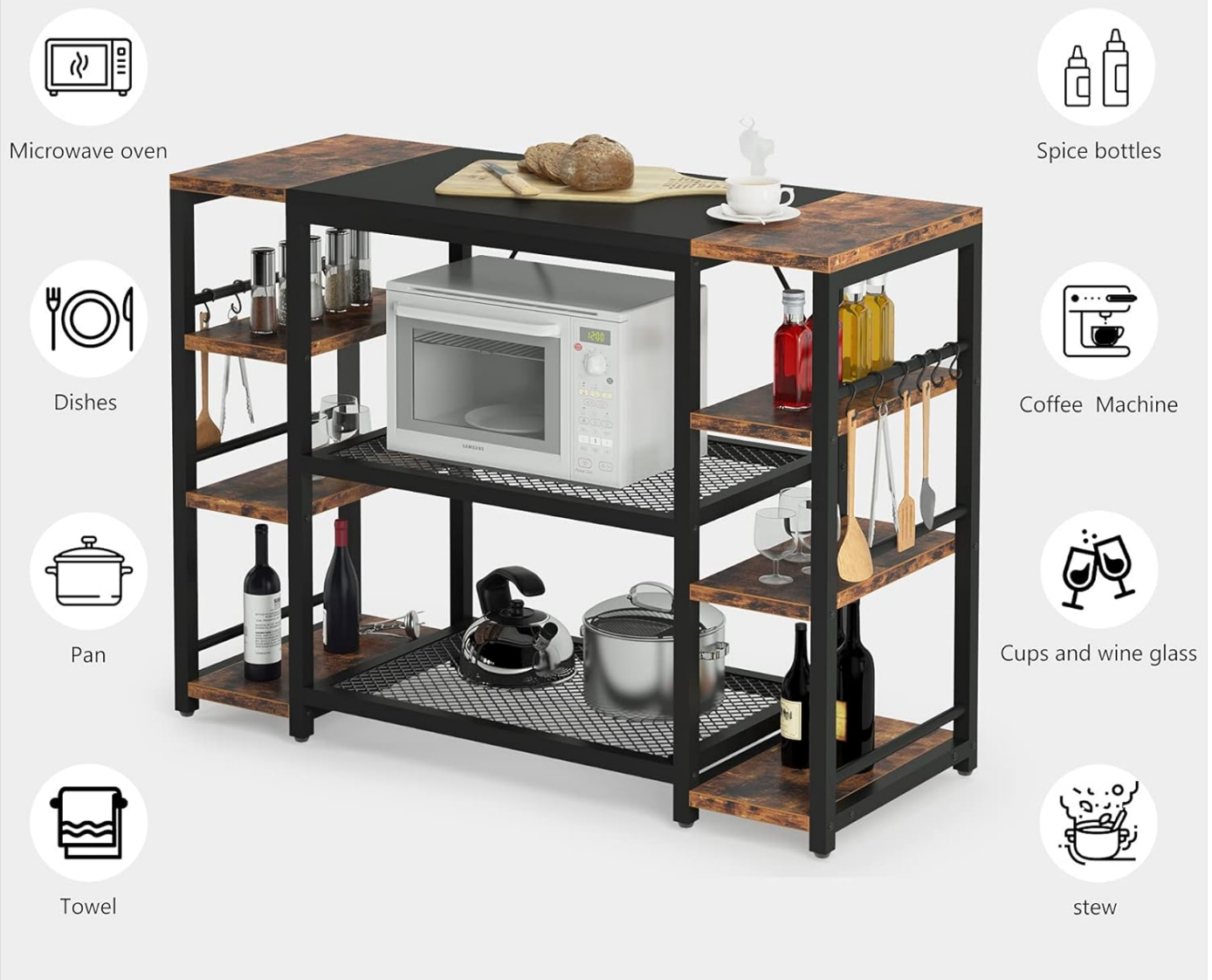
Figure 3: Example of Kitchen Island Storage and Organization

Satisfy your diverse storage requirement