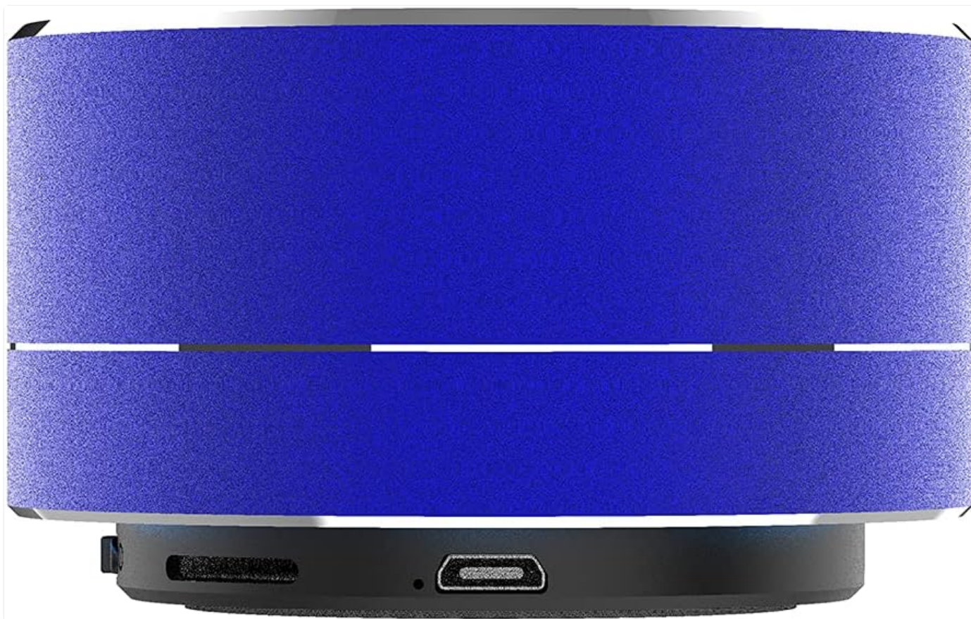
Figure 3: Side view of the speaker, showing the Micro USB charging port.