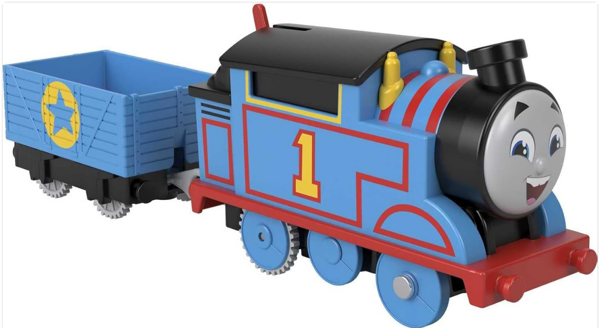
Image: The Thomas motorized engine with its cargo car, ready for play.

The THOMAS & FRIENDS Motorized Toy Train Thomas Engine is designed for preschool children aged 3 years and older. This battery-powered toy train, styled as Thomas, the No. 1 blue engine, includes a cargo car for imaginative play. It is compatible with most Thomas & Friends track sets, excluding wooden tracks, and can also operate on flat surfaces.