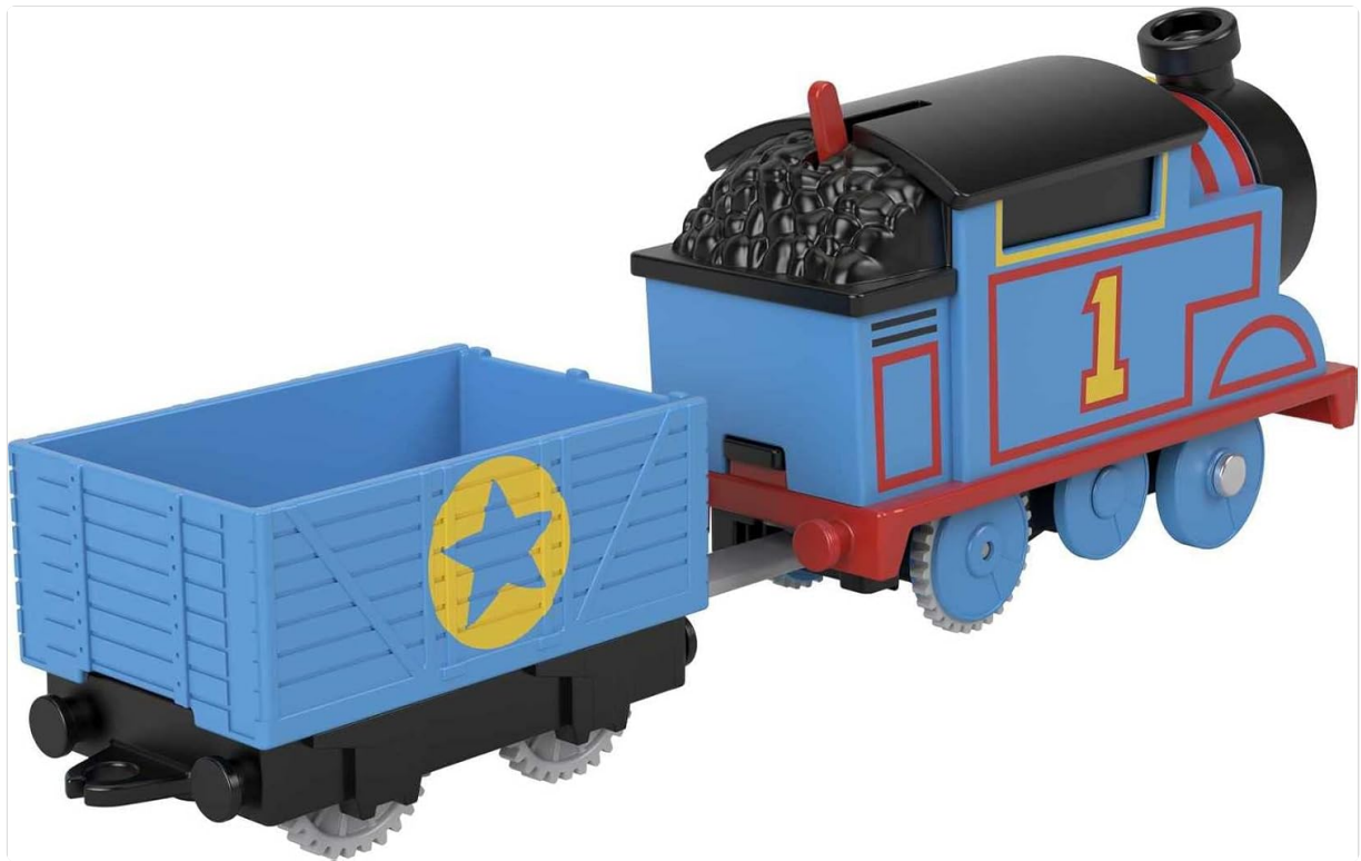
Image: Thomas engine connected to its cargo car.