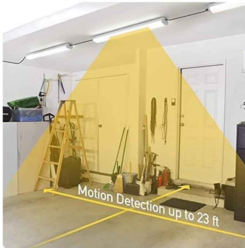
The light fixture shown flush mounted to the ceiling, providing a clean and integrated look.