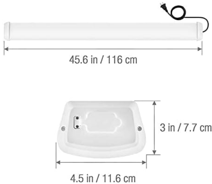
Detailed dimensions of the Koda 46" LED Shop Light fixture.