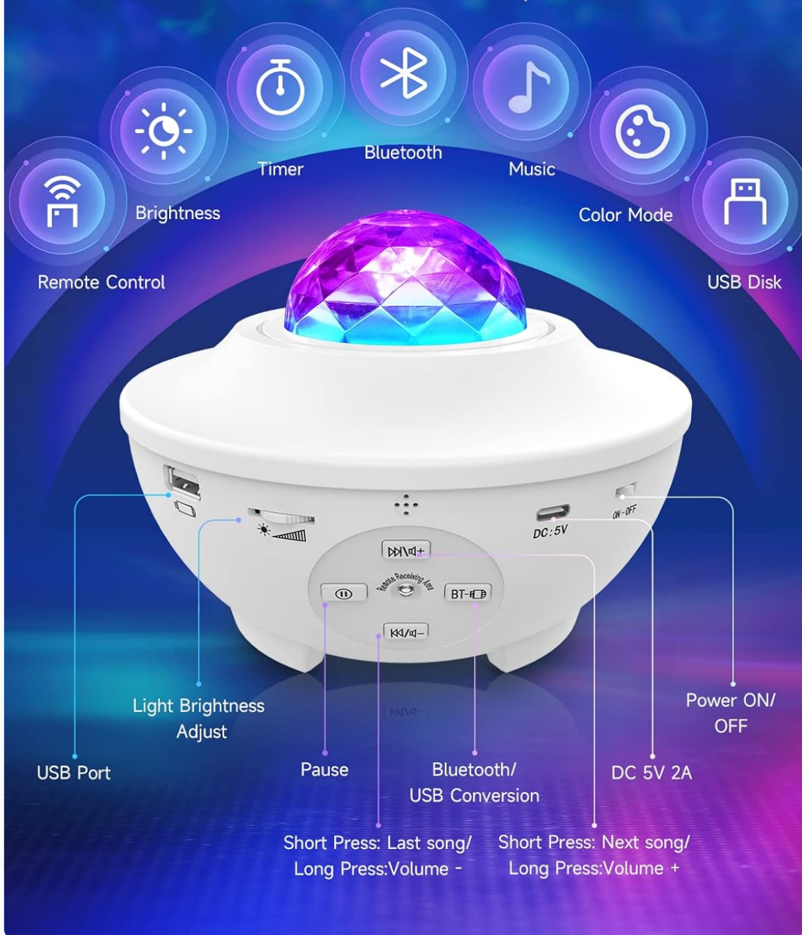
Image: A close-up of the projector's side, highlighting the USB port, power button, and various control buttons for light and sound functions.