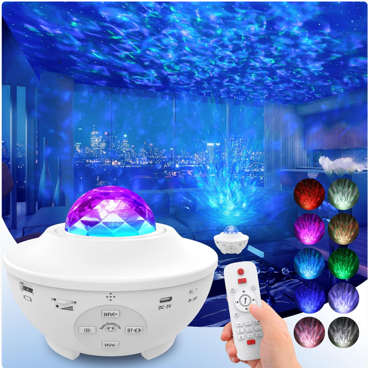
Image: The Vokpu Star Night Light 3 in 1 LED Galaxy Projector, showcasing its compact design, remote control, and a vibrant projection of stars and ocean waves on a ceiling.