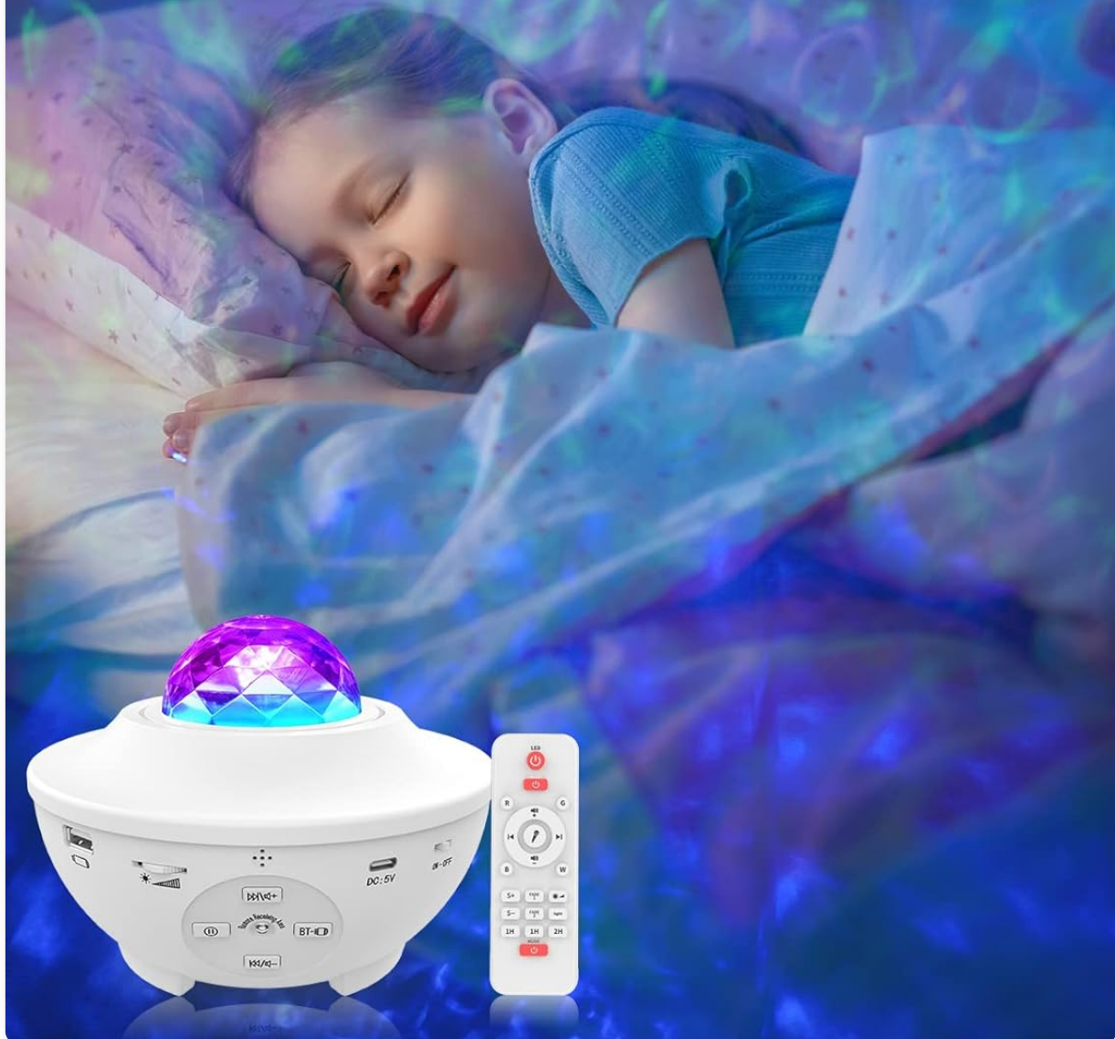
Image: A sleeping child in a room illuminated by the projector, with icons indicating the 1-hour, 2-hour, and "Time Off" timer options.