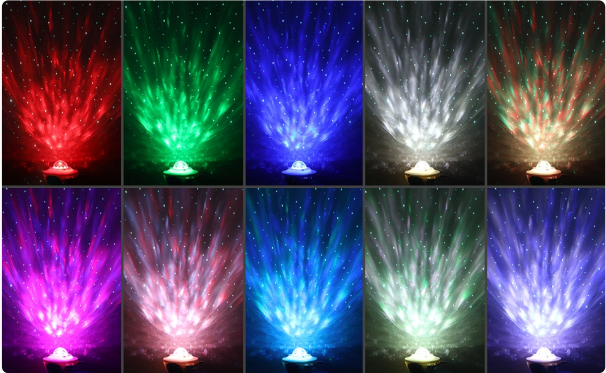
Image: A visual representation of the ten distinct color modes available for the galaxy projector, ranging from single colors to mixed hues.

The projector offers 10 combinations of lighting modes with 4 primary colors (red, green, blue, white) to create 20 kinds of multicolored or single-color effects. You can choose between ocean wave projection, star projection, or a combination of both.