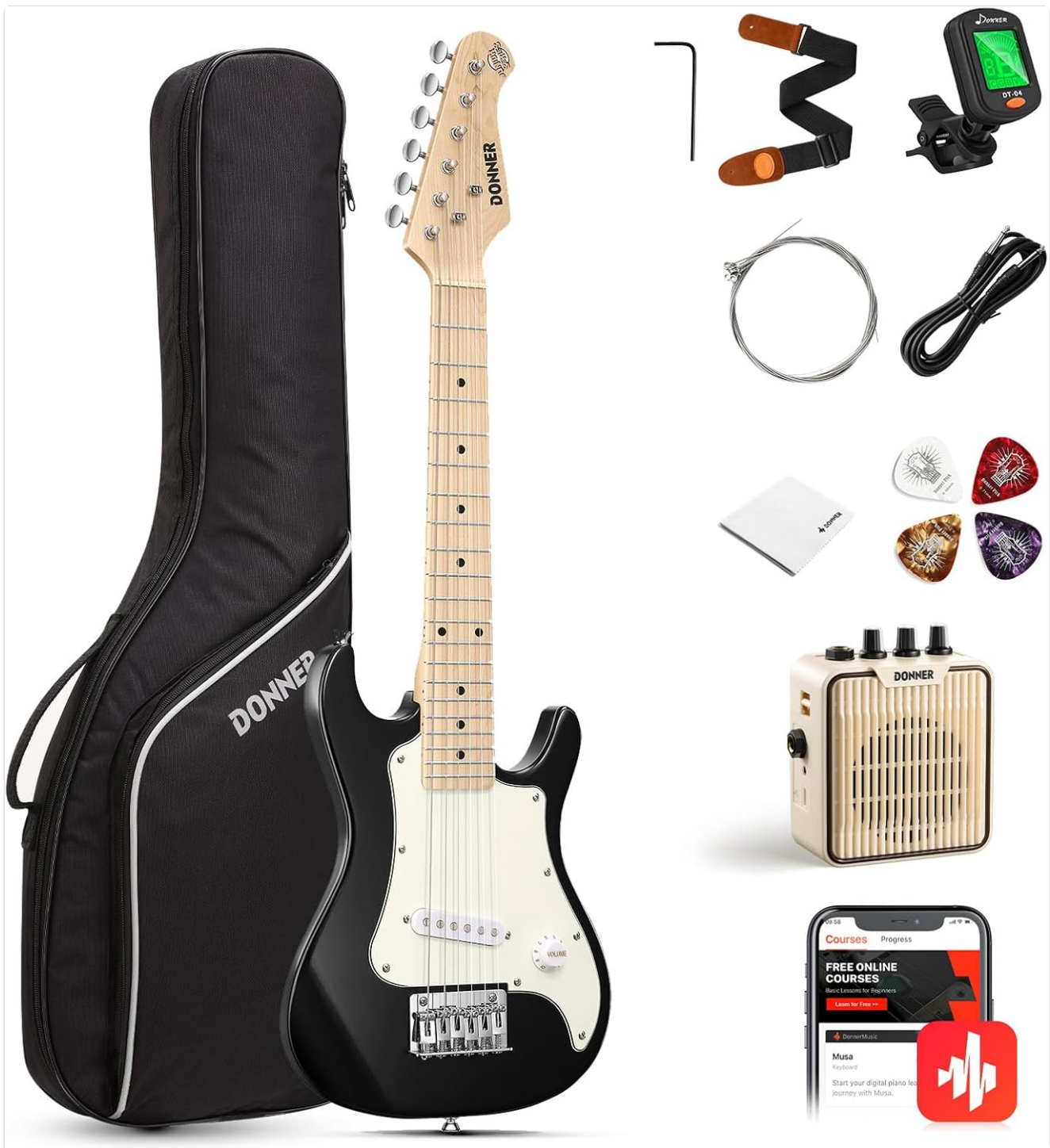
Figure 1: Donner 30 Inch Kids Electric Guitar (Black ST-30 INCH model).