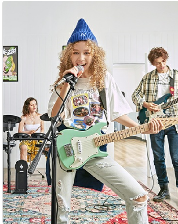
Figure 4: A child demonstrating the comfortable size and playability of the Donner mini electric guitar.