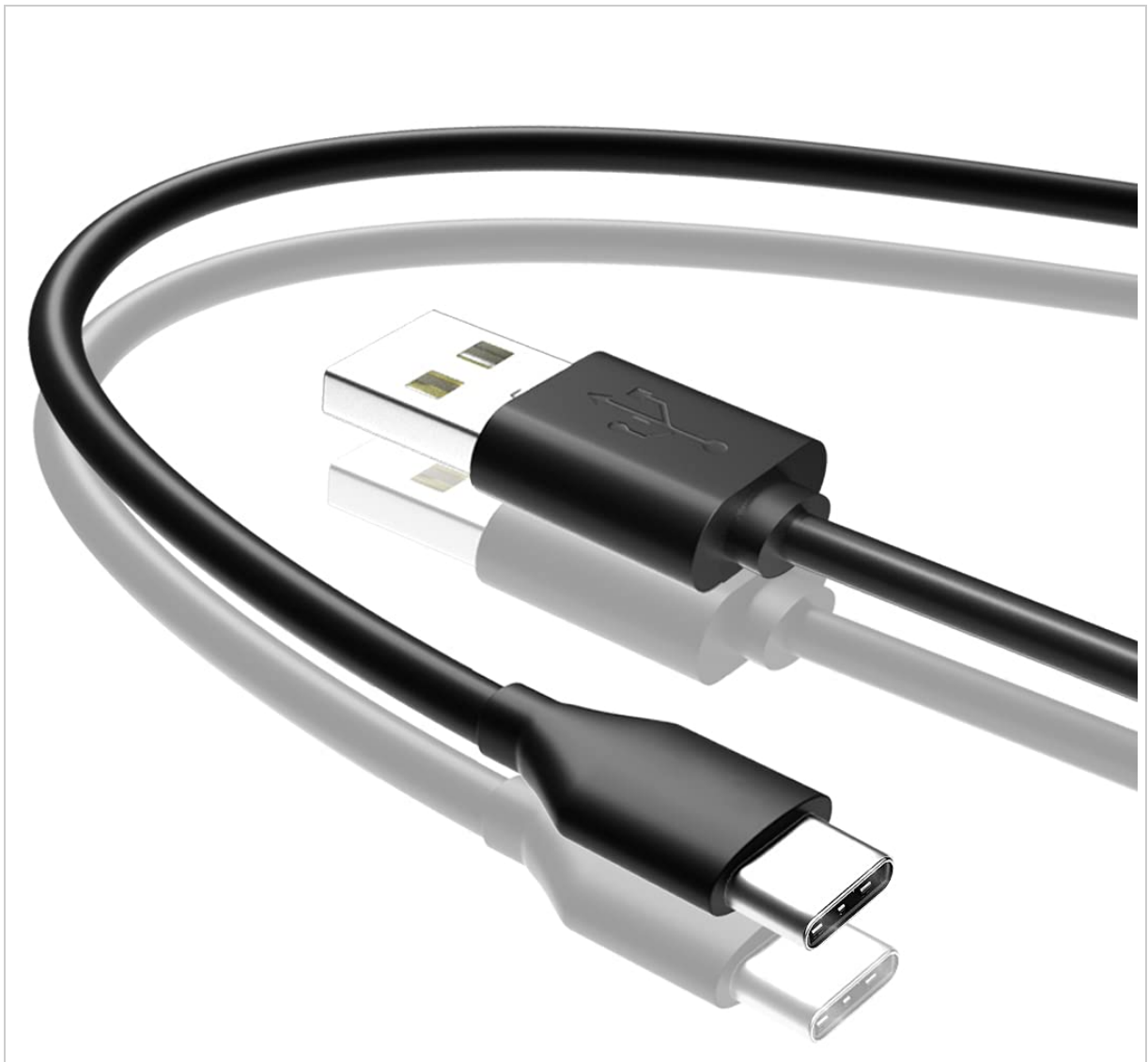
Image 1: SIOCEN USB-C Charging Cable showing both USB-A and USB-C connectors.