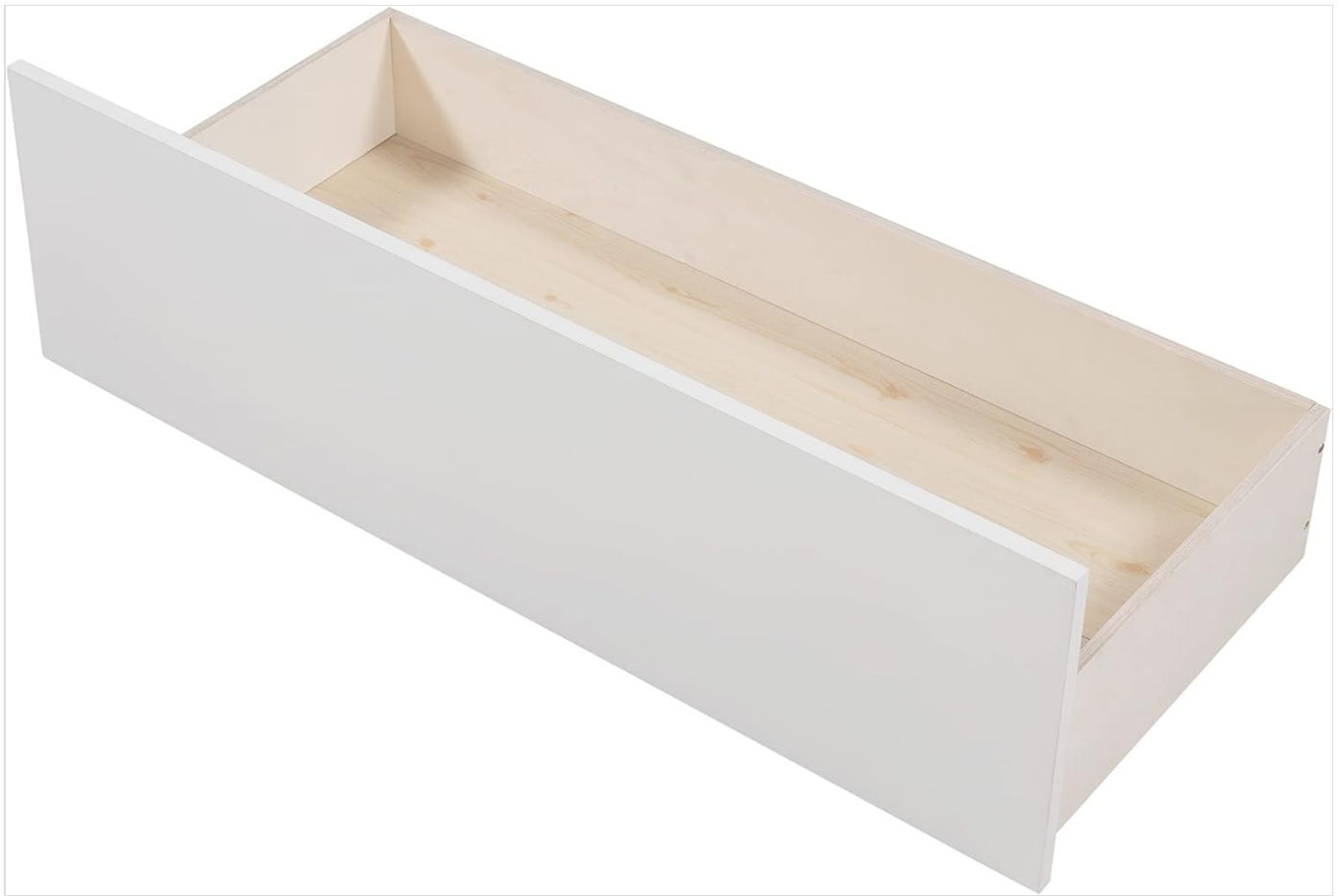
Image: A close-up view of one of the under-bed storage drawers, showing its interior and construction.