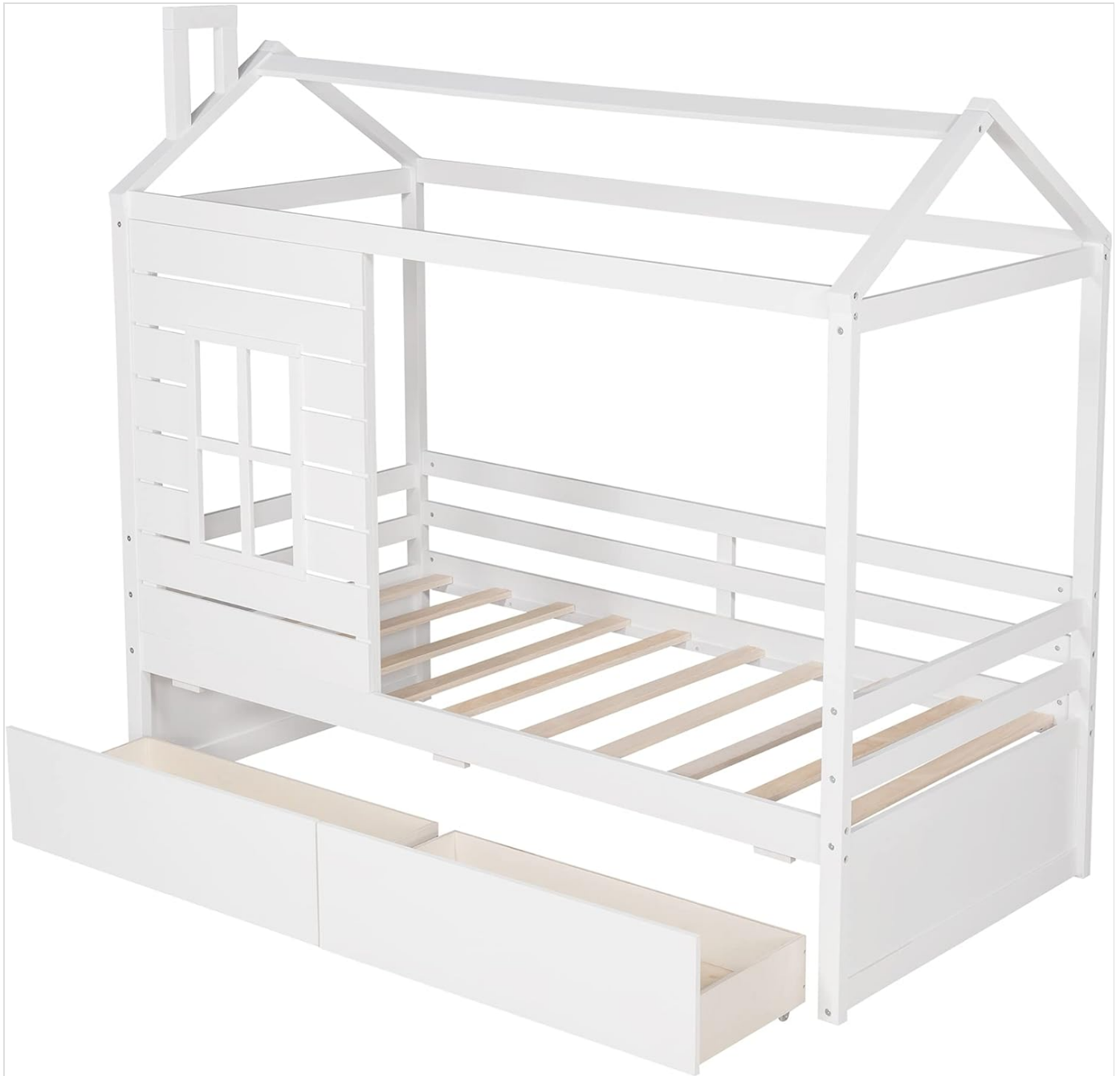
Image: The bed frame with both storage drawers extended, showing the internal structure and slat support.

Important: Do not overtighten screws, as this may damage the wood. Hand-tighten all fasteners initially, then fully tighten once the entire section is assembled and aligned. For the bed slats, avoid using power drills to prevent cracking the wood.