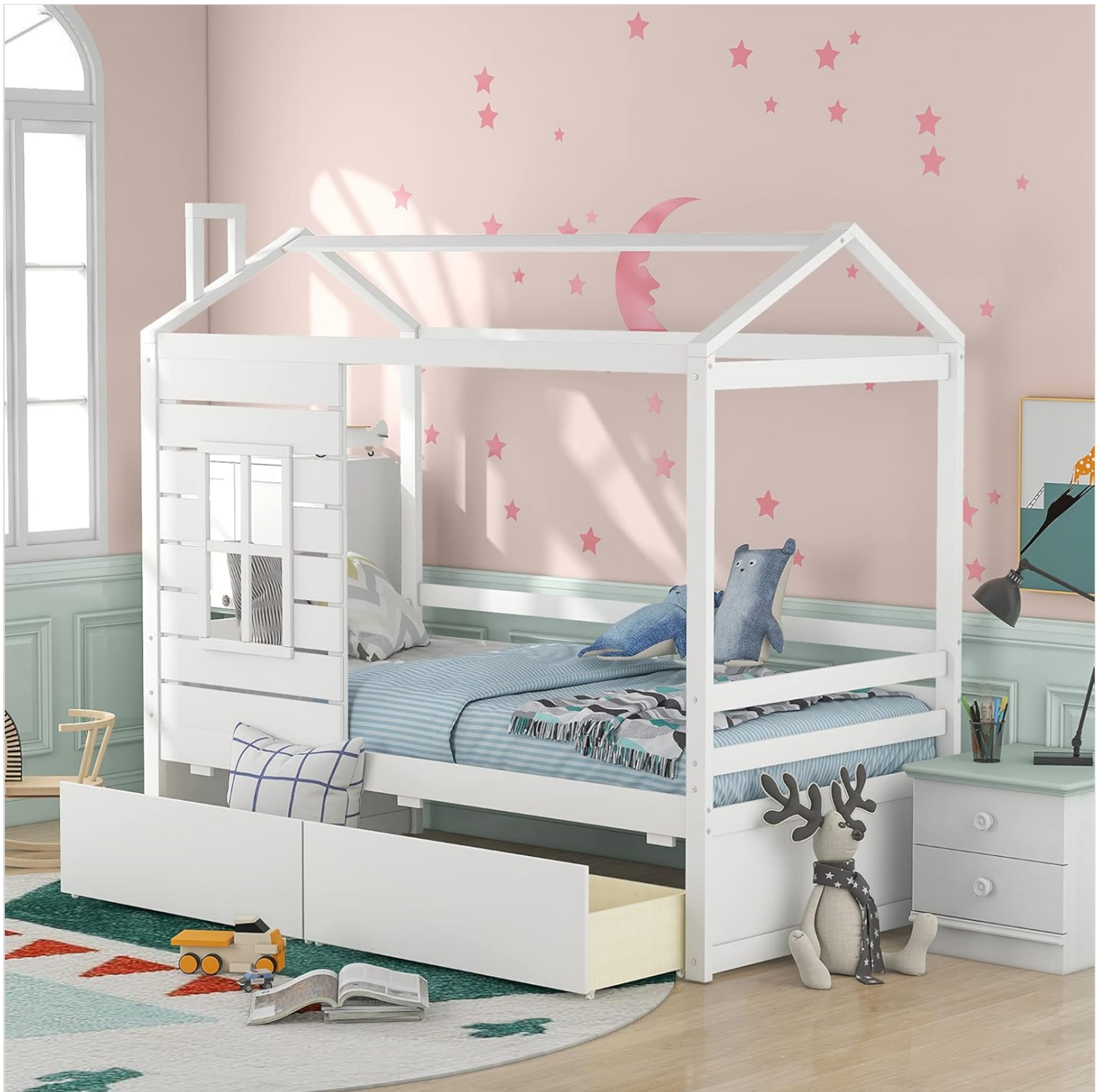
Image: The Twin House Bed with a mattress and bedding, situated in a child's bedroom, showcasing its design and functionality.