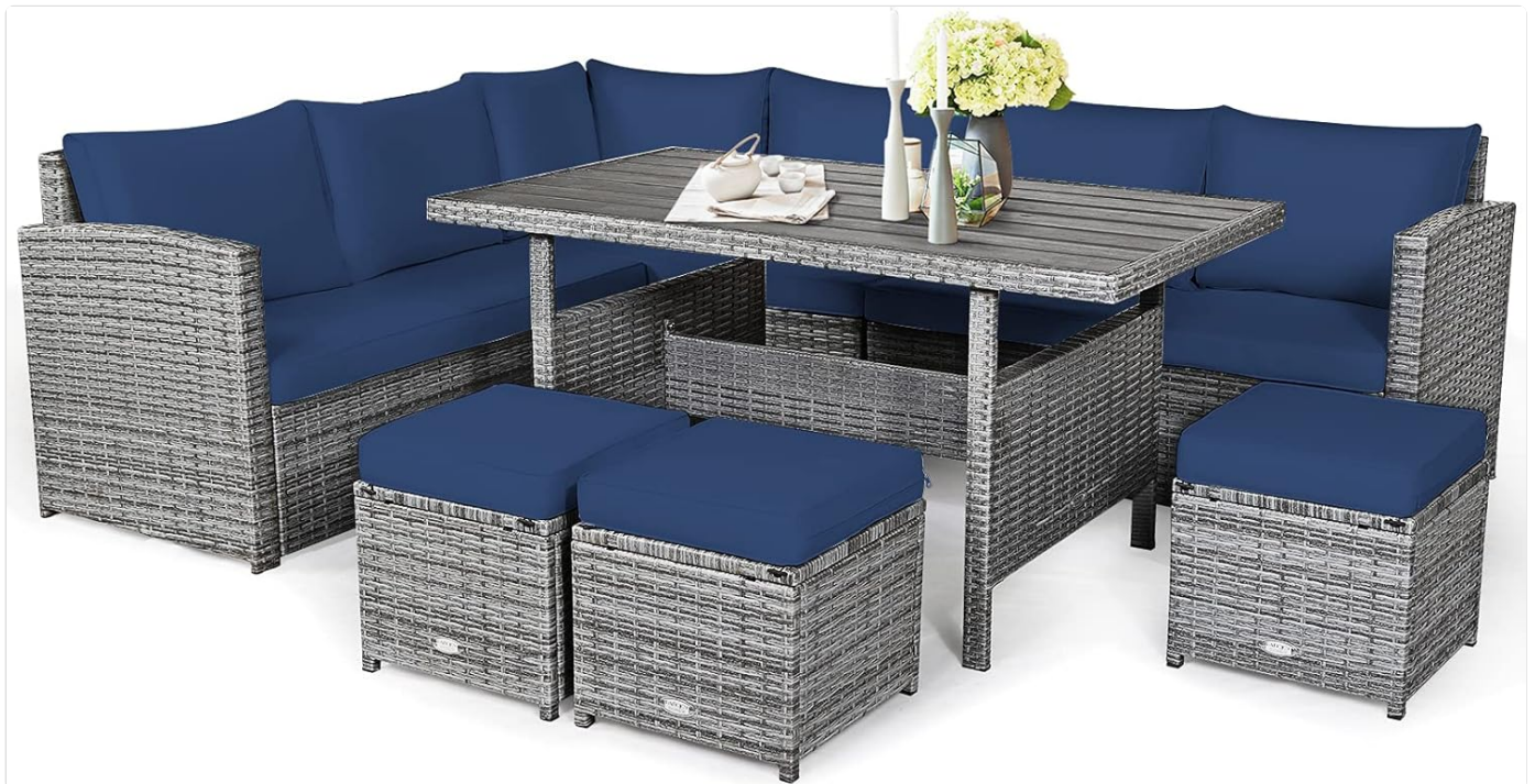
Image: The complete Tangkula 7 Pieces Patio Furniture Set in Navy Blue, featuring a sectional sofa, dining table, and ottomans.

This manual provides comprehensive instructions for the assembly, operation, maintenance, and troubleshooting of your Tangkula 7 Pieces Patio Furniture Set. This set is designed to enhance your outdoor living space with its versatile configuration and durable construction. Please read this manual thoroughly before assembly and use to ensure proper setup and longevity of your furniture.