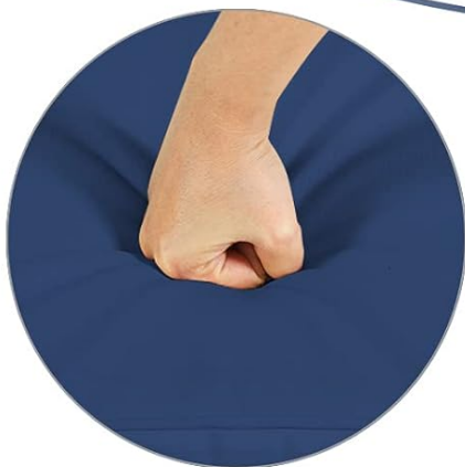
Resilient Sponge Cushion