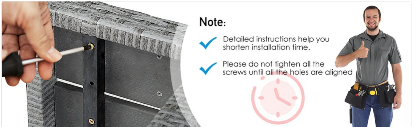
Image: An illustration emphasizing the importance of not fully tightening screws until all holes are aligned during assembly to ensure proper fit and reduce installation time.