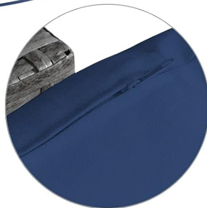
Removable Cushion Cover

Image: A visual guide demonstrating different possible arrangements and free combinations of the corner chairs, ottomans, and table to meet various spatial and functional needs.