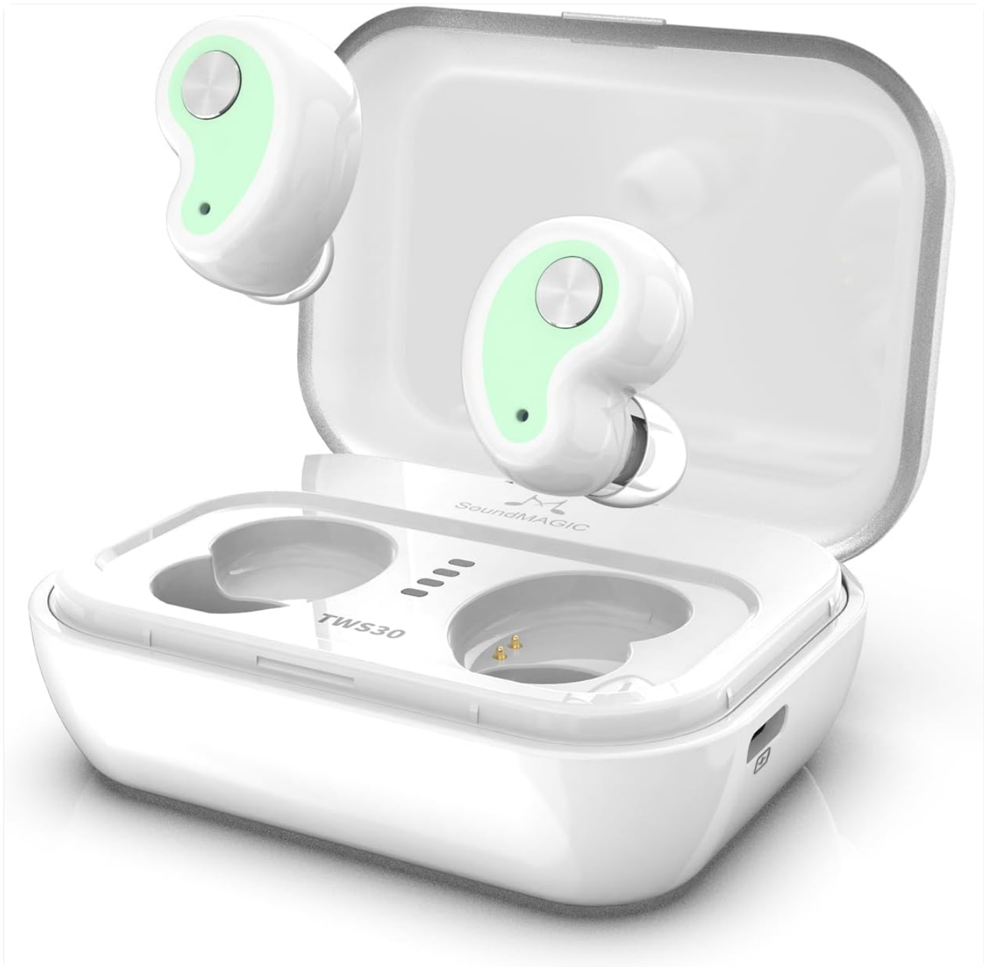
Image: SoundMAGIC TWS30 G2 True Wireless Earbuds in their open charging case, showcasing the earbuds and charging contacts.