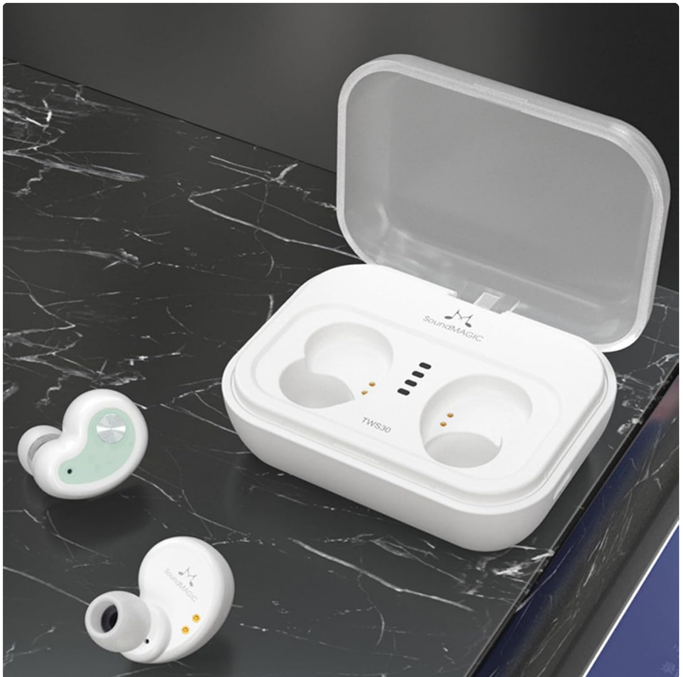
Image: The SoundMAGIC TWS30 G2 earbuds and their charging case displayed on a dark, reflective surface.