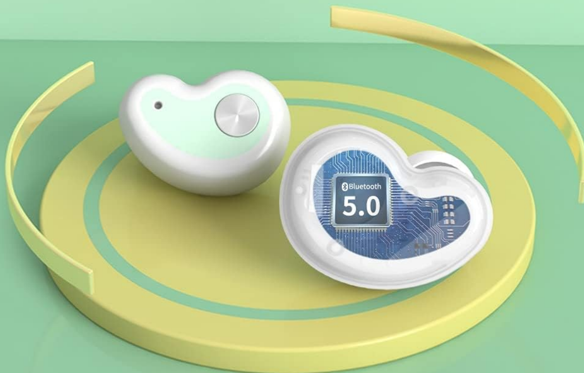
Image: A graphic emphasizing the stable Bluetooth 5.0 connection and 13m transmission range of the earbuds.