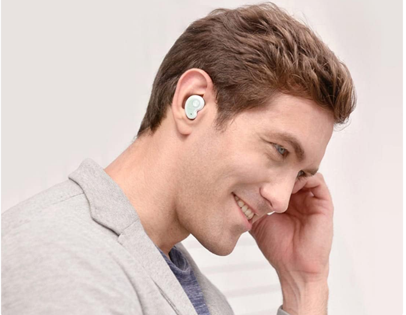
Image: A visual representation of the earbuds and charging case, highlighting the 30-hour total playtime.