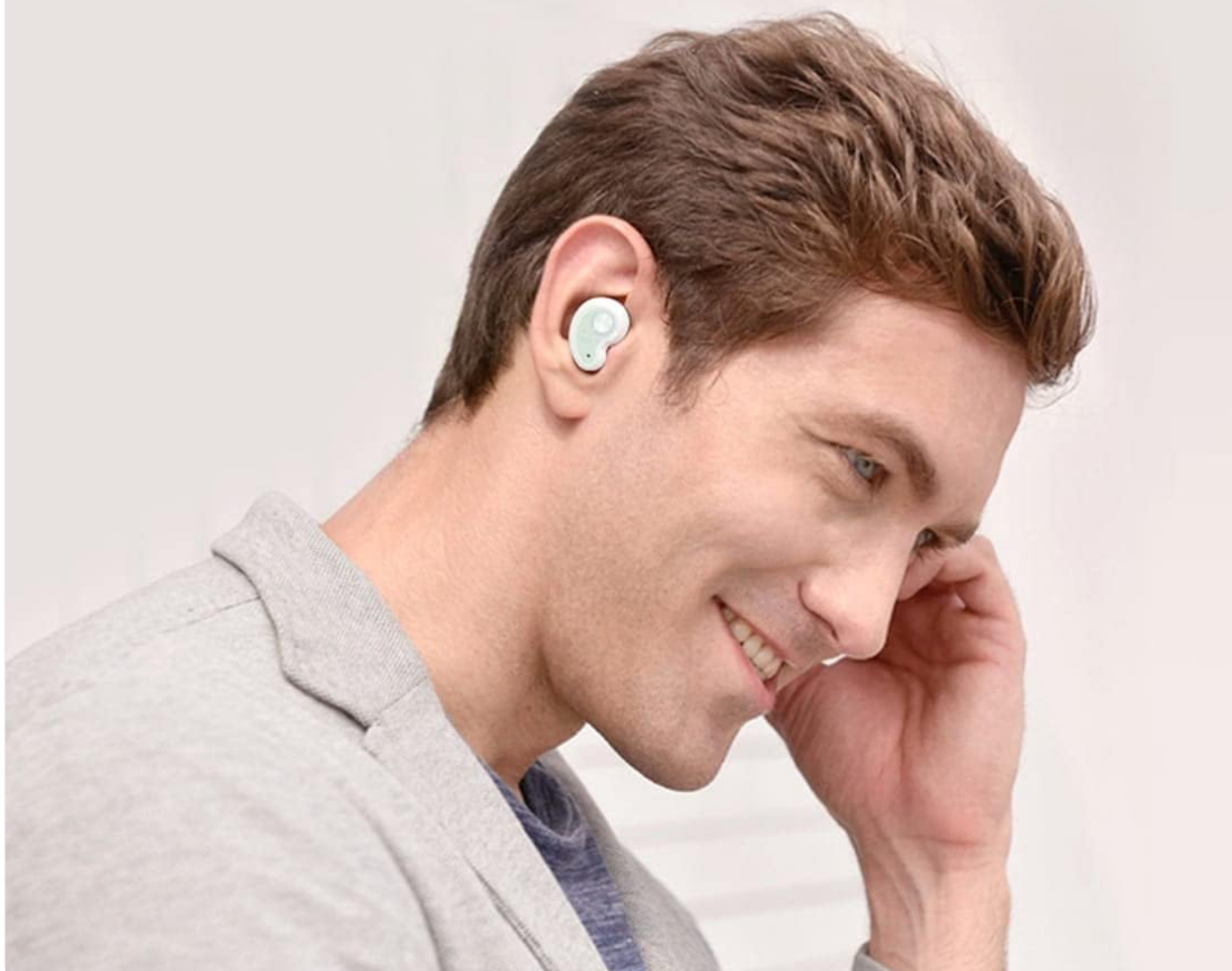
Image: A visual representation of the earbuds and charging case, highlighting the 30-hour total playtime.