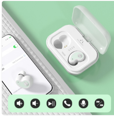
Image: A visual guide to the touch controls on the SoundMAGIC TWS30 G2 earbuds.