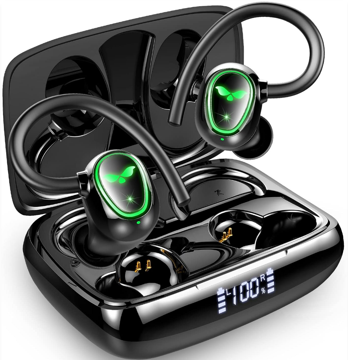
Figure 1: Ordtop i21L Wireless Earbuds in their charging case.