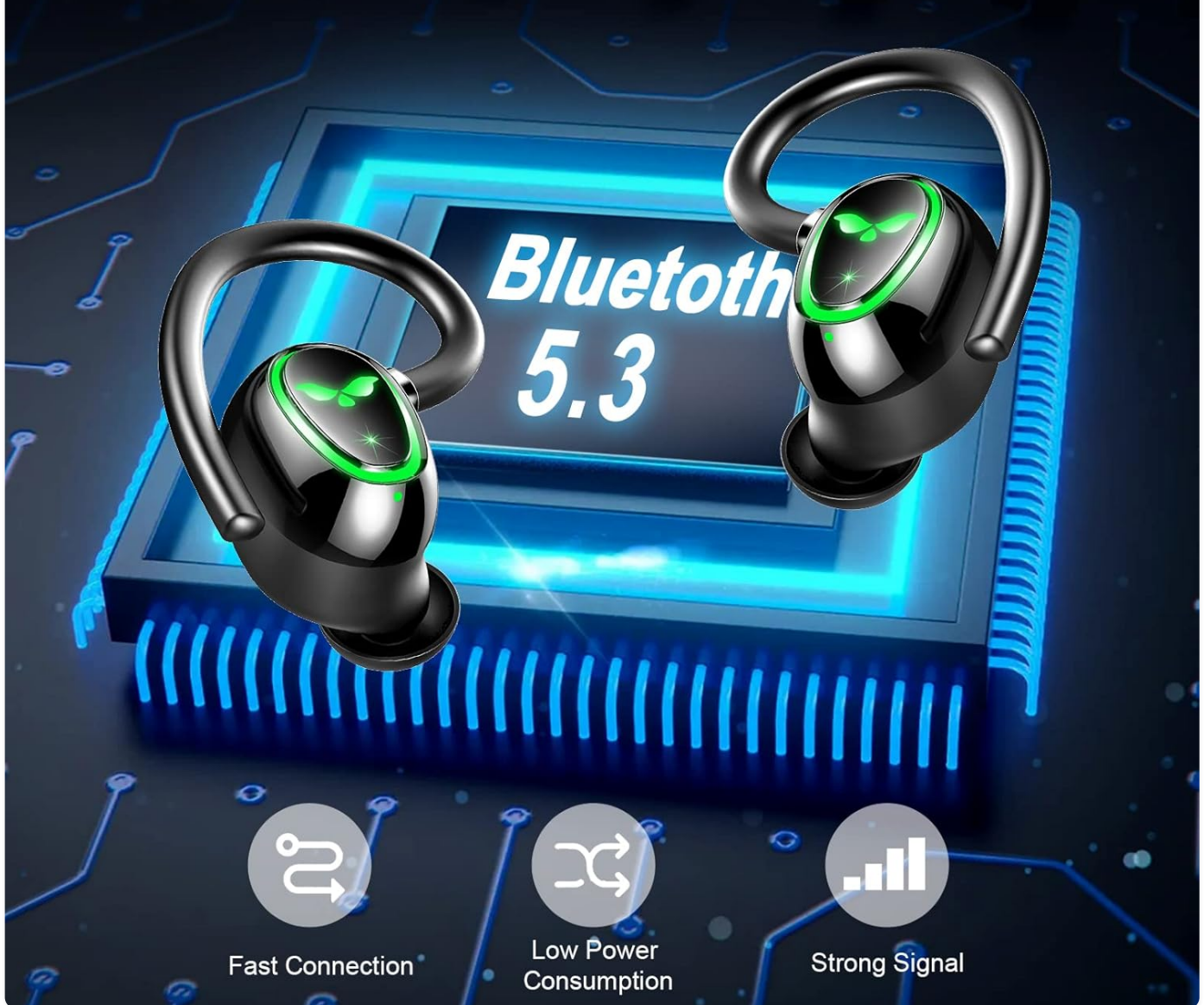
Figure 4: Illustration of the advanced Bluetooth 5.3 chip for stable connection.

Latest Bluetooth 5.3 Not Only Achieve 3X High-Speed Transmission Efficiency, But Also Can Achieve A Connection Distance Of About 15 Meters.