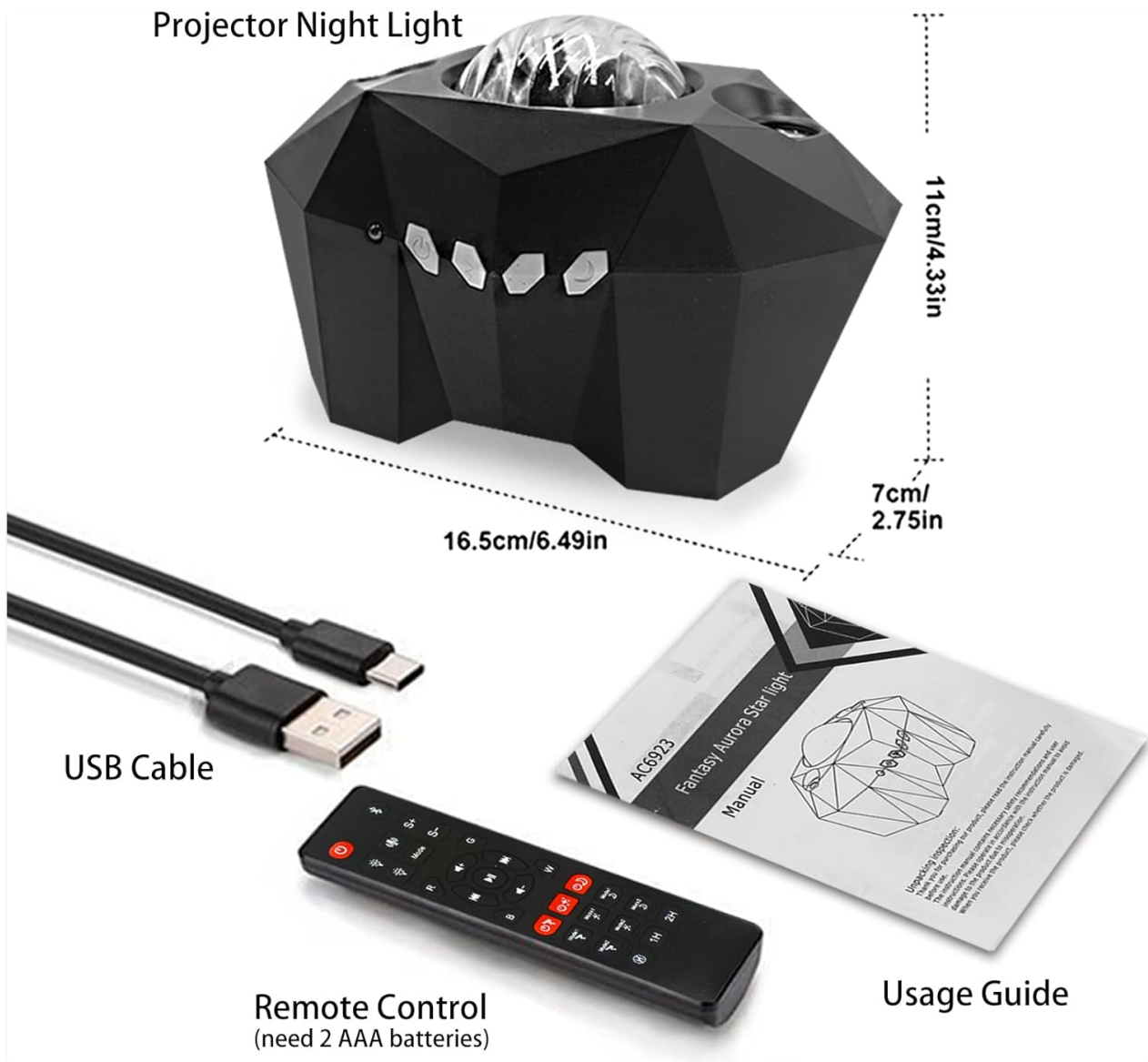
Image: Contents of the product package, including the projector, remote, USB cable, and user guide.