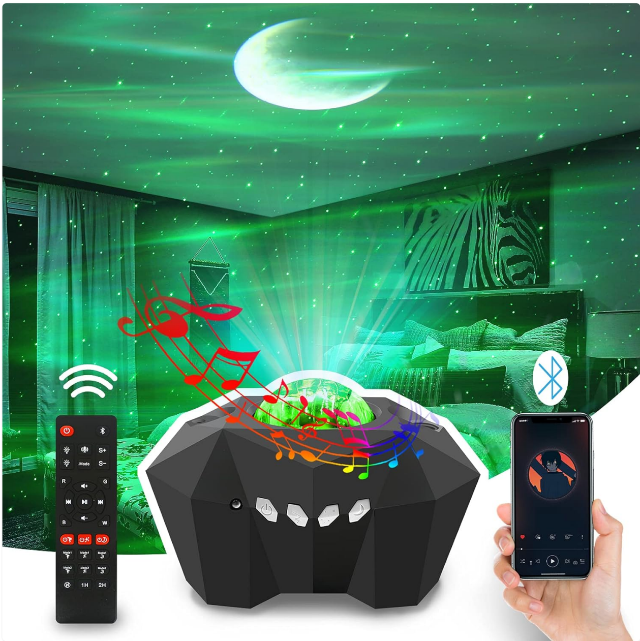
Image: The Cupohus projector displaying aurora, moon, and stars on a ceiling, with the remote and a smartphone showing music playback.