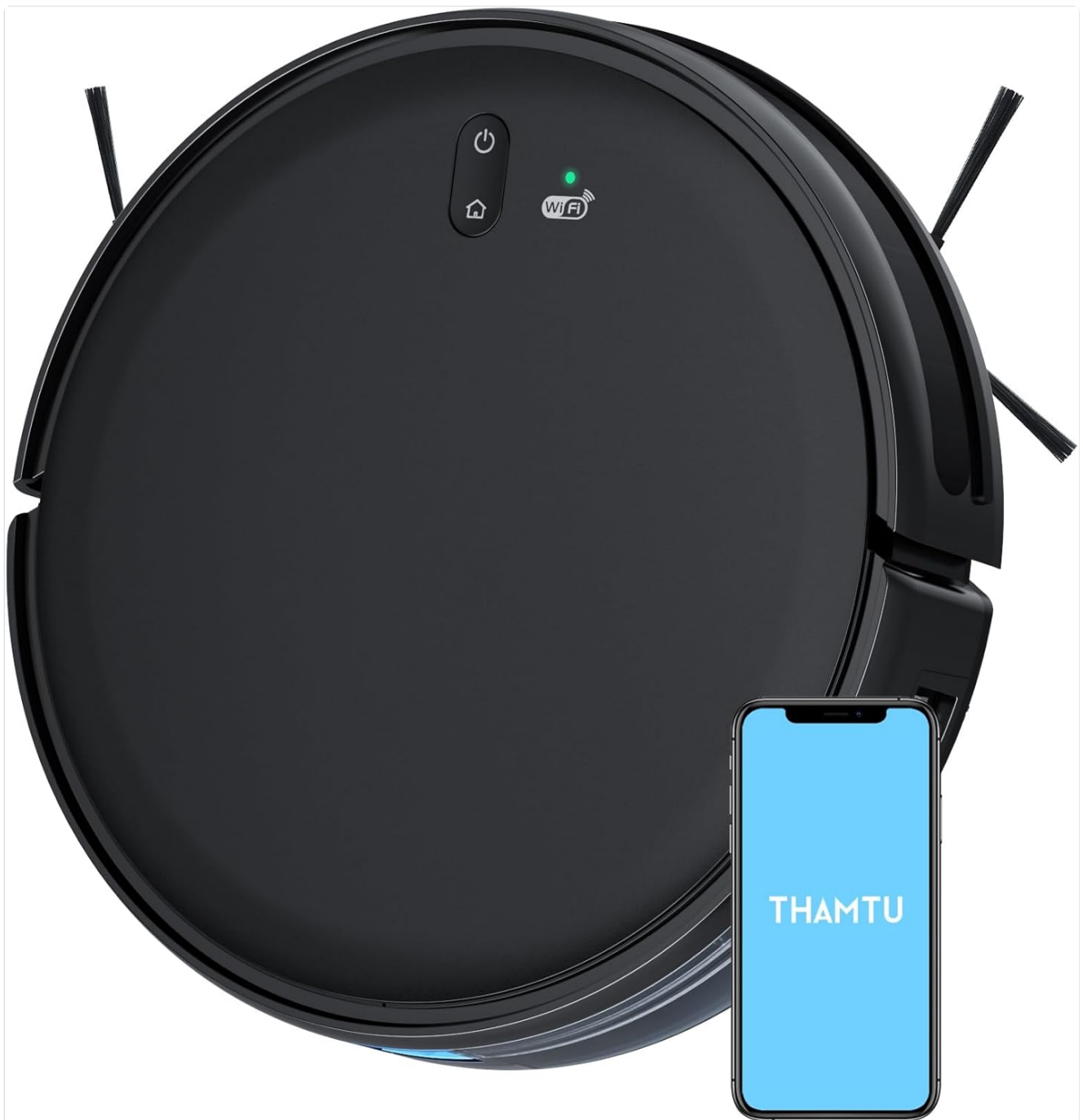
Figure 2.1: Thamtu G10 Robot Vacuum Cleaner and companion app.