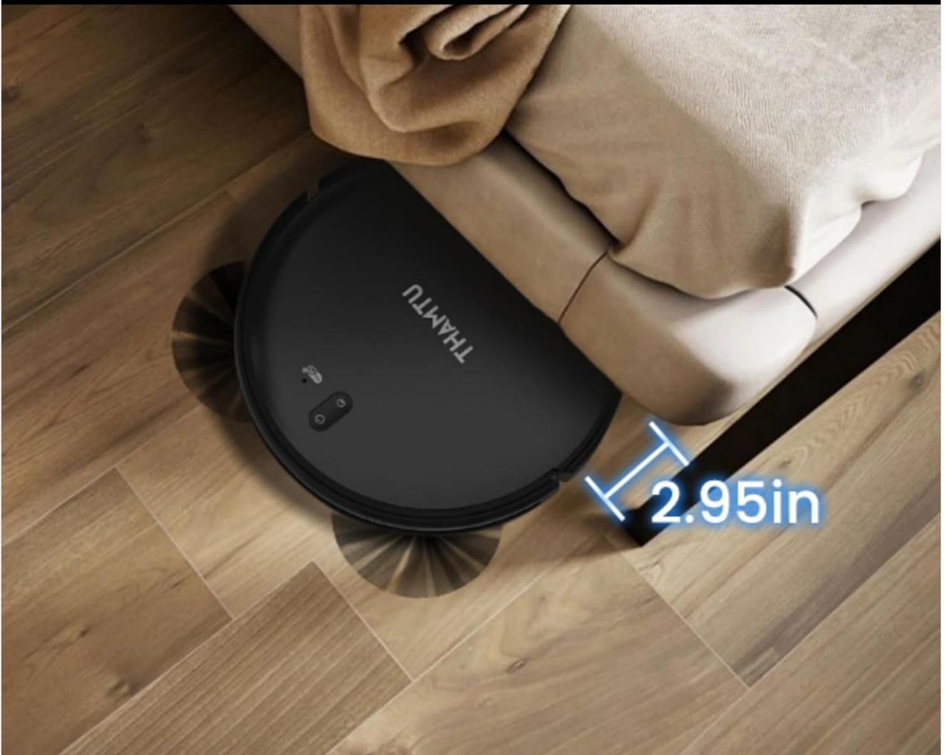
Figure 2.4: Compact design allows cleaning in hard-to-reach places.

Compact design can reach more places for cleaning