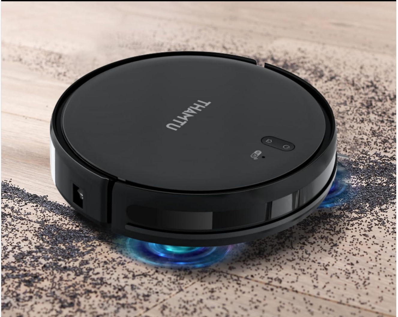
Figure 2.2: Powerful vacuuming capability on hard floors.

Picks up debris on hardfloors and low-pile carpets