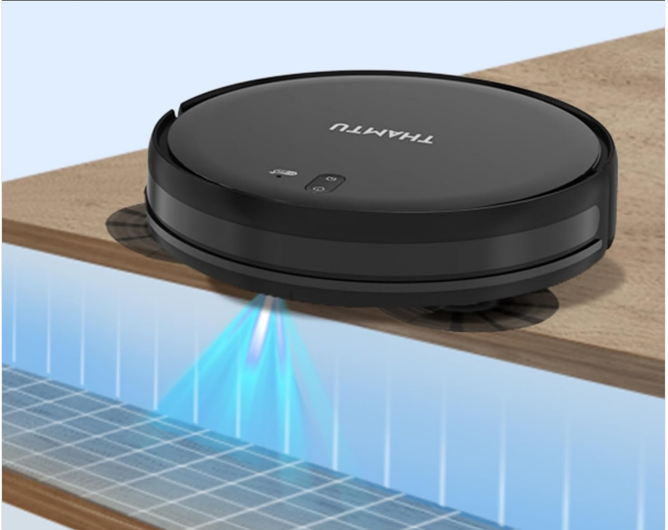
Figure 2.5: Anti-drop technology prevents falls from stairs and ledges.

Prevent robot cleaner from falling down from stairs and off of edges