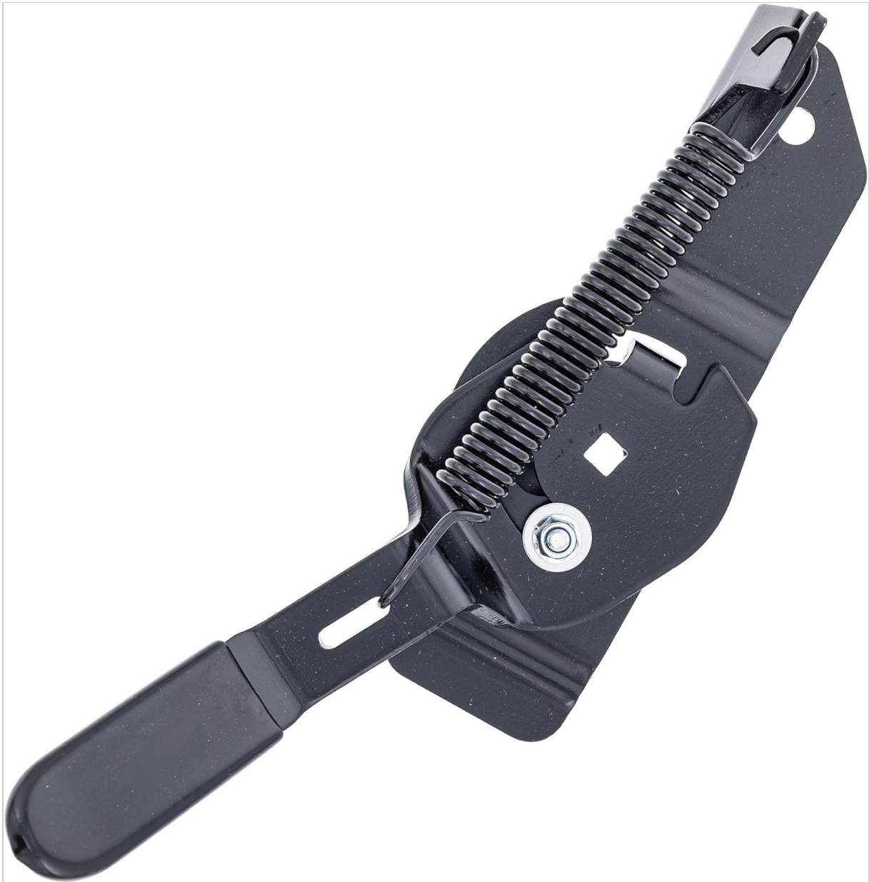
Figure 5: Control Lever Assembly.