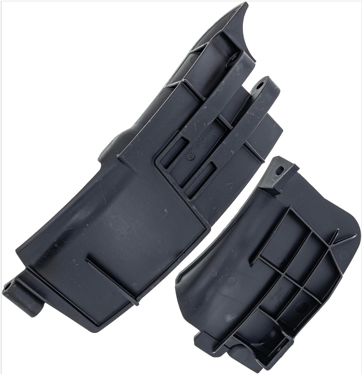
Figure 4: Mulching Baffle Components (underside view).