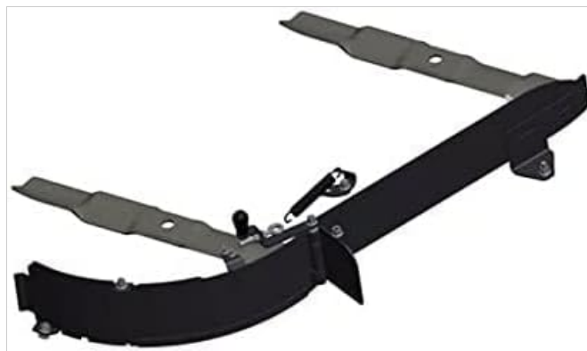
Figure 3: Mulching Baffle Assembly.

The mulching baffle assembly directs grass clippings within the deck for optimal mulching.