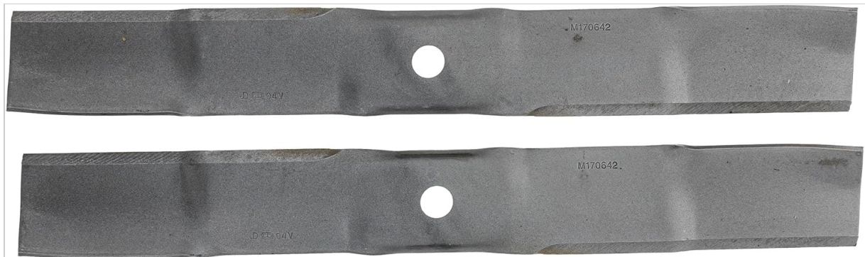
Figure 2: John Deere Mulching Blades (M170642).

The kit includes specialized mulching blades. These blades are designed to cut grass into finer pieces for mulching.