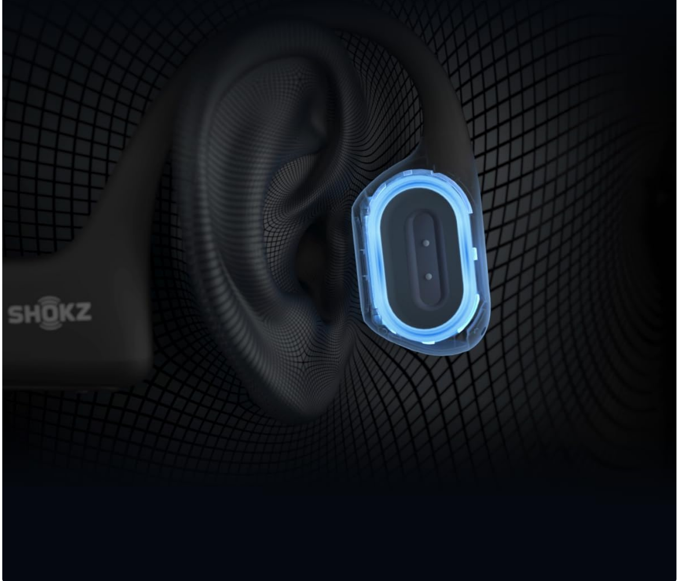
Image: A close-up of the SHOKZ OpenRun Pro headphones showing the magnetic charging port and the magnetic charging cable connected.