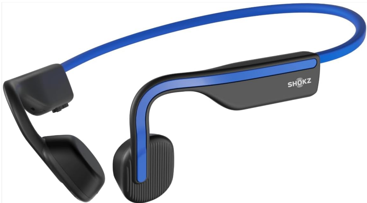
Image: SHOKZ OpenMove headphones in blue, showcasing their open-ear design.

The SHOKZ OpenMove are open-ear Bluetooth sport headphones designed for comfort and situational awareness. Utilizing bone conduction technology, these wireless earphones provide audio without blocking your ear canals, making them ideal for activities like running and workouts. This manual provides essential information for setting up, operating, and maintaining your OpenMove headphones.