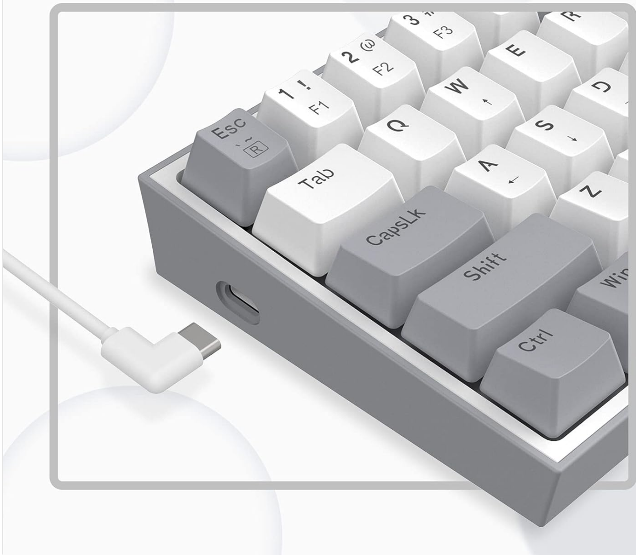
Figure 3: Customizable 16.8 million color RGB backlit keyboard.