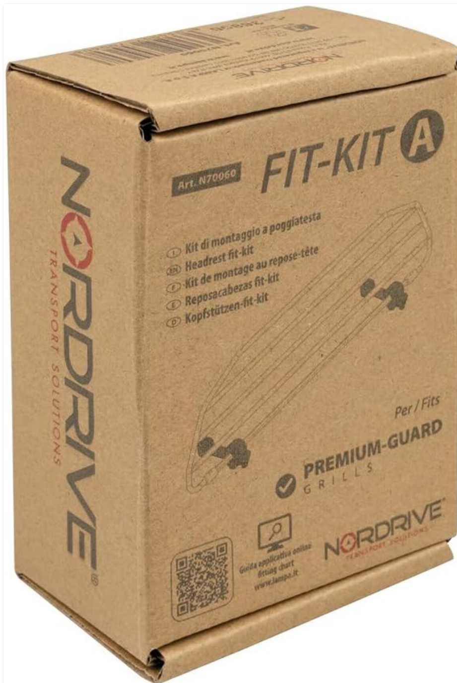
Image of the retail packaging for the NORDRIVE N70060 Fit-Kit A, indicating its model number and compatibility with Premium-Guard grilles.

The NORDRIVE N70060 Fit-Kit A typically includes: