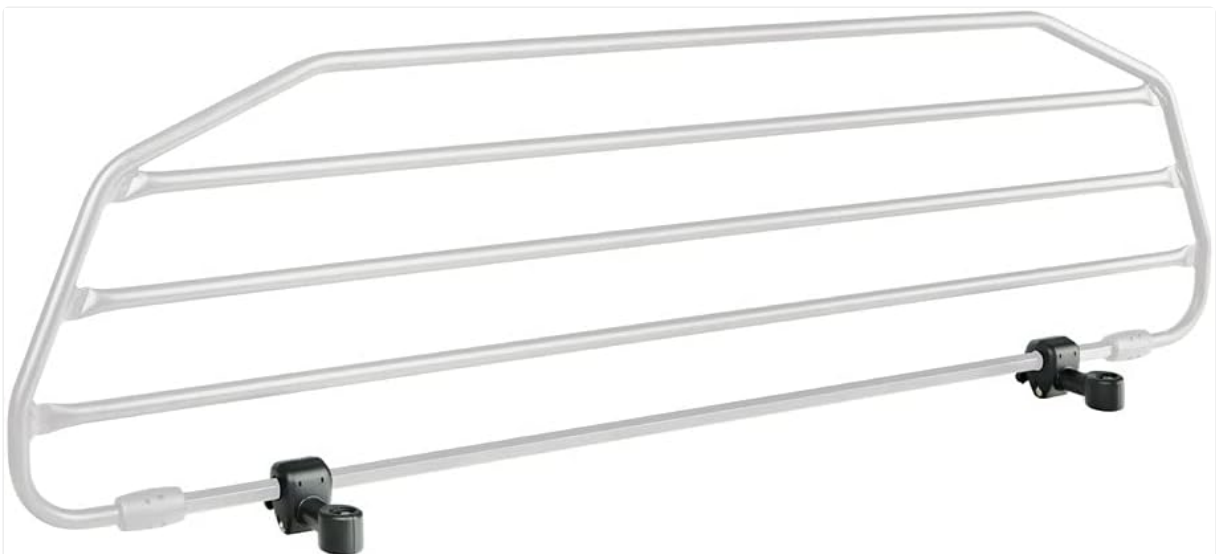
Illustration demonstrating how the N70060 Fit-Kit A connects to a NORDRIVE Premium-Guard pet barrier grille, providing the attachment points for the vehicle's headrests.