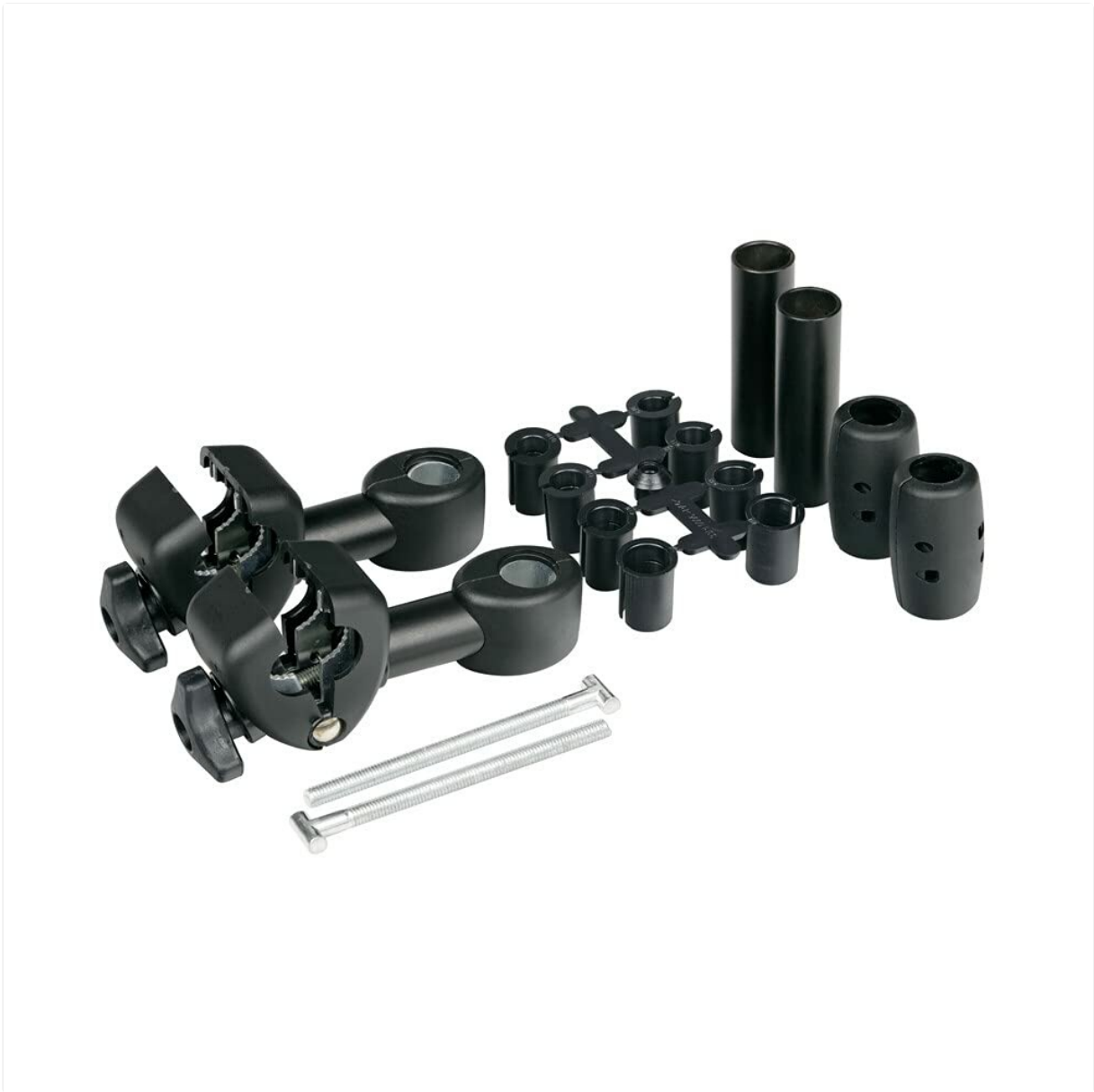
Image showing the individual components of the NORDRIVE N70060 Fit-Kit A, including the adjustable clamps and connecting bars designed to attach to vehicle headrest posts.