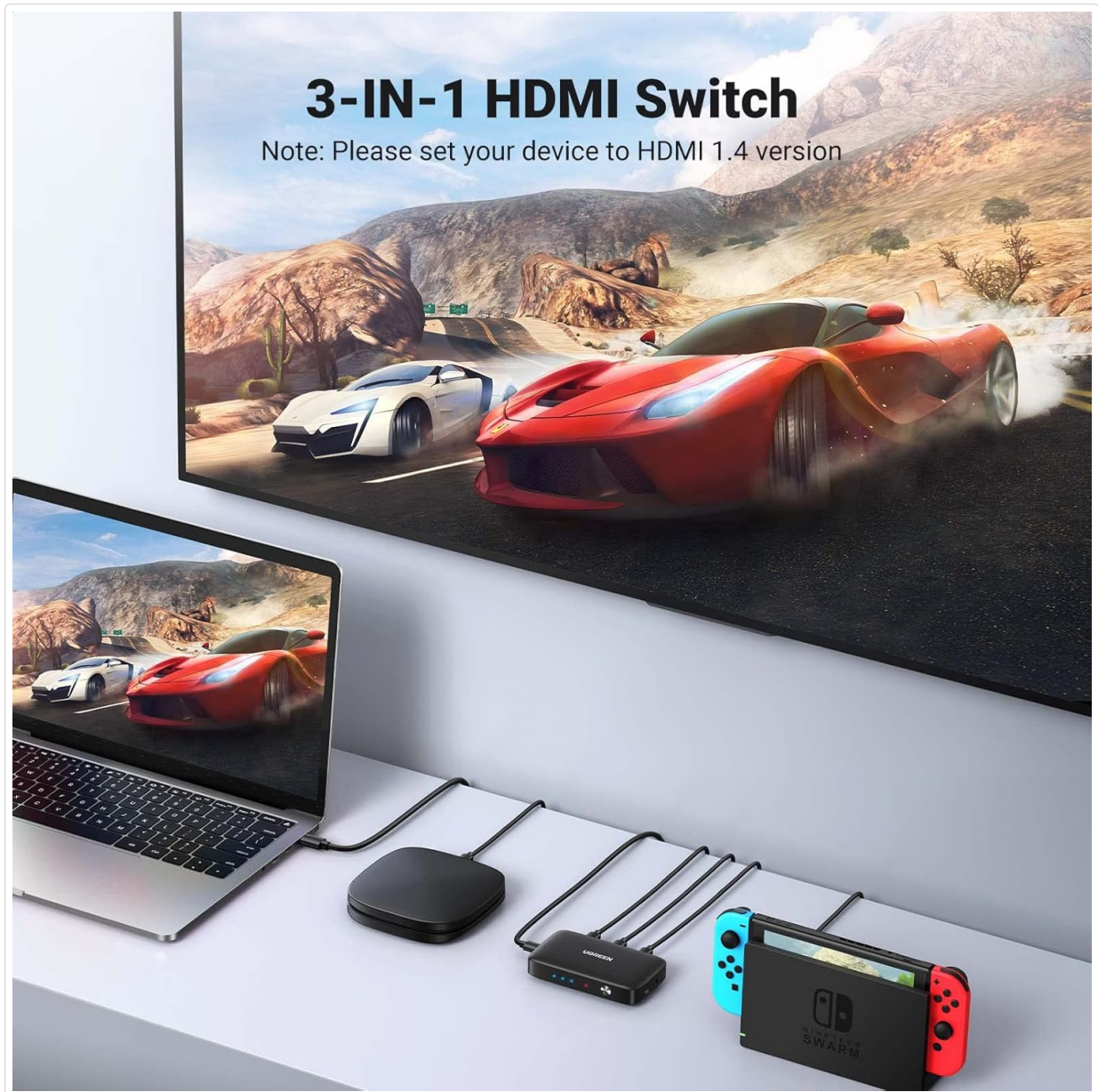
Image: A visual representation of the UGREEN HDMI Switch connected between multiple source devices (laptop, game console) and a television display.