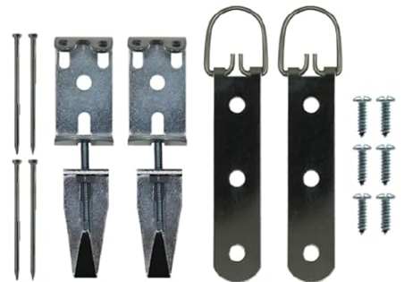
Figure 1: Included components of the Mirror Hanging Kit.

One kit includes (4) Large Strap Hangers for each mirror, (4) Adjustable J-Hooks for each mirror, (12) #6 x 1/2" Screws and (8) Nails