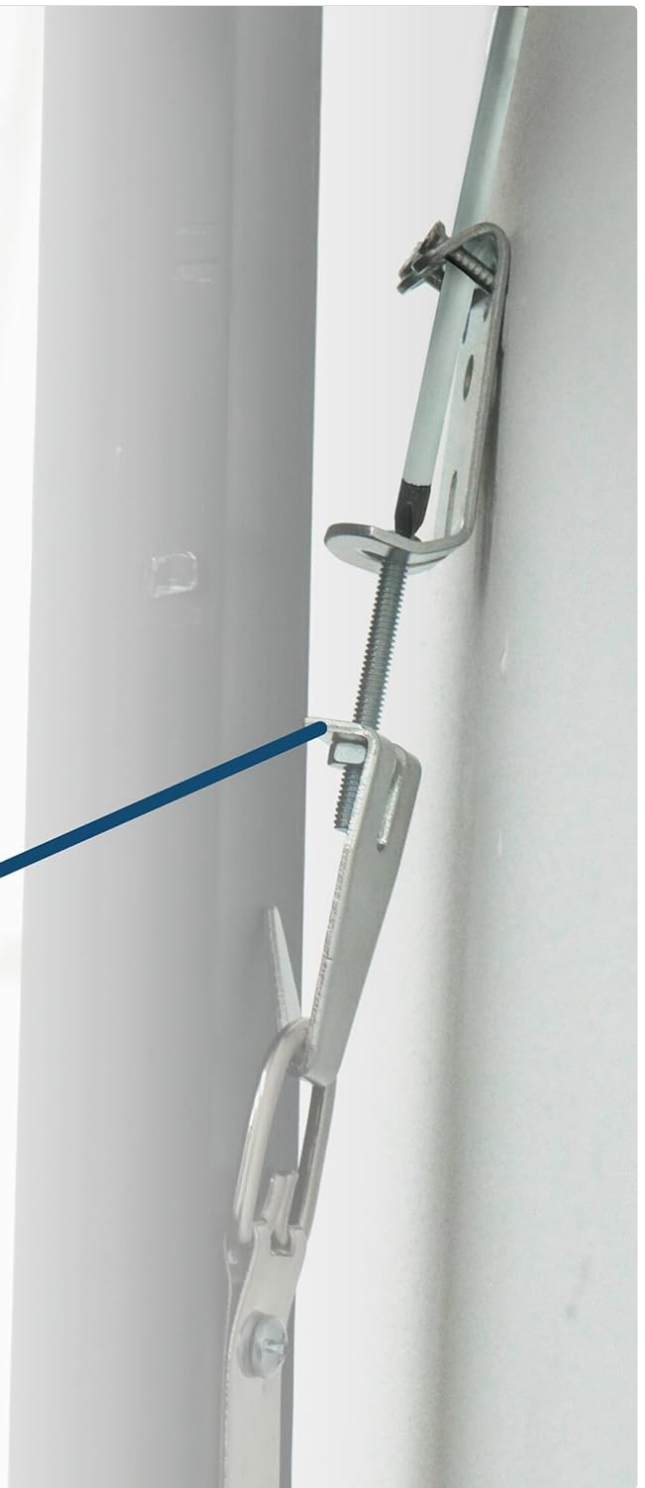
Figure 3: Installing adjustable J-Hooks on the wall.