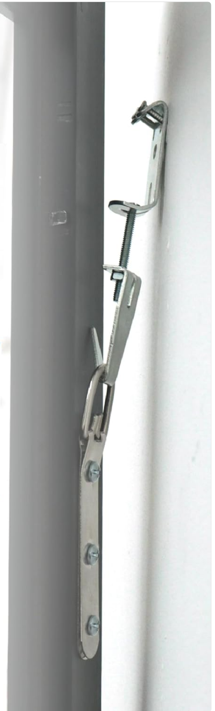
Figure 4: Mirror hung on J-Hooks with adjustment detail.