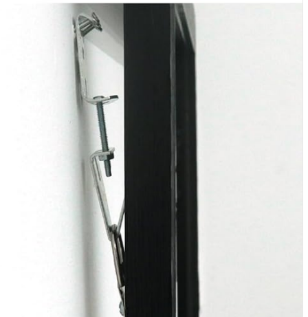
Figure 2: Attaching strap hangers to the mirror frame.

Hang the strap hangers on the J Hooks and adjust as needed.