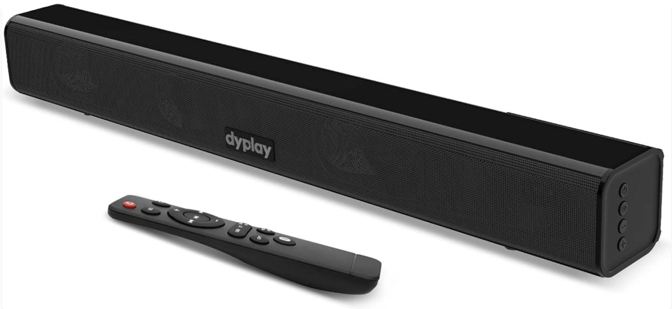
Image: The Dyplay 20-Inch Bluetooth Soundbar in black, accompanied by its remote control, showcasing its sleek design.

The Dyplay 20-Inch Bluetooth Soundbar (Model 1702C) is designed to upgrade your home theater audio with its 100-watt peak power output. It delivers clear treble, heavy bass, and a wide stereo effect, making it ideal for TVs, smartphones, PCs, and gaming setups. Its compact design allows for flexible placement, either on a desktop or wall-mounted.