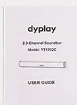
6 User Manual