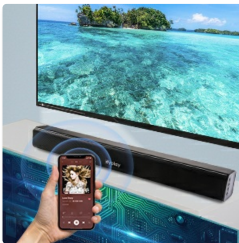
Image: A graphic illustrating a smartphone wirelessly connected to the soundbar via Bluetooth, with sound waves emanating from the soundbar.