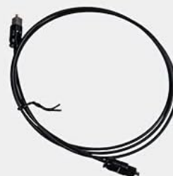
3 Digital Optical Cable