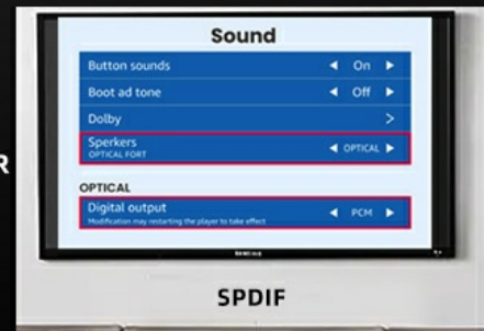
Image: A step-by-step diagram illustrating how to connect the soundbar via Bluetooth and how to configure TV settings for HDMI (ARC) or SPDIF connections, including setting audio output to PCM.