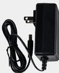
2 Power Adapter