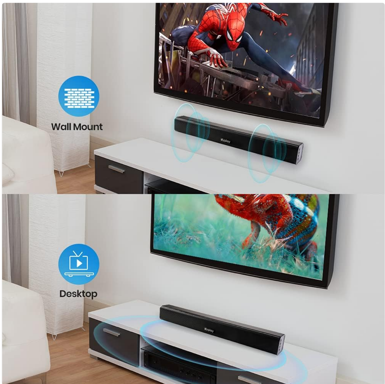
Image: Demonstrates the soundbar's versatility with illustrations for both wall-mounted and desktop setups.