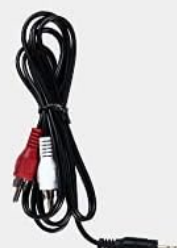
7 Stereo RCA to 3.5mm Audio Cable

Image: A visual representation of all items included in the soundbar package, such as the soundbar, remote, cables, and power adapter.