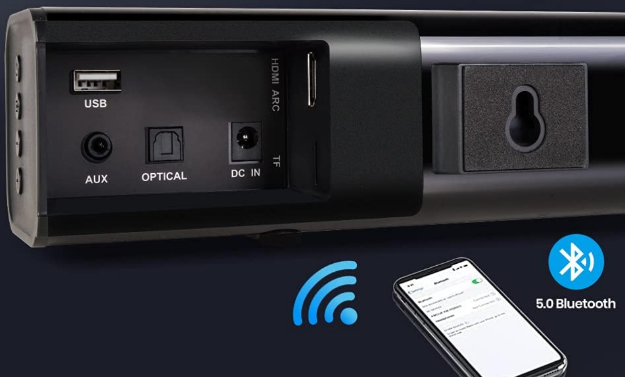
Image: A close-up view of the soundbar's rear panel, highlighting the various input ports including USB, AUX, Optical, TF card slot, and HDMI ARC.