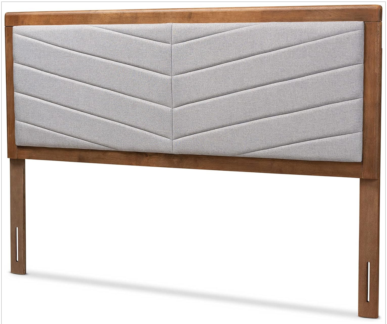
Image 1.1: Front view of the Baxton Studio IDEN King Size Headboard. This image displays the light grey fabric upholstery with chevron tufting and the walnut brown finished wood frame.