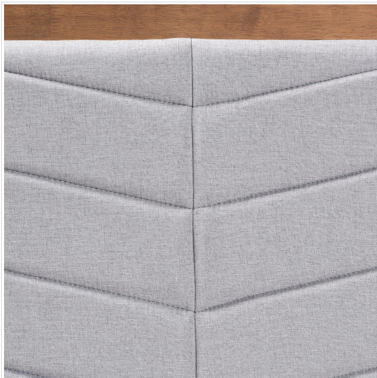
Image 4.1: Back view of the headboard, illustrating the attachment points for the legs. Ensure proper alignment before securing hardware.