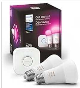
Image: Diagram illustrating the first step of getting started with Philips Hue lighting installation.

Ensure power is off at the circuit breaker before beginning installation. Follow standard electrical wiring procedures for flush-mount ceiling fixtures. Professional installation is recommended if you are unfamiliar with electrical work.