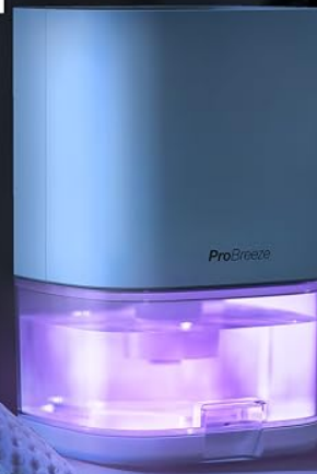
Image 3.2: Visual summary of the dehumidifier's features: ultra-silent, energy-saving, lightweight, portable, 1L water tank, 6 LED colors, 4-hour timer, and automatic shut-off.