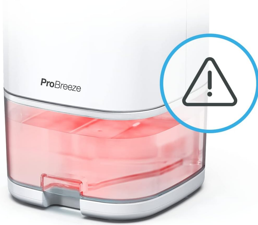
Image 5.3: The dehumidifier's water tank glowing red, signaling that it is full and requires emptying.

Le réservoir d'eau s'illumine automatiquement en rouge et s'éteint une fois plein. La lumière rouge vient s'ajouter aux 6 couleurs arc-en-ciel sélectionnables.