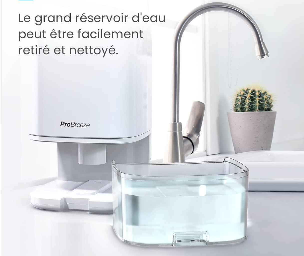
Image 6.1: The 1000ml water tank being removed from the dehumidifier for emptying or cleaning.

Le grand réservoir d'eau peut être facilement retiré et nettoyé.