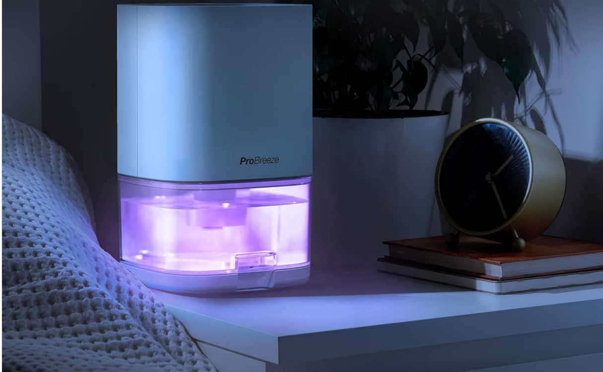
Image 5.1: The dehumidifier operating with its 4-hour timer function, ideal for use during sleep or when leaving the room.

Programmez le déshumidificateur pour qu'il s'éteigne automatiquement après 4 heures.