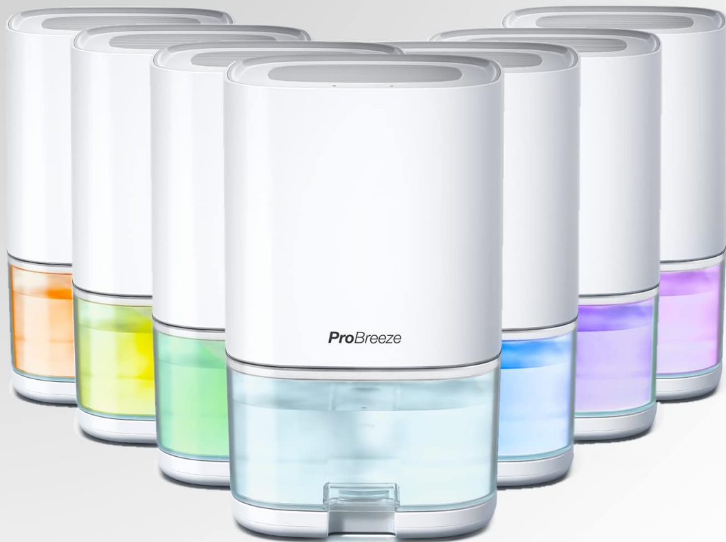
Image 5.2: Multiple Pro Breeze dehumidifiers displaying the range of 6 selectable LED light colors.