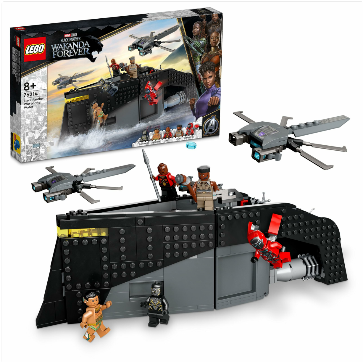
Image 1.1: The LEGO Marvel Black Panther: War on the Water 76214 set box, showcasing the assembled ship and minifigures.

The set includes 545 pieces, allowing for the construction of the impressive War on the Water ship, complete with various features and play elements. Five LEGO Marvel minifigures are included: Black Panther, M'Baku, Okoye, Ironheart MK1, and King Namor.