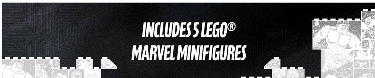
Image 1.2: The five minifigures included in the set: Black Panther, M'Baku, Okoye, Ironheart MK1, and King Namor.