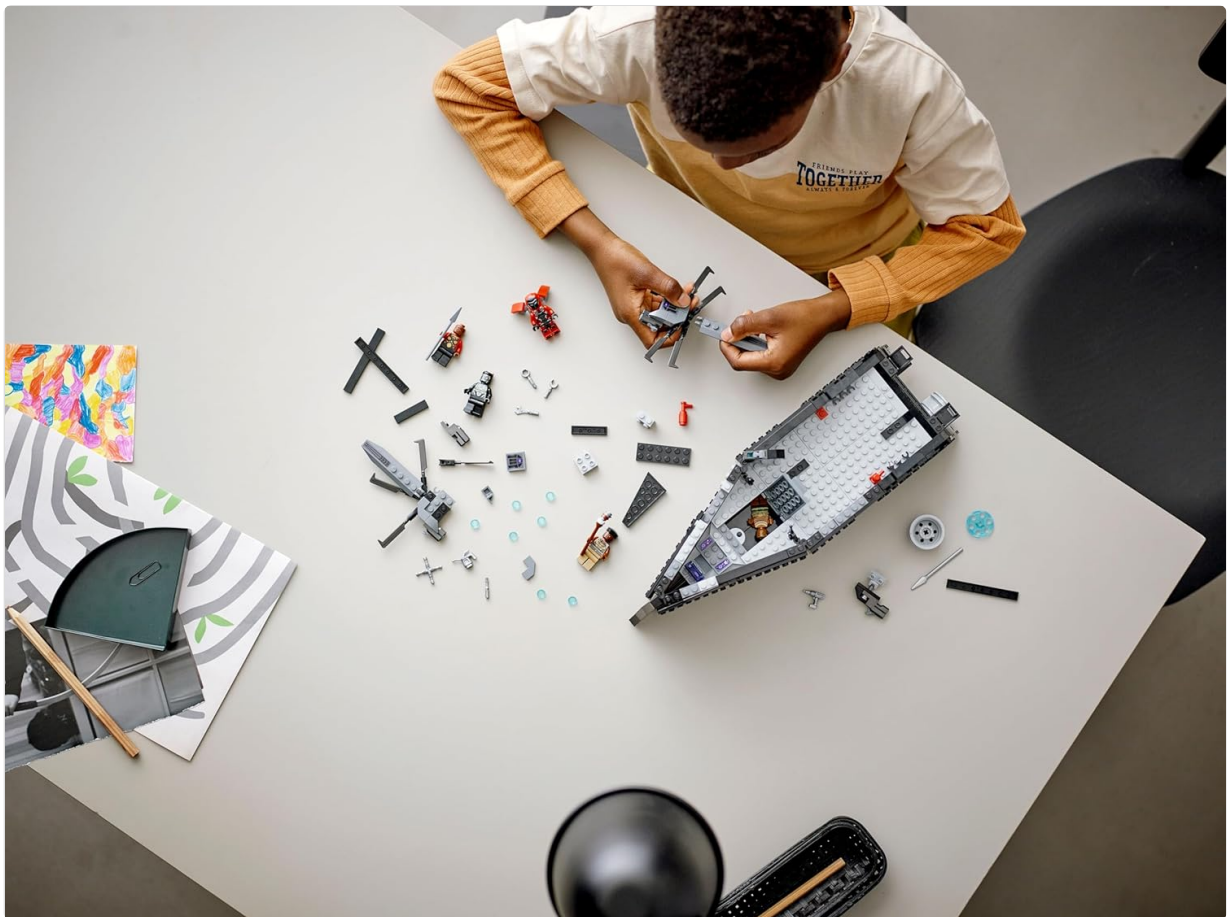
Image 2.2: An overhead view showing various LEGO elements and a partially constructed section of the War on the Water ship, illustrating the building process.