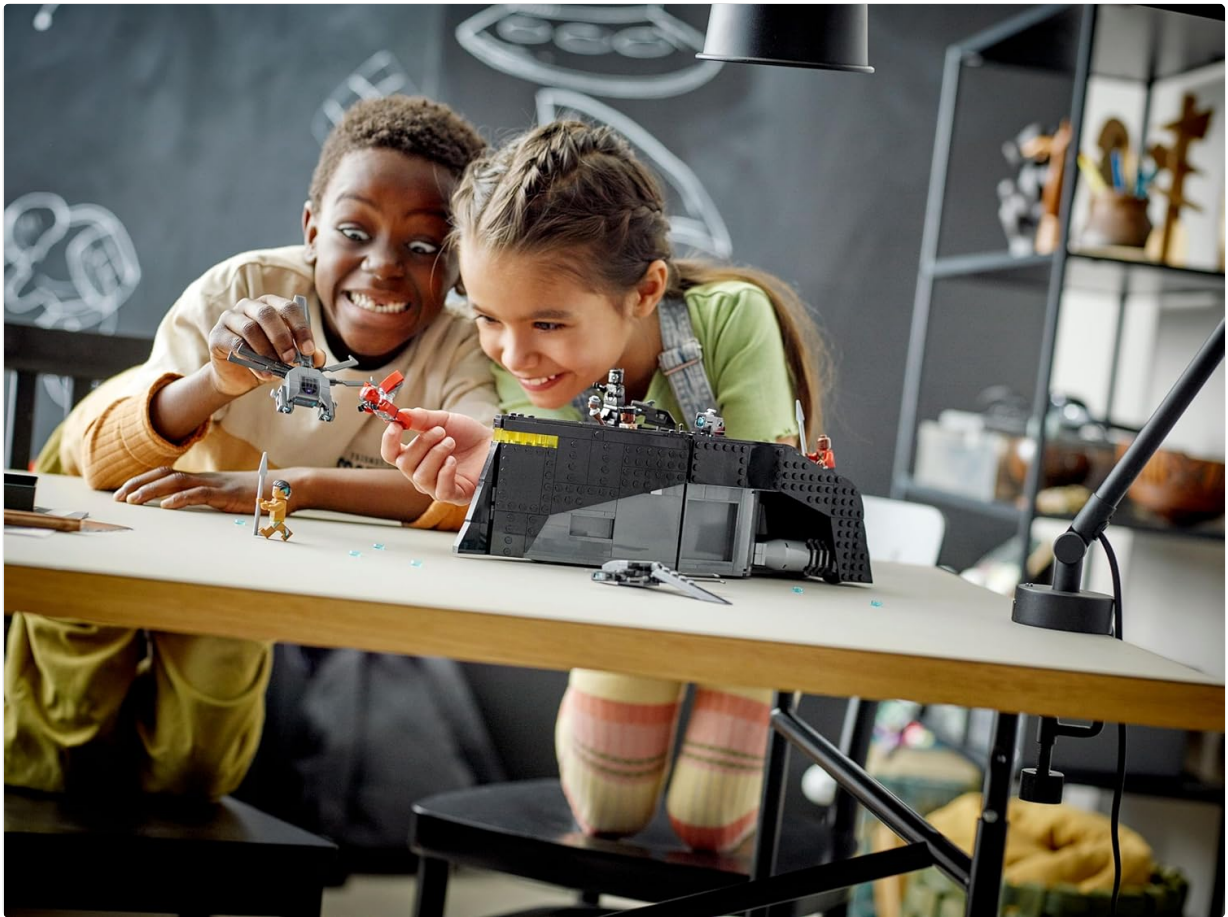
Image 3.1: Two children engaging in imaginative play with the fully assembled LEGO War on the Water set, demonstrating its interactive nature.