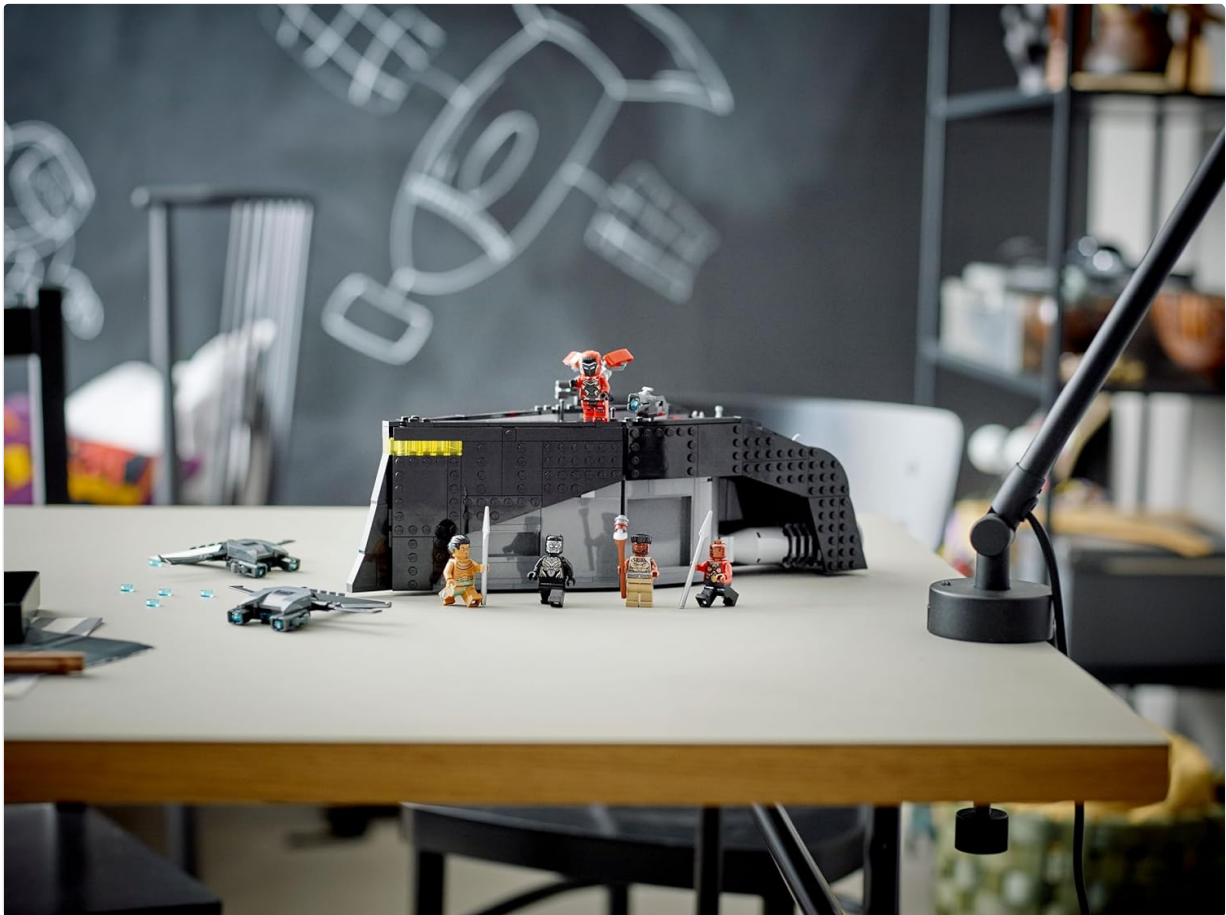
Image 3.3: The fully assembled LEGO War on the Water ship, positioned with several minifigures on and around it, ready for play.