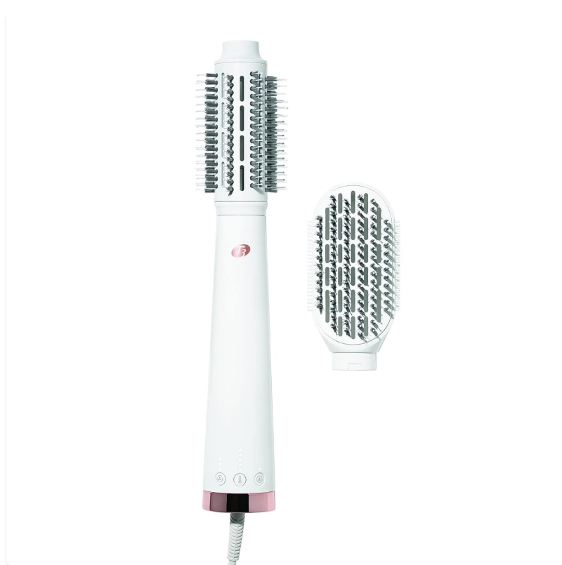
Image: The T3 AireBrush Duo handle with both the round brush and paddle brush attachments displayed.

The T3 AireBrush Duo is an innovative hot air blow dry brush designed to provide versatile styling options, from sleek and smooth to voluminous and bouncy. Featuring an interchangeable brush design, advanced T3 IonFlow Technology, and 15 heat and speed combinations, this tool delivers shiny, frizz-free results tailored to your hair type and desired style.