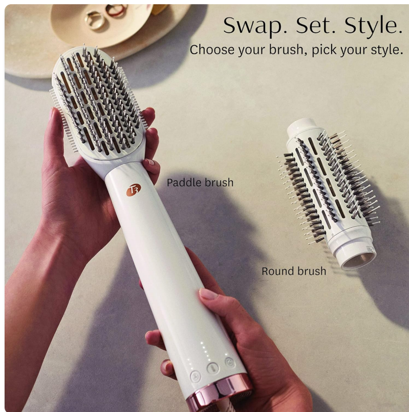
Image: The T3 AireBrush Duo handle with both the round brush and paddle brush attachments displayed separately, illustrating the interchangeable design.

Upon opening the package, ensure all components are present: the T3 AireBrush Duo handle, the 2.5" round brush attachment, and the 3" paddle brush attachment. Inspect the device and attachments for any visible damage.