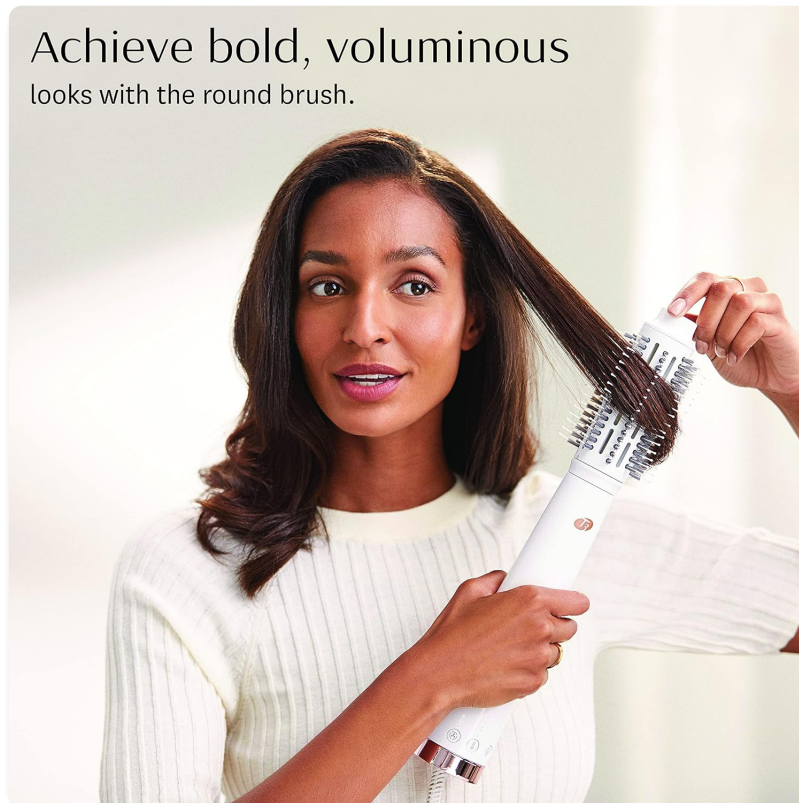
Image: Close-up of the T3 AireBrush Duo's round brush attachment, showing its design for creating volume and soft waves.