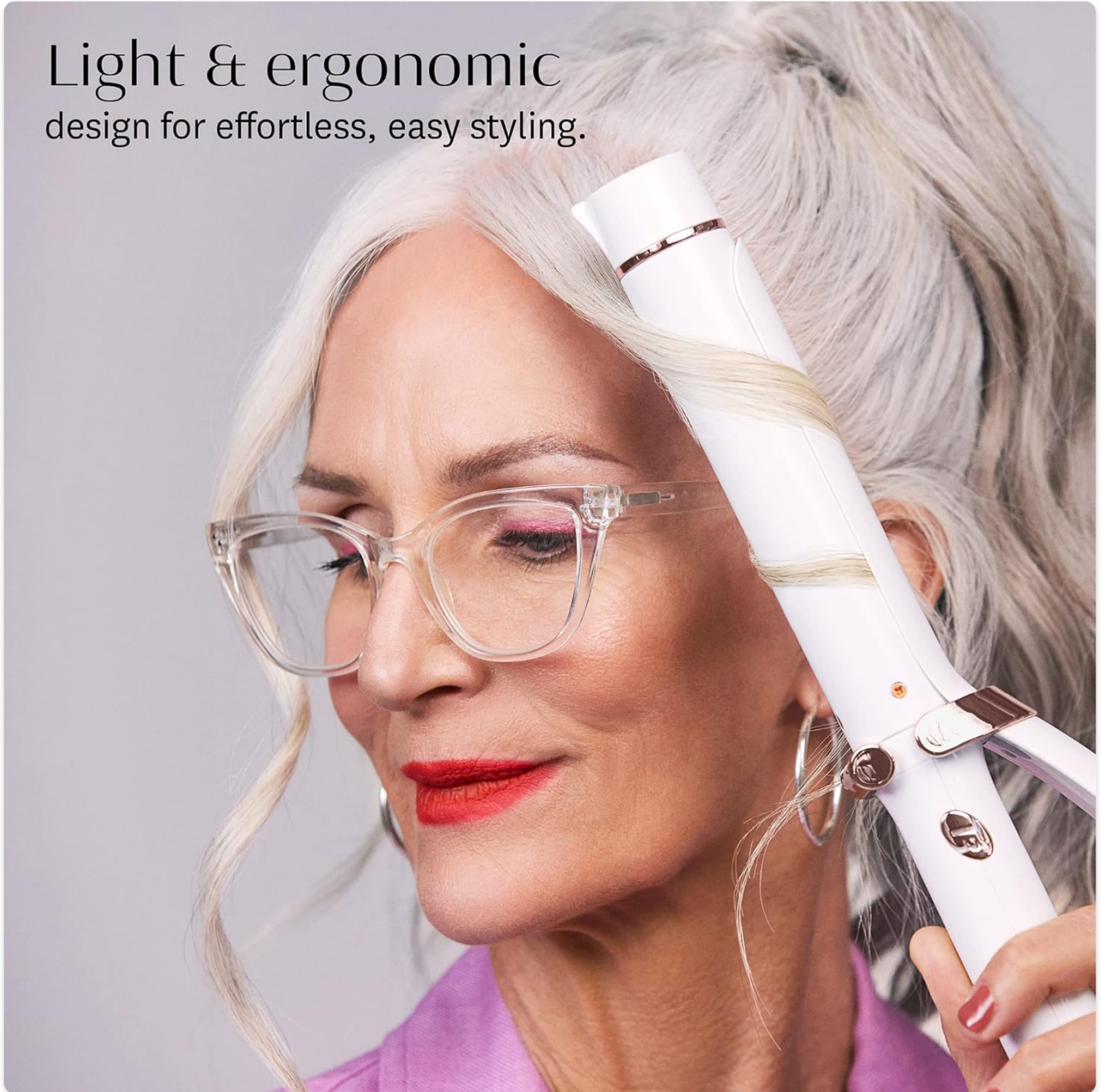
Image: A woman using the T3 curling iron to create a curl, showing the hair wrapped around the barrel.

Light & ergonomic design for effortless, easy styling.