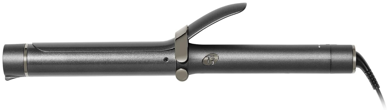
Image: The T3 SinglePass Curl Professional Curling Iron, 1 1/4 inch barrel, in Graphite color.