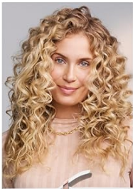
T3 SINGLEPASS CURL 3/4" 3/4" Professional Curling Iron Creates delicate, defined curls or enhances natural texture.