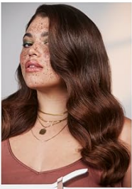
T3 SINGLEPASS CURL 1 1/2" 1 1/2" Professional Curling Iron Creates big, voluminous curls and waves.