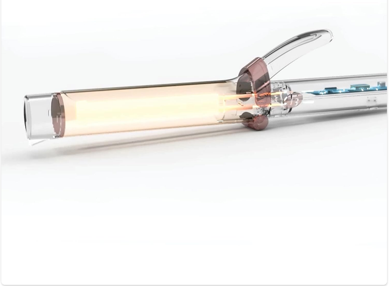
Image: A close-up view of the T3 curling iron's SmartTwist Dial with five precise heat settings, indicating options for fine, medium, and coarse hair textures.

for minimized heat exposure, but perfect, lasting curls.