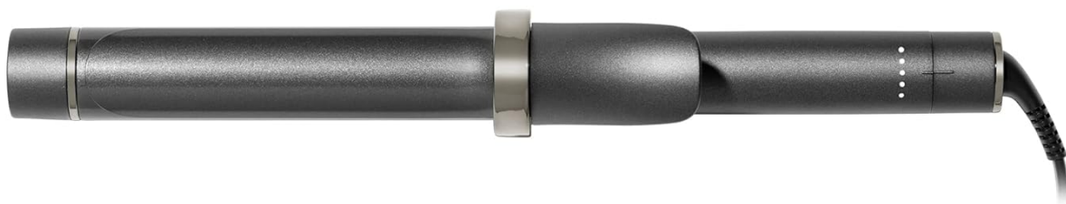
Image: The T3 curling iron with its power cord, ready for connection.