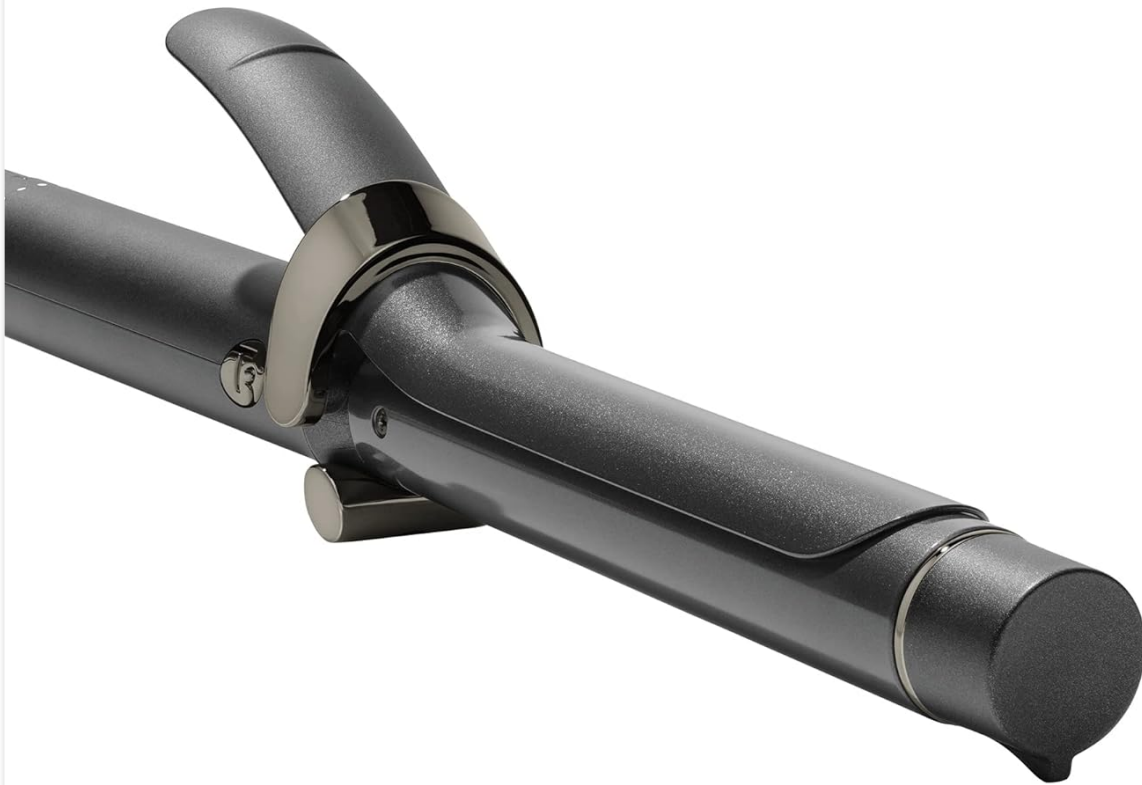
Image: The T3 curling iron resting on its integrated stand, ensuring safe placement during use.