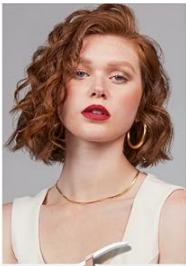
T3 SINGLEPASS CURL 1" 1" Professional Curling Iron Creates classic, polished curls and waves.