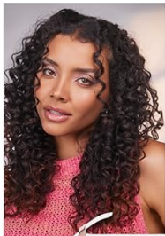
T3 SINGLEPASS CURL 1/2" 3/8" Professional Curling Iron Creates tight, bouncy curls or enhances natural texture.