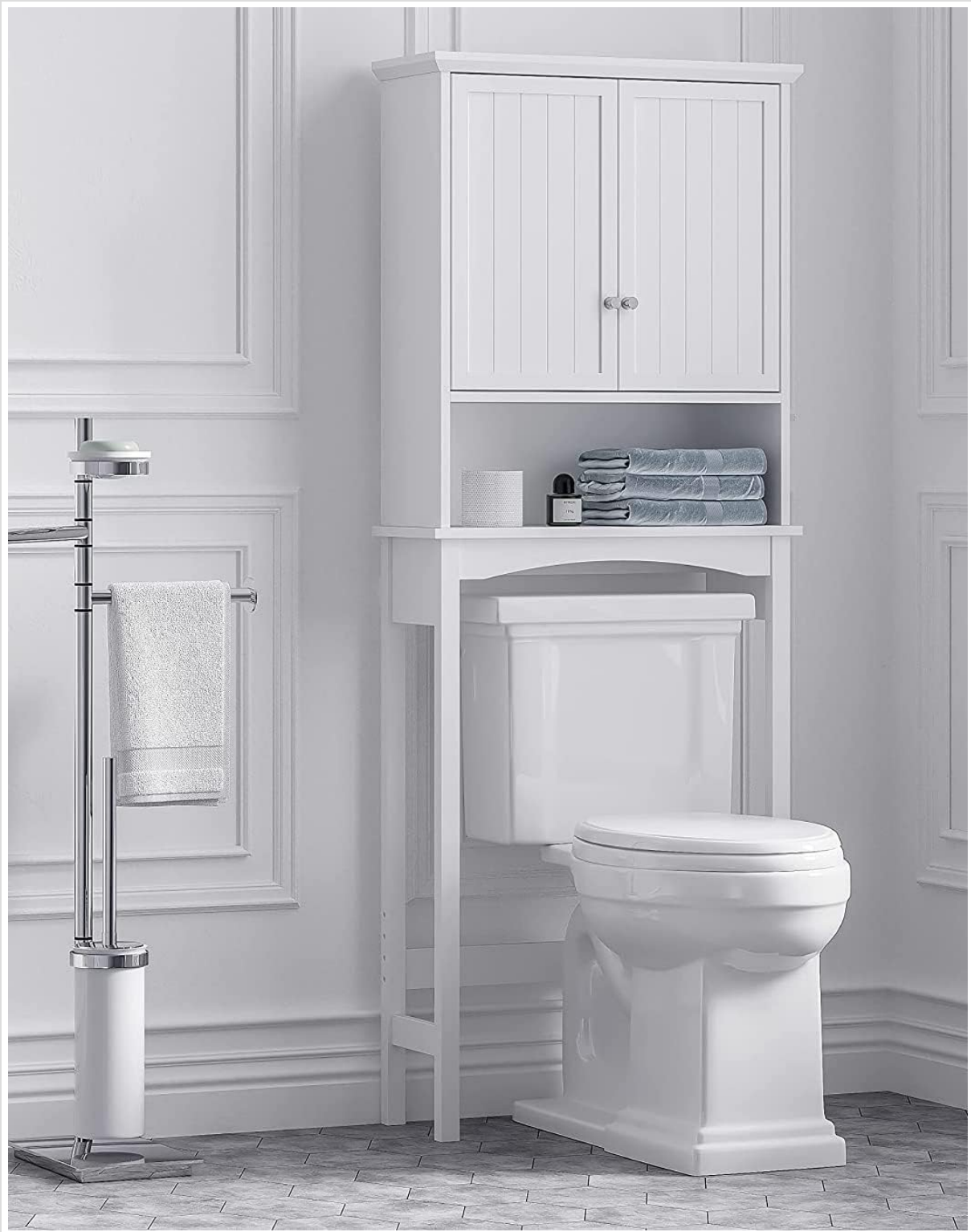
Image 1.1: UTEX Over-The-Toilet Storage Cabinet in a typical bathroom environment.