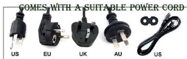
Image: A visual representation of different regional AC power cords (US, EU, UK, AU) that may be supplied with the adapter, alongside a document labeled 'Limited Warranty Certificate'.