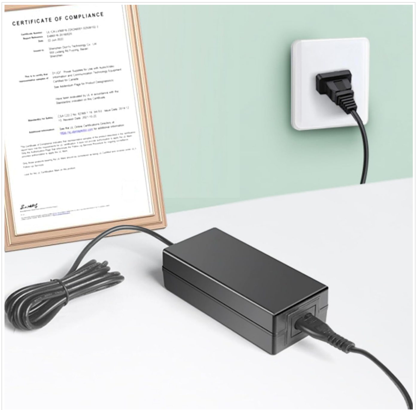
Image: The UpBright AC/DC Adapter connected to its AC power cord, which is then plugged into a standard wall electrical outlet. A framed certificate is visible in the background.