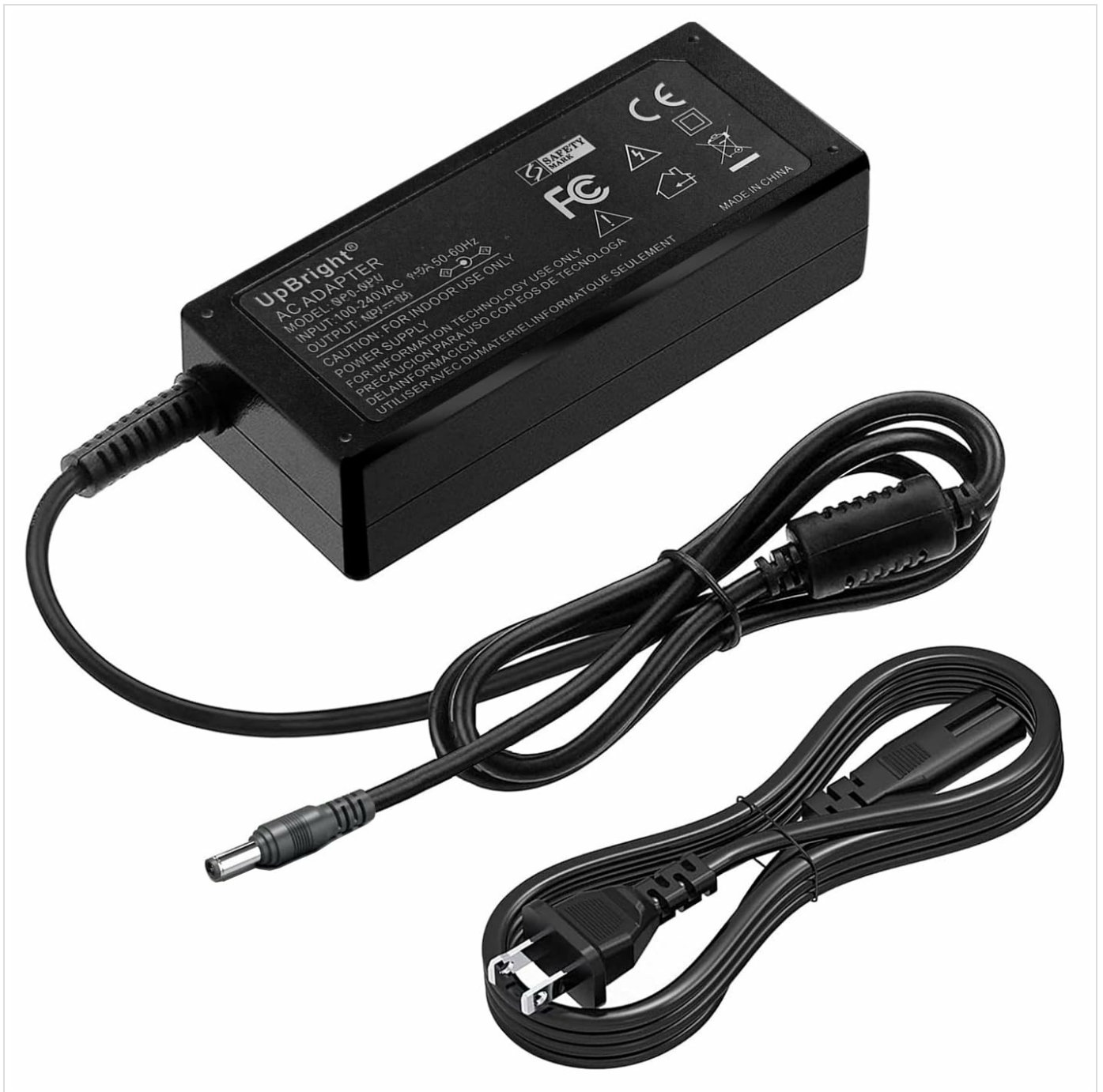
Image: The UpBright 19V AC/DC Adapter, showing the main unit, attached DC output cable with a barrel connector, and the detachable AC input cable.