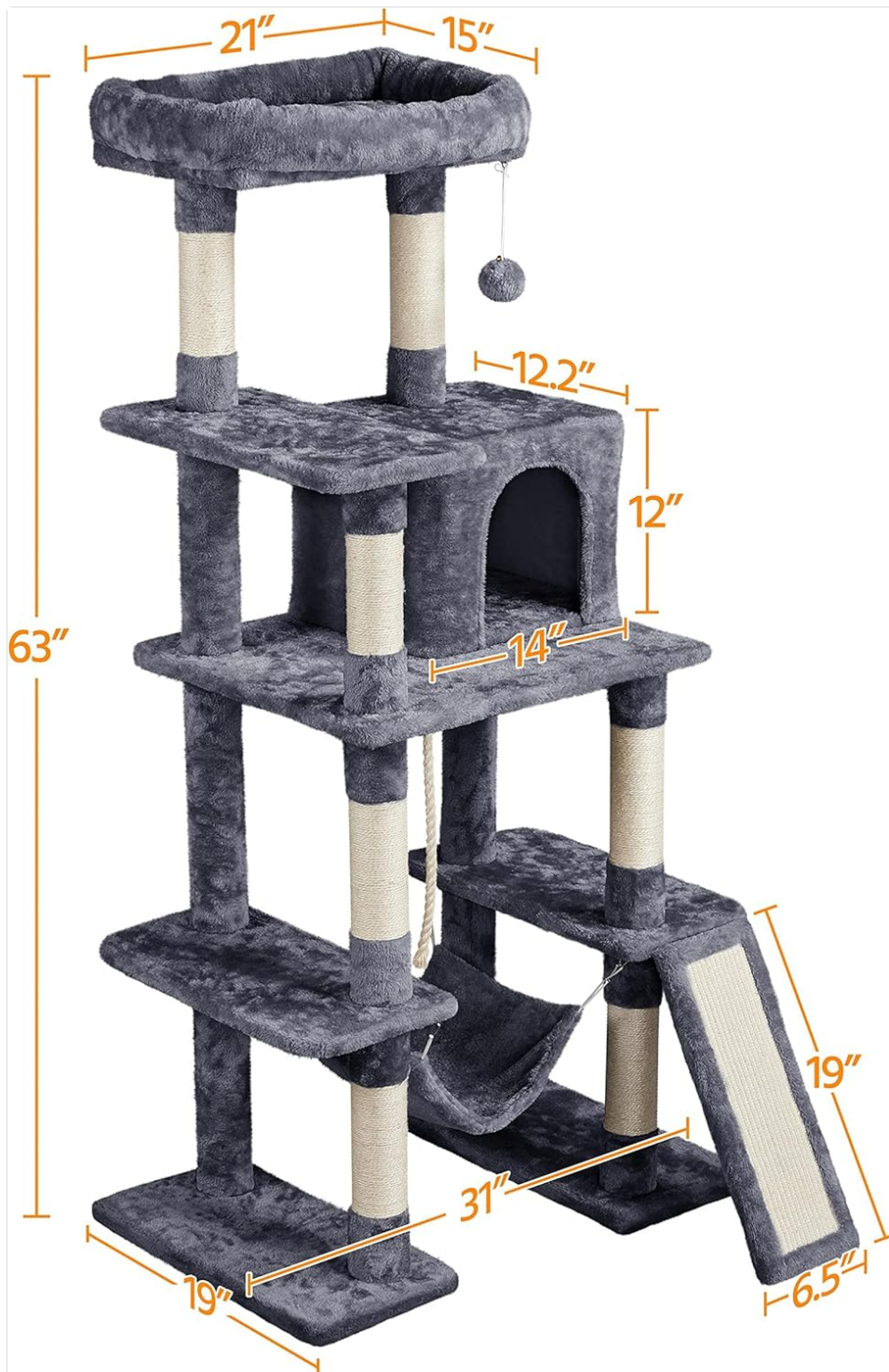
Visual representation of the cat tree's key dimensions.