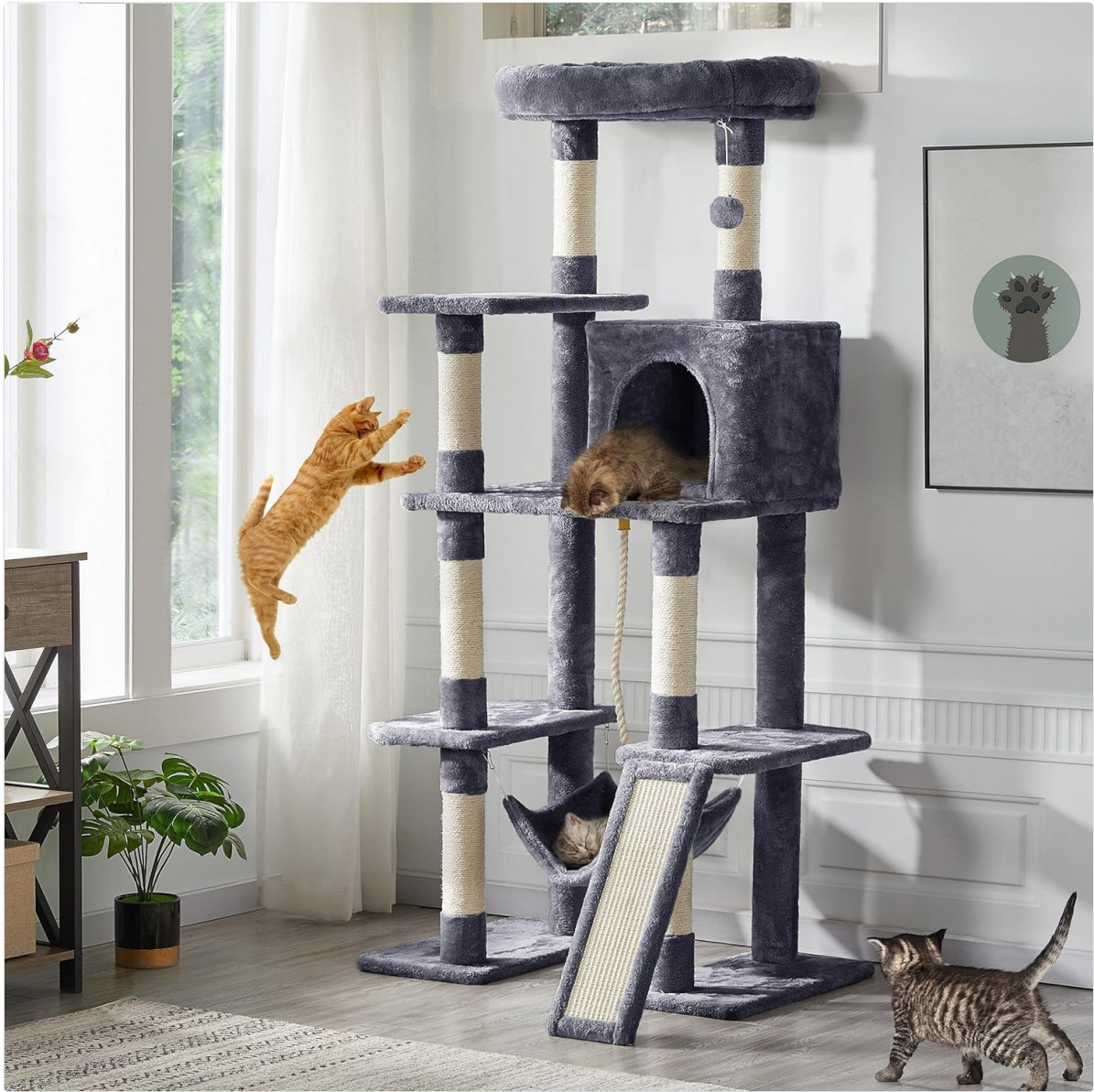
Diagram highlighting the enlarged hammock and the plate-type ladder, which also serves as a scratching surface.