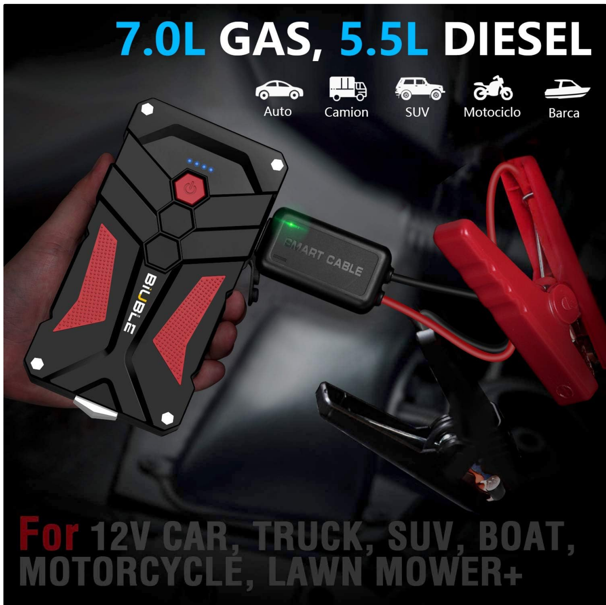
Image 1.1: The BIUBLE JS001S Portable Car Jump Starter, illustrating its compatibility with various vehicle types and engine sizes.