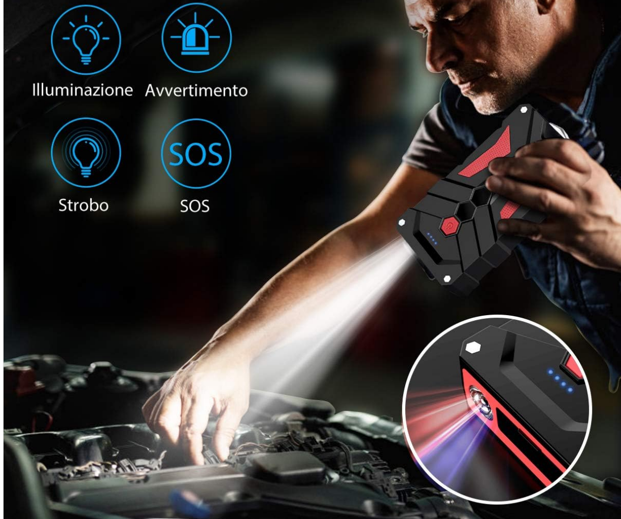
Image 6.4: The BIUBLE JS001S LED flashlight showcasing its four functional modes: illumination, warning, strobe, and SOS.