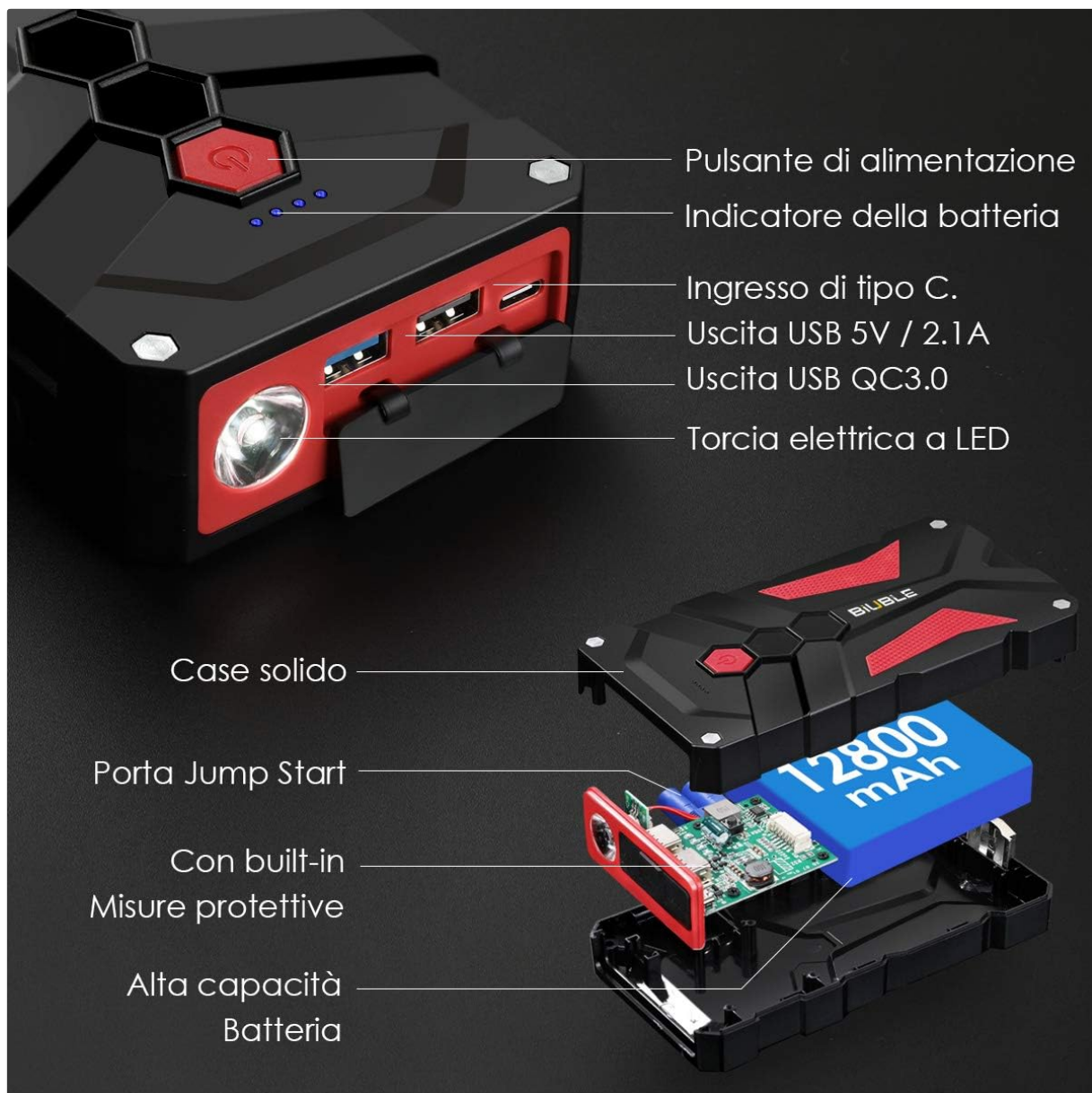
Image 4.1: Detailed diagram of the BIUBLE JS001S, highlighting its components including the power button, battery indicator, USB output ports, Type-C input, LED flashlight, and jump start port.