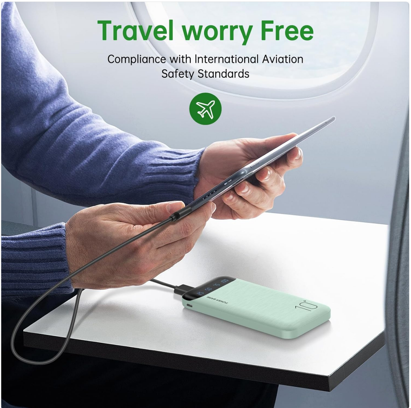
Image: A person using the YOBON power bank to charge a tablet on an airplane, highlighting its travel-friendly design and compliance with international aviation safety standards.