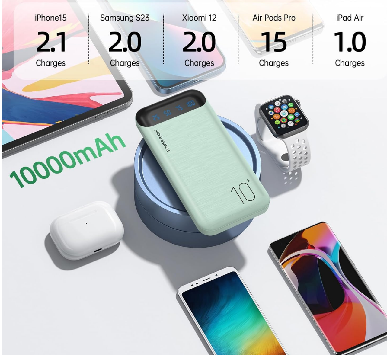
Image: A visual representation of the 10000mAh capacity, showing approximate charge times for various devices like iPhone 15 (2.1 charges), Samsung S23 (2.0 charges), Xiaomi 12 (2.0 charges), AirPods Pro (15 charges), and iPad Air (1.0 charge).