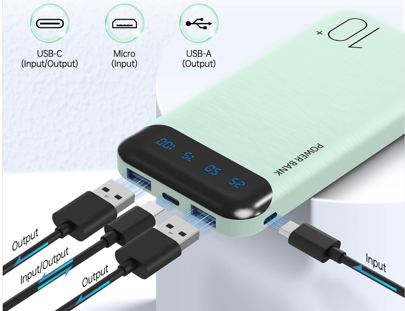
Image: A diagram illustrating the various input and output ports on the YOBON power bank, including USB-C (Input/Output), Micro

Perfect fit for iPhone 15 series and Andorid devices