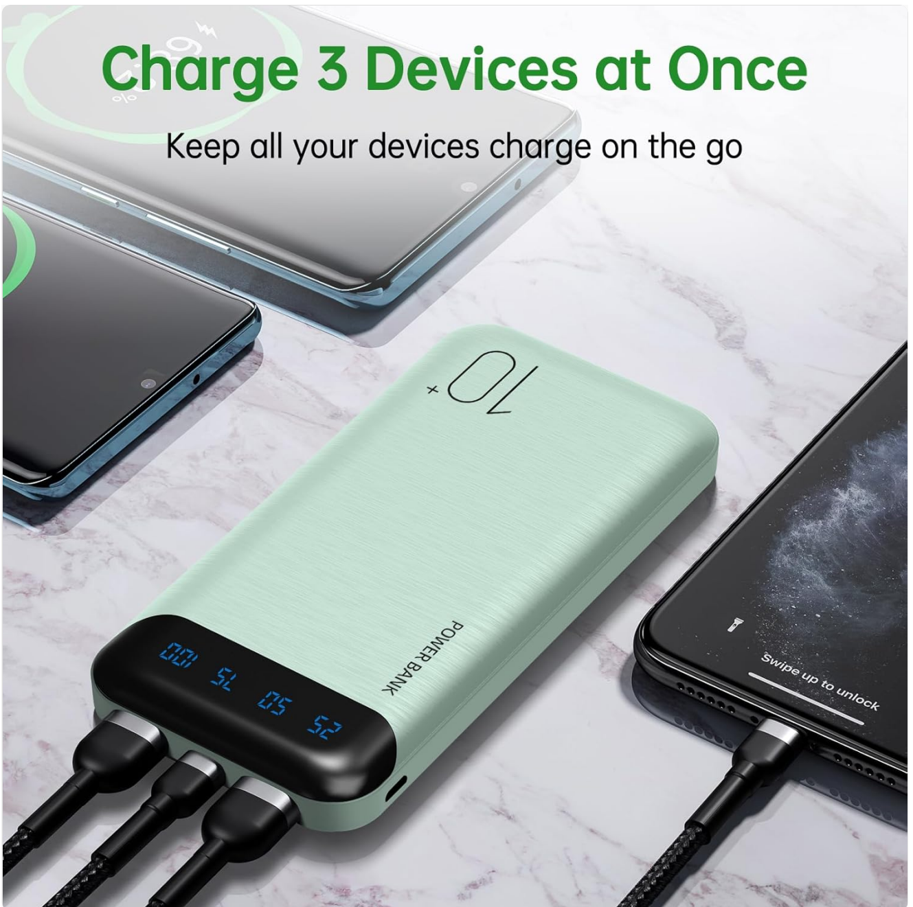
Image: The YOBON power bank actively charging three different mobile devices simultaneously, demonstrating its multi-output capability.