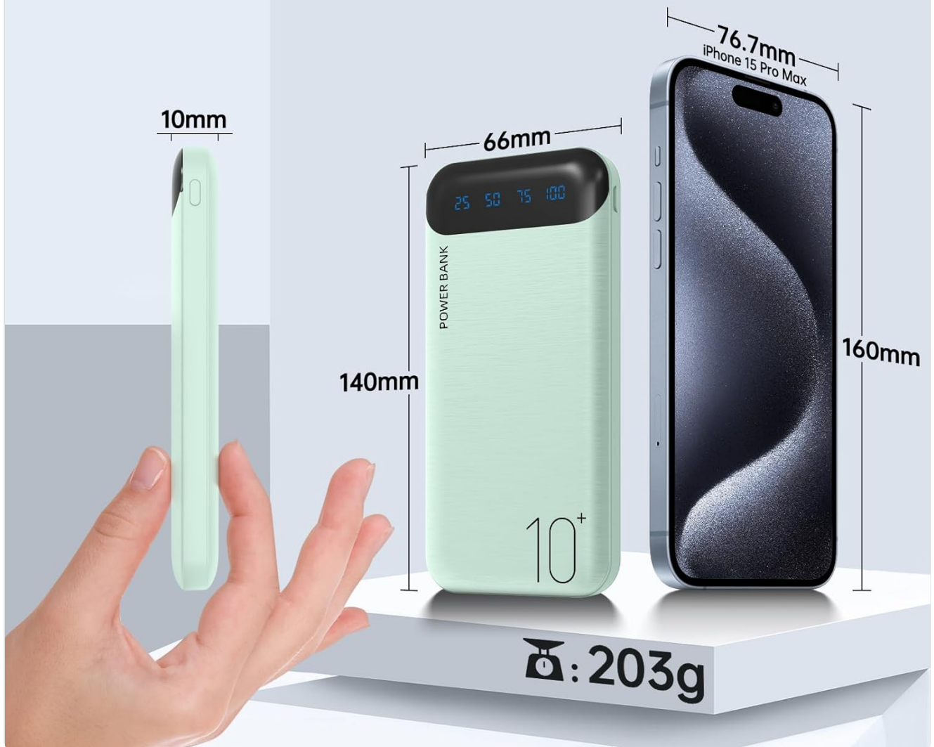
Image: A visual representation of the YOBN power bank's ultra-slim profile and lightweight design, showing its dimensions (140mm length, 66mm width, 10mm thickness) and weight (203g) in comparison to a smartphone.