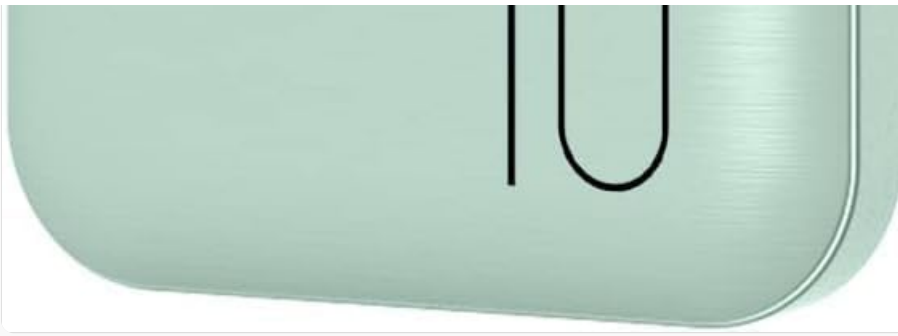
Image: Front view of the YOBON 10000mAh Portable Power Bank in green, showing the digital display for battery percentage and the "POWER BANK" and "10+" branding.