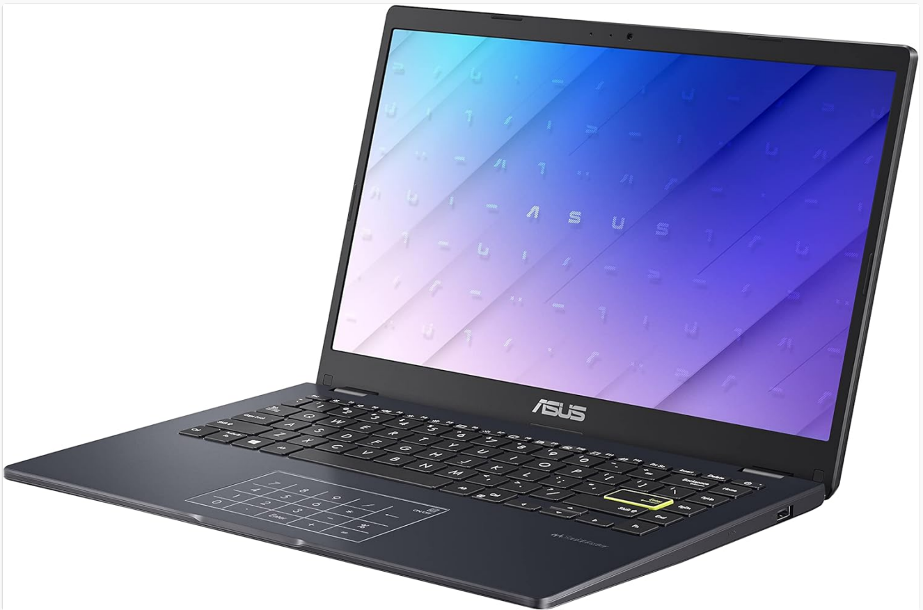
Figure 1: ASUS L410MA-DB04 Laptop, showing its overall design and ports.