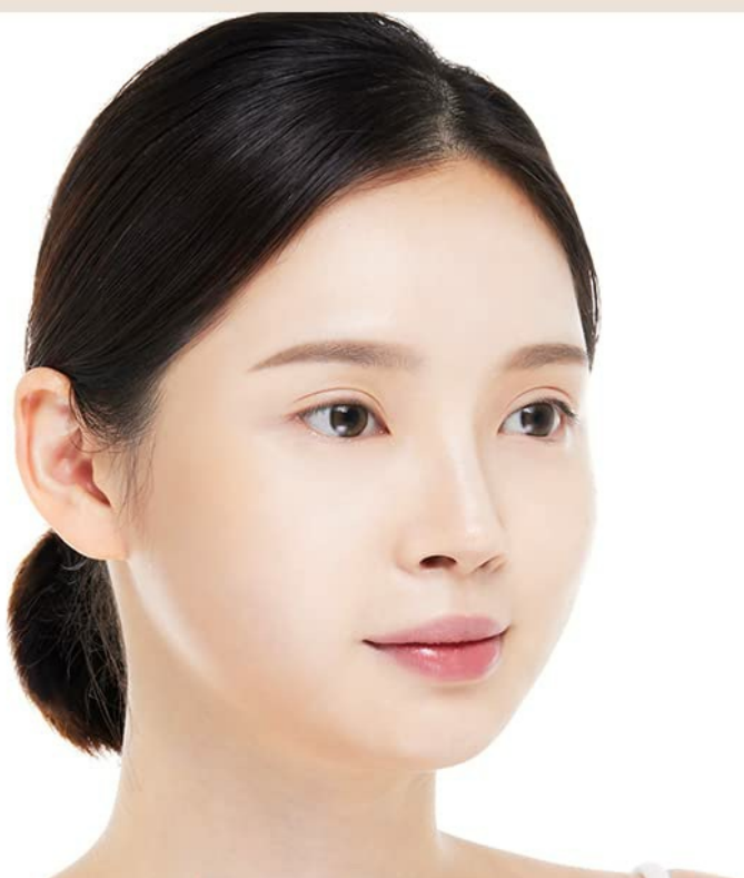
Image: A visual representation of the powdery fixing effect, showing a smooth, non-caky finish on skin.

A powdery stick formula that helps easy application but powdery finish! It makes long lasting natural contouring make-up.