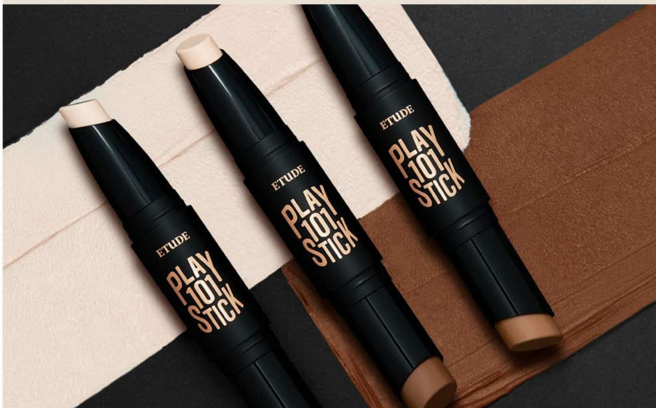
Image: An illustration highlighting the increased product capacity of the ETUDE Play 101 Stick Contour Duo, indicating more than double the shade color compared to previous versions.

*Before AD) Play 101 Stick Contour Duo (1.7g)