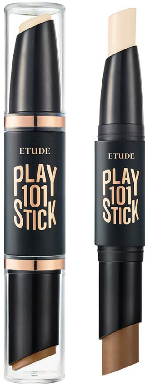
Image: The ETUDE Play 101 Stick Contour Duo, showcasing both the assembled product and its individual components. This stick combines a creamy highlighter and a shading stick for comprehensive facial contouring.