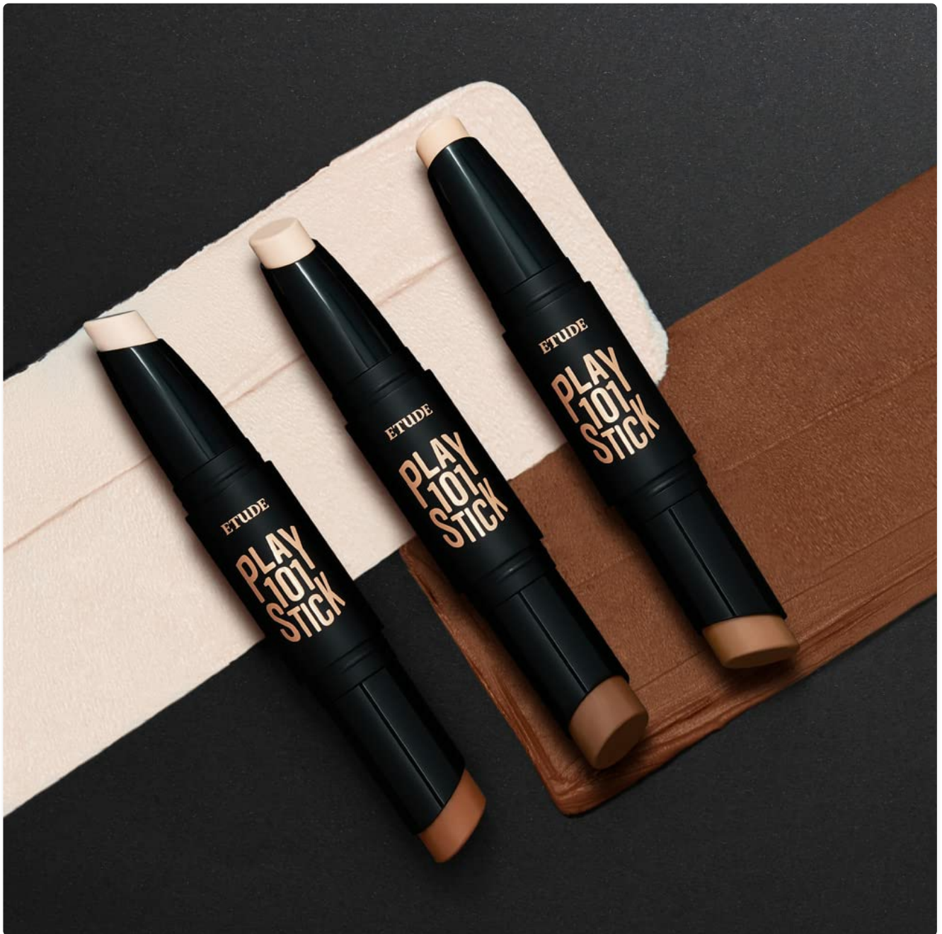
Image: A display of three ETUDE Play 101 Stick Contour Duos, highlighting the sleek design and compact nature of the product.