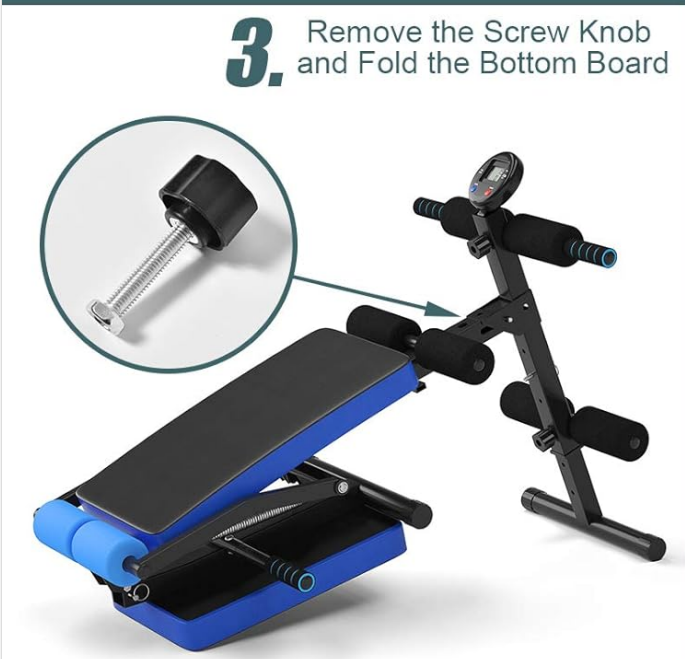
3. Remove the Screw Knob and Fold the Bottom Board