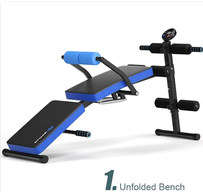
1. Unfolded Bench