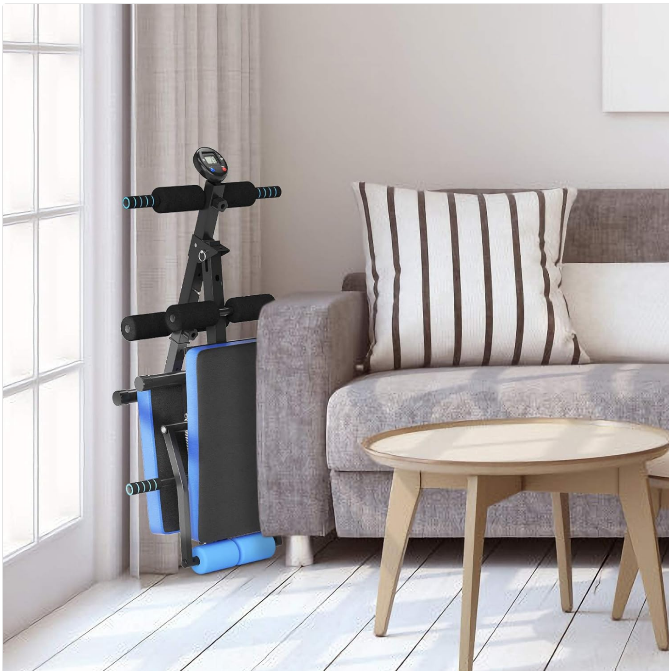
Image: The COSTWAY Sit Up Bench in its folded, upright storage position, showcasing its compact footprint.