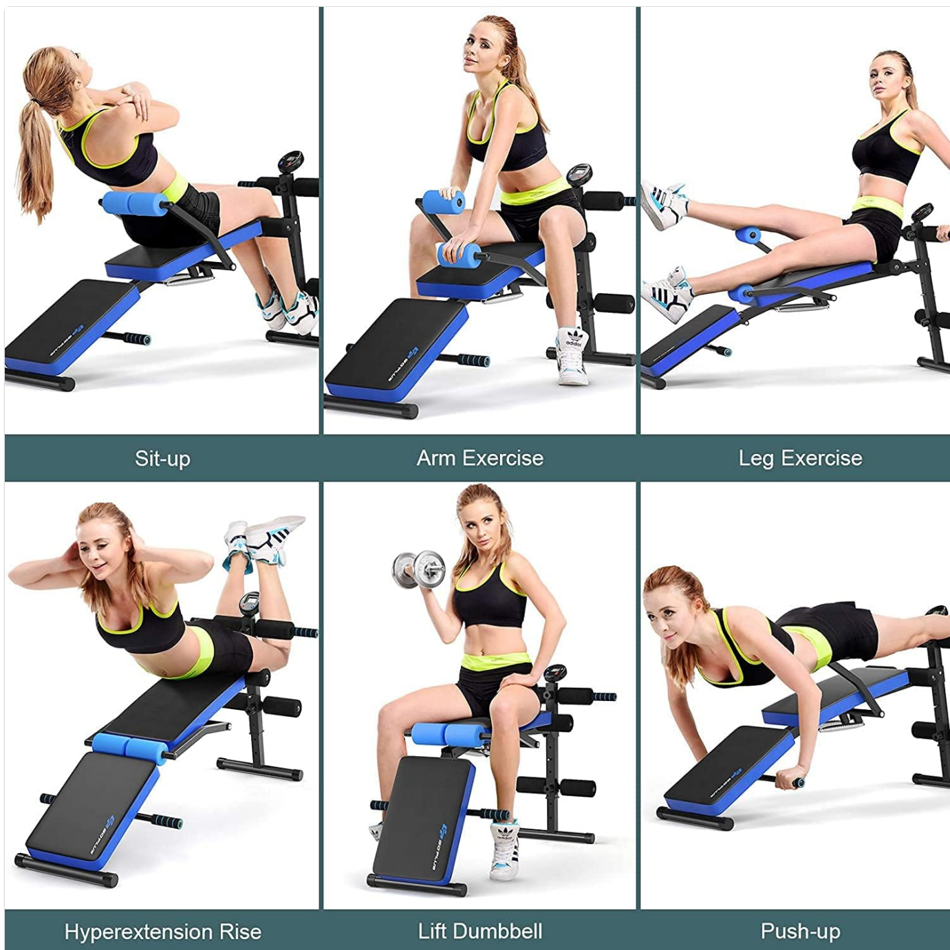
Image: Examples of exercises that can be performed using the COSTWAY Sit Up Bench.