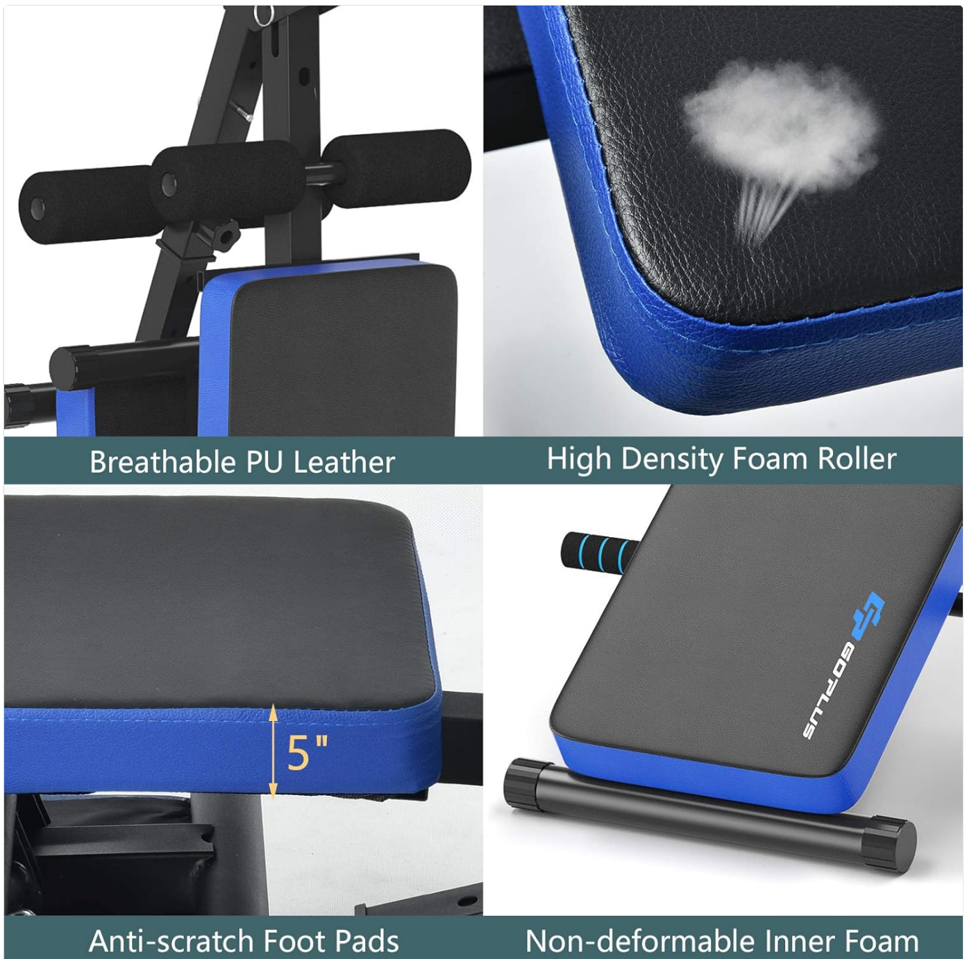
Image: Close-up details of the materials and construction, including breathable PU leather, high-density foam, anti-scratch foot pads, and non-deformable inner foam.