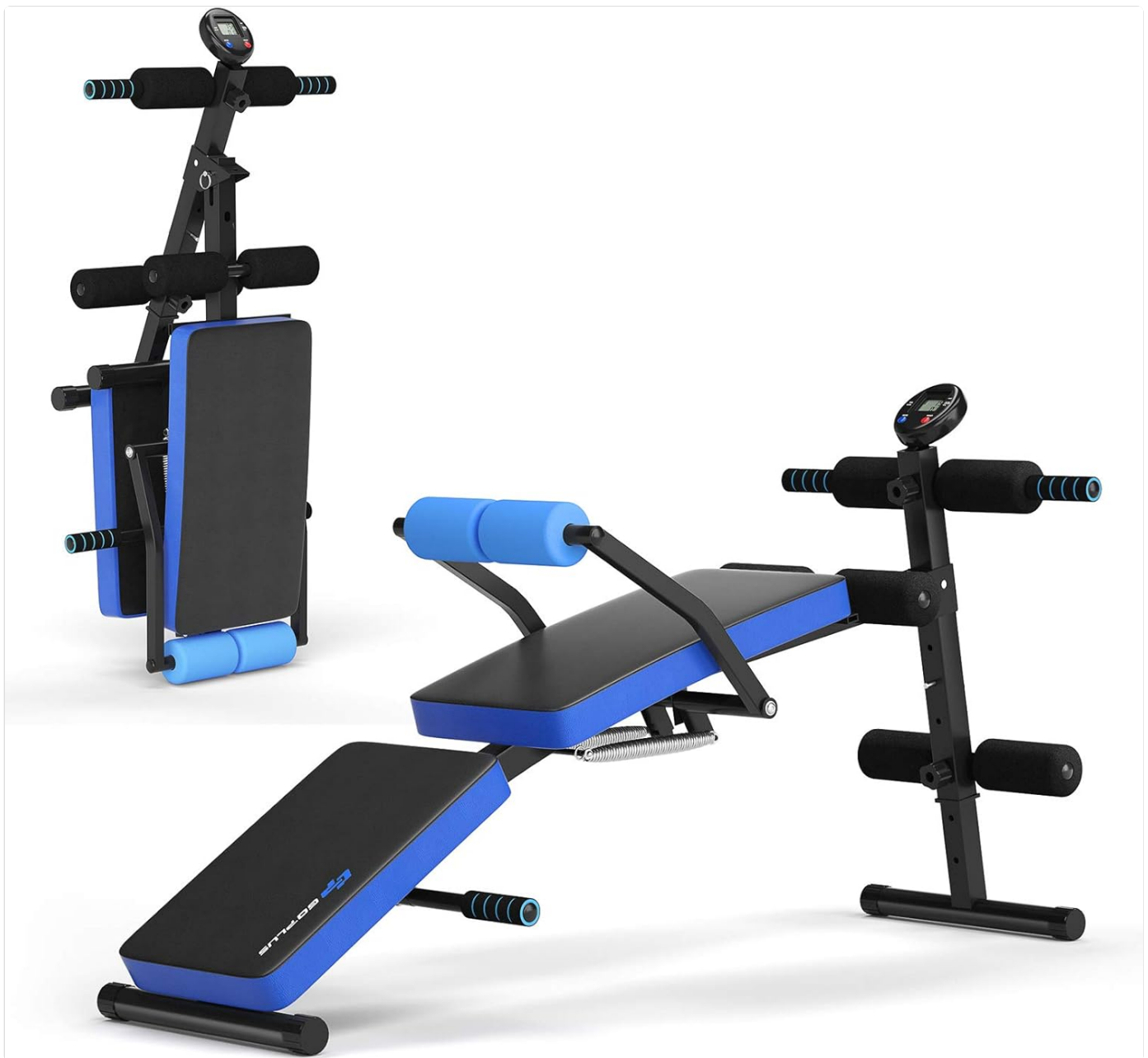
Image: The COSTWAY Sit Up Bench, illustrating its versatile design and foldable nature.

The COSTWAY Sit Up Bench is designed to provide a comprehensive abdominal and full-body workout. Its adjustable positions and integrated LCD monitor allow for customized and tracked exercise routines, making it suitable for various fitness levels. The foldable design ensures convenient storage, ideal for home or office environments.