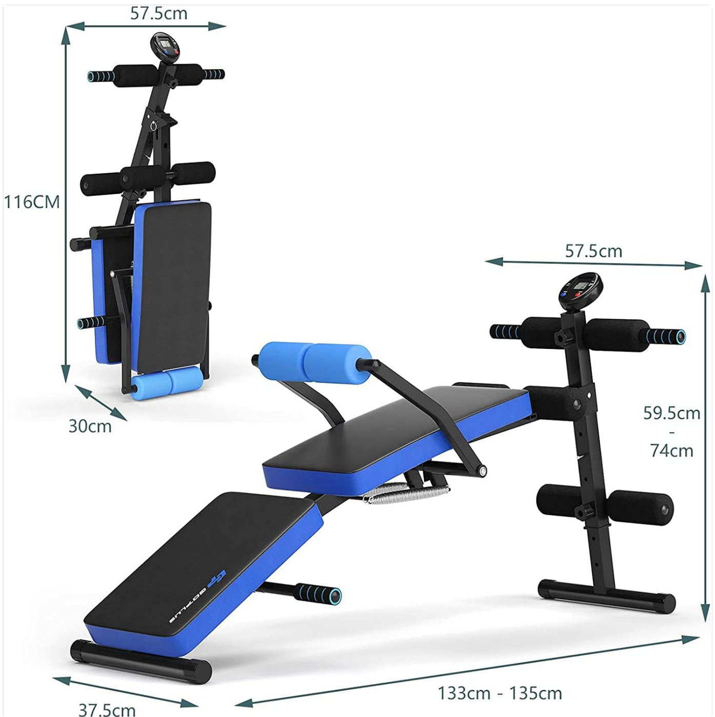
Image: Detailed dimensions of the bench in both operational and folded configurations.