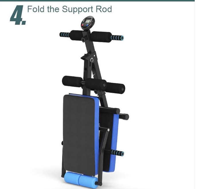
4. Fold the Support Rod

Image: Folding steps for the COSTWAY Sit Up Bench, illustrating how to prepare it for storage.