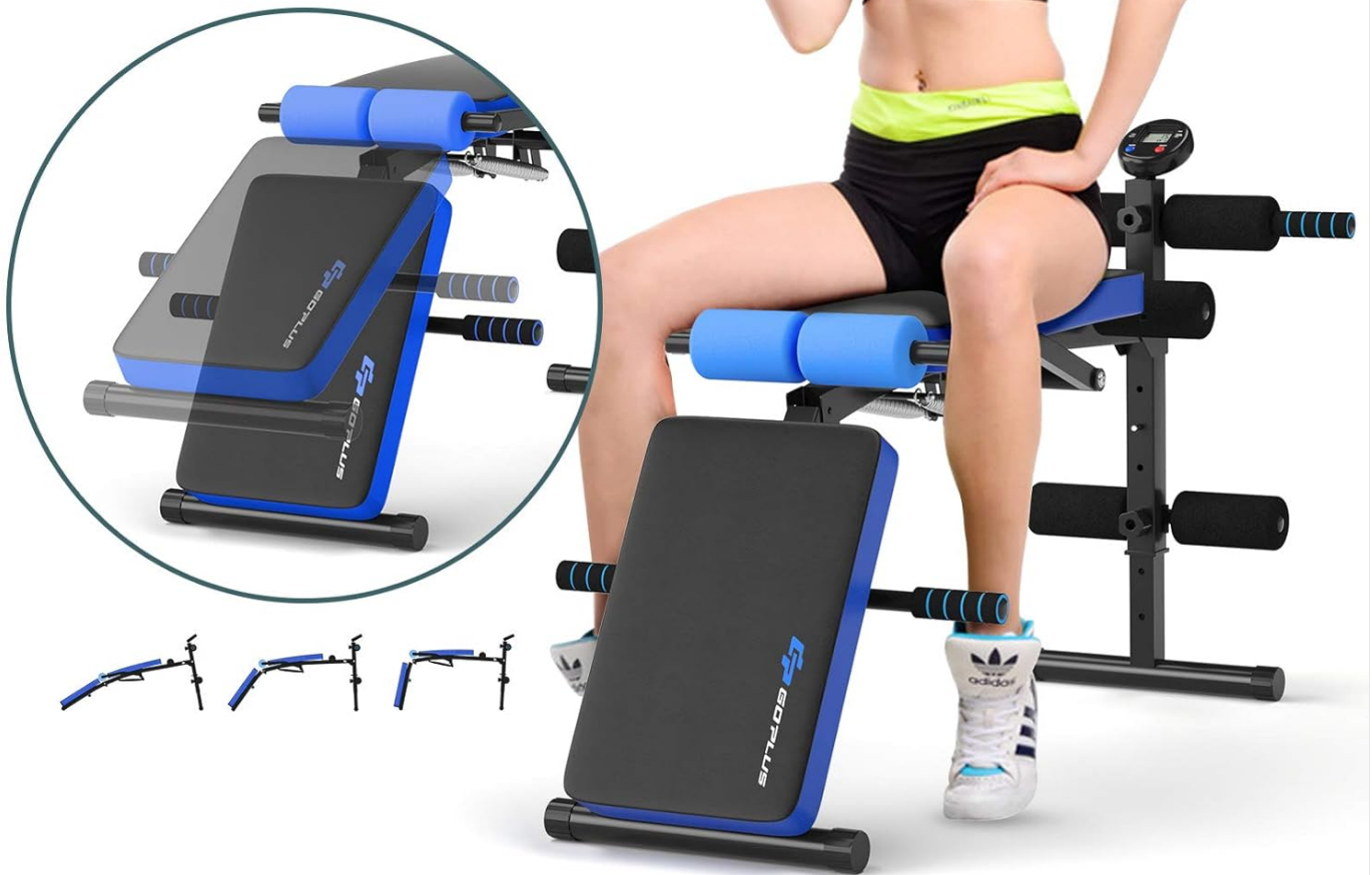
Image: The bench converted for dumbbell exercises, demonstrating its versatility.