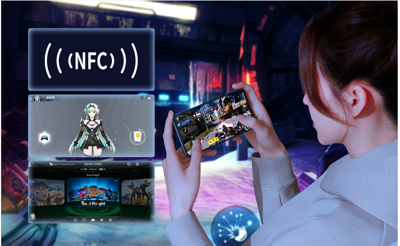
Image: Black Shark 4 demonstrating NFC functionality alongside gaming.