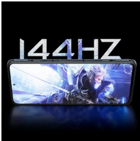
Image: Black Shark 4 display highlighting 144Hz refresh rate.

You can customize the screen refresh rate to 60Hz, 90Hz, or 144Hz based on your preference and usage scenario. This setting can typically be found in the display settings of the phone.