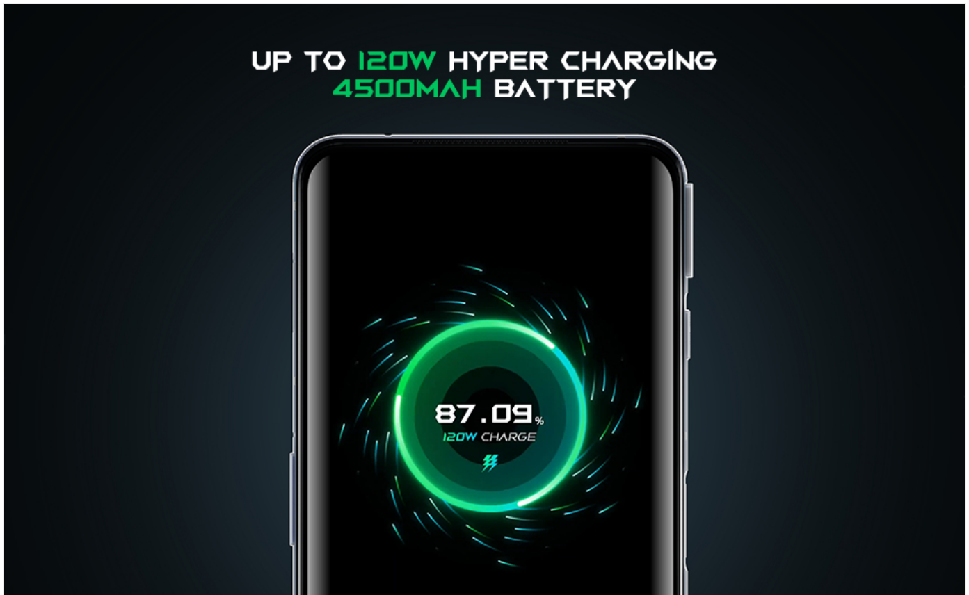
Image: Black Shark 4 displaying 120W charge status.

for a 50% charge in approximately 5 minutes and a full charge in less than 15 minutes using a compatible 120W charger. The included 65W charger can fully charge the device in under 25 minutes.