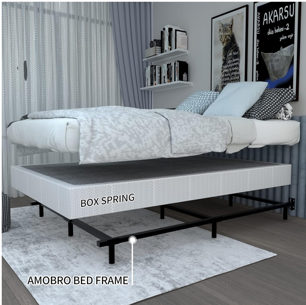
Image: Key features of the AMOBRO Queen Bed Frame, highlighting the headboard mount, side panels to prevent sliding, integrated compact structure with 6 inches of underframe clearance, and powder-coated black steel construction.