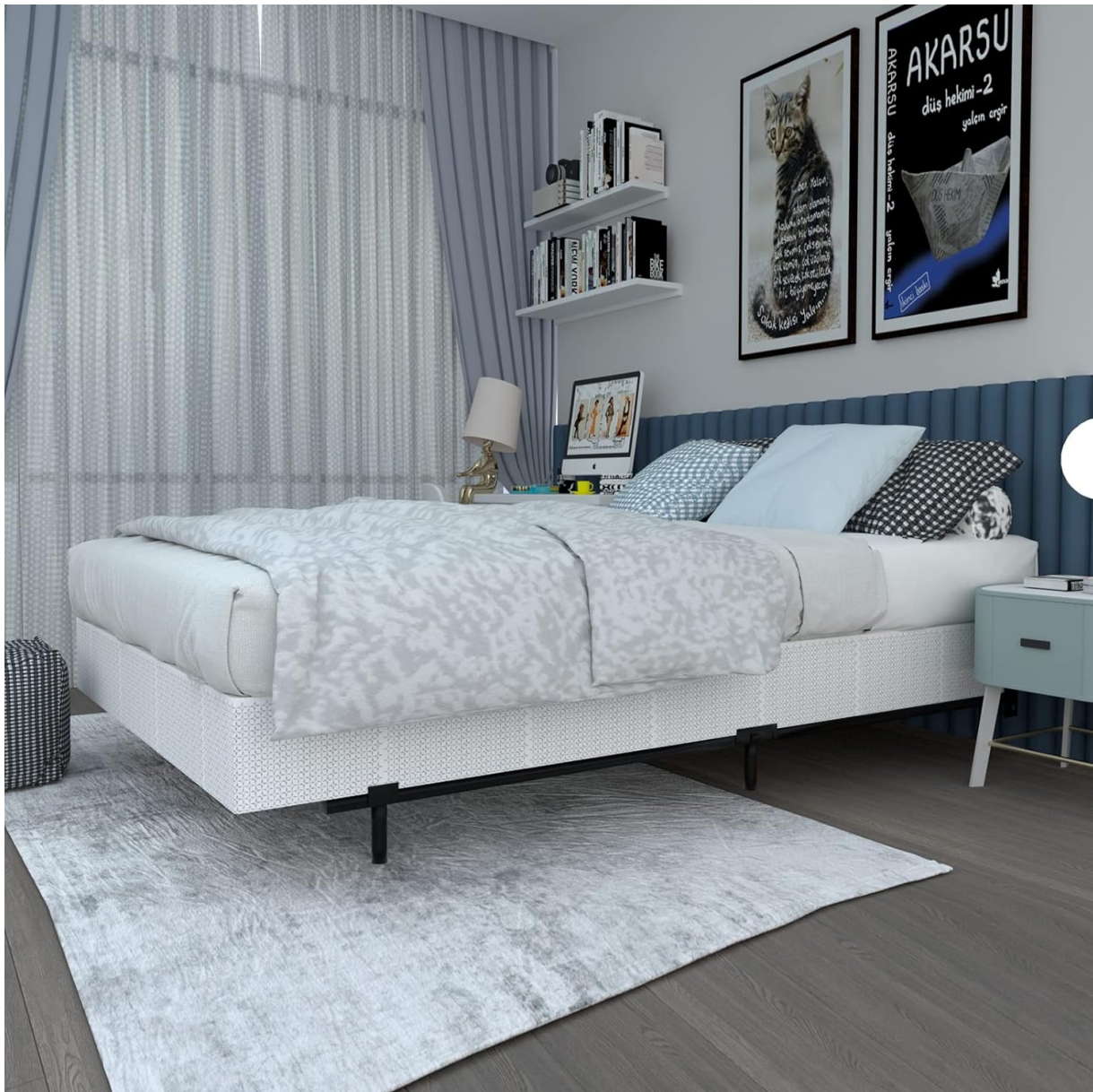
Image: Illustration of the AMOBRO Queen Bed Frame with a box spring and mattress, demonstrating the correct layering for use.