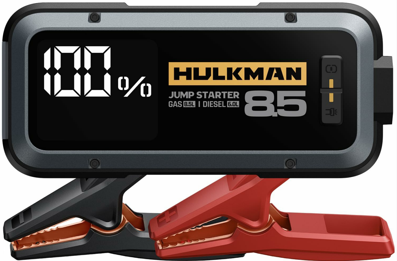
Image: The Hulkman Alpha85 Jump Starter, ready for use, with its smart clamps connected. A vehicle is visible in the background, suggesting its primary function.