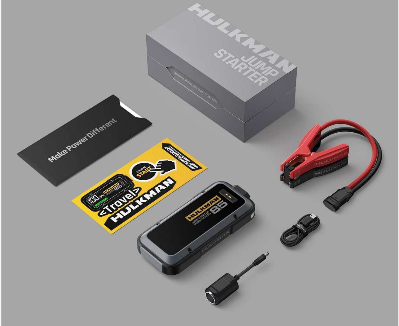
Image: A clear layout of all components included in the Hulkman Alpha85 package, showing the jump starter, clamps, various cables, and documentation.