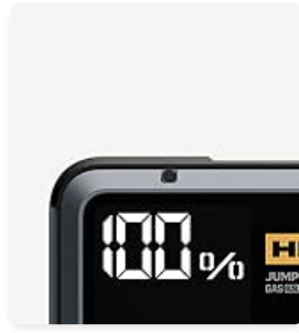
Image: A close-up of the Alpha85's digital display, indicating the current battery charge level as a percentage.