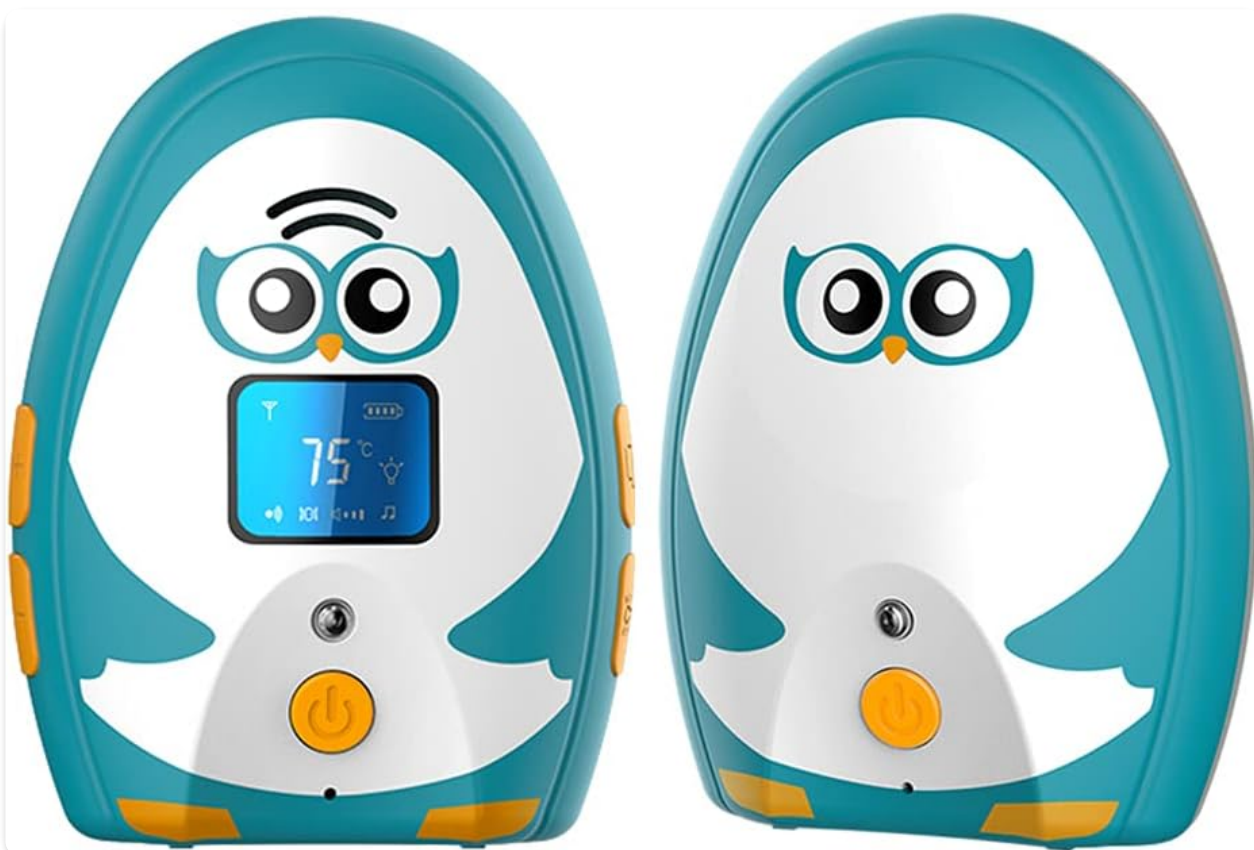
Image: The TimeFllys Audio Baby Monitor, showing both the parent and baby units.

The TimeFllys Audio Baby Monitor is designed to provide parents with peace of mind, allowing them to monitor their baby's sounds from a distance. This portable audio monitor features two-way talk, lullabies, temperature monitoring, and a night light, ensuring comprehensive care for your child. Its long-range capability and flexible power options make it ideal for use at home or on the go.