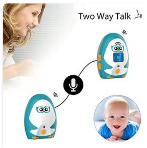
Image: Illustration of the two-way talk feature between the parent and baby units.