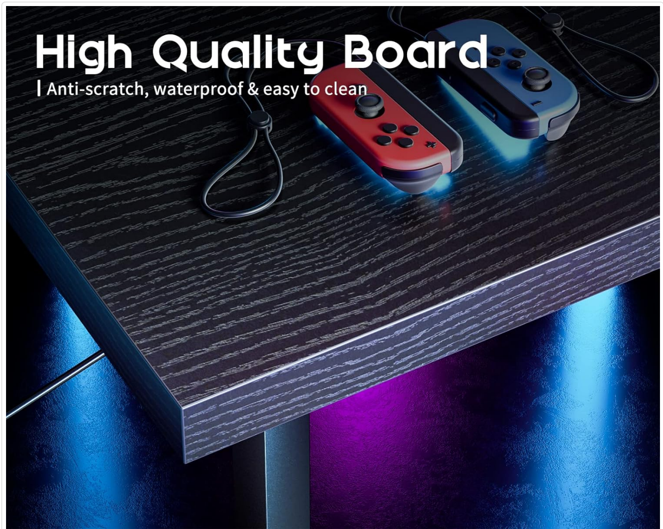
Image 3: A close-up view of the desktop surface, highlighting the high-quality, anti-scratch, waterproof, and easy-to-clean wood finish of the Coleshome L-Shaped Desk.