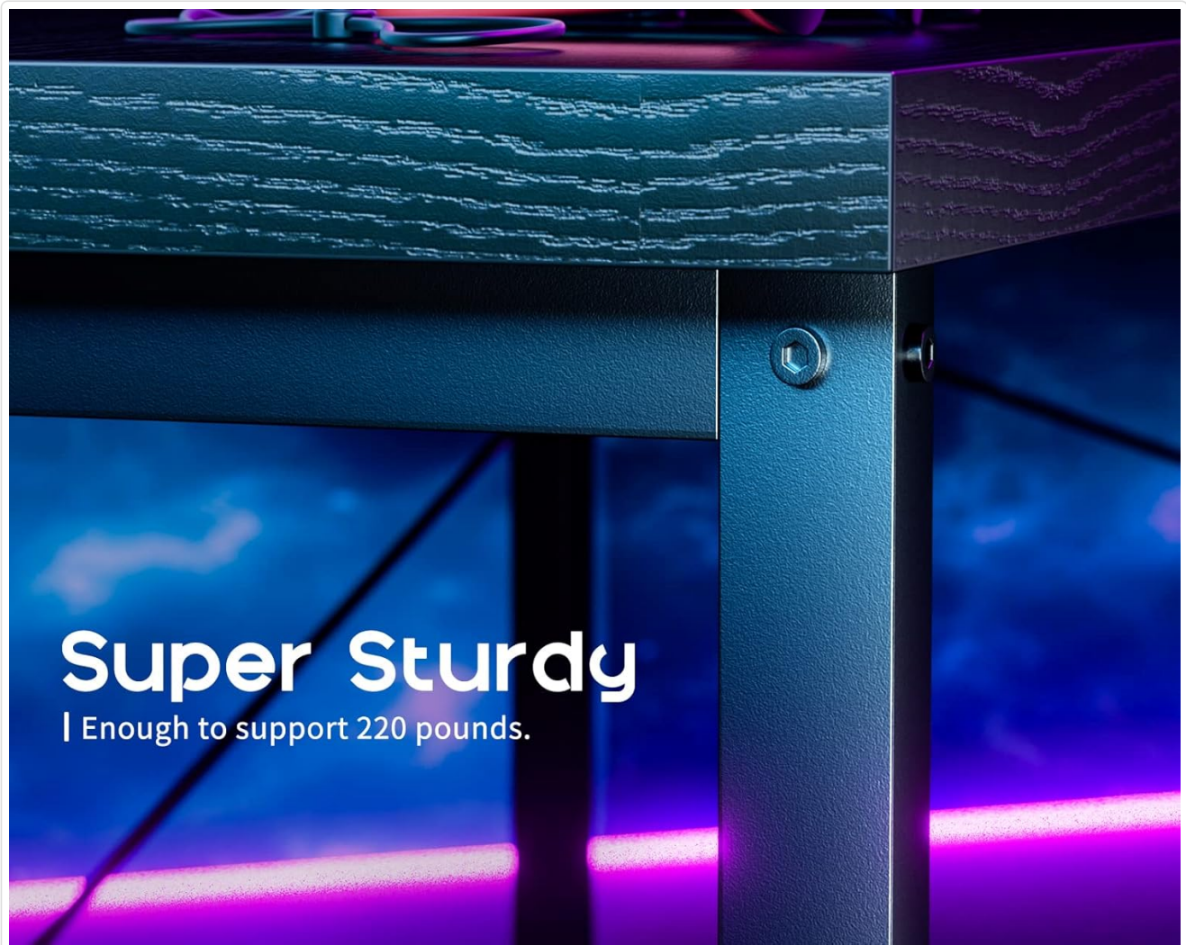
Image 4: A close-up view of the sturdy metal frame and adjustable foot pads of the Coleshome L-Shaped Desk, emphasizing its robust construction and stability features.