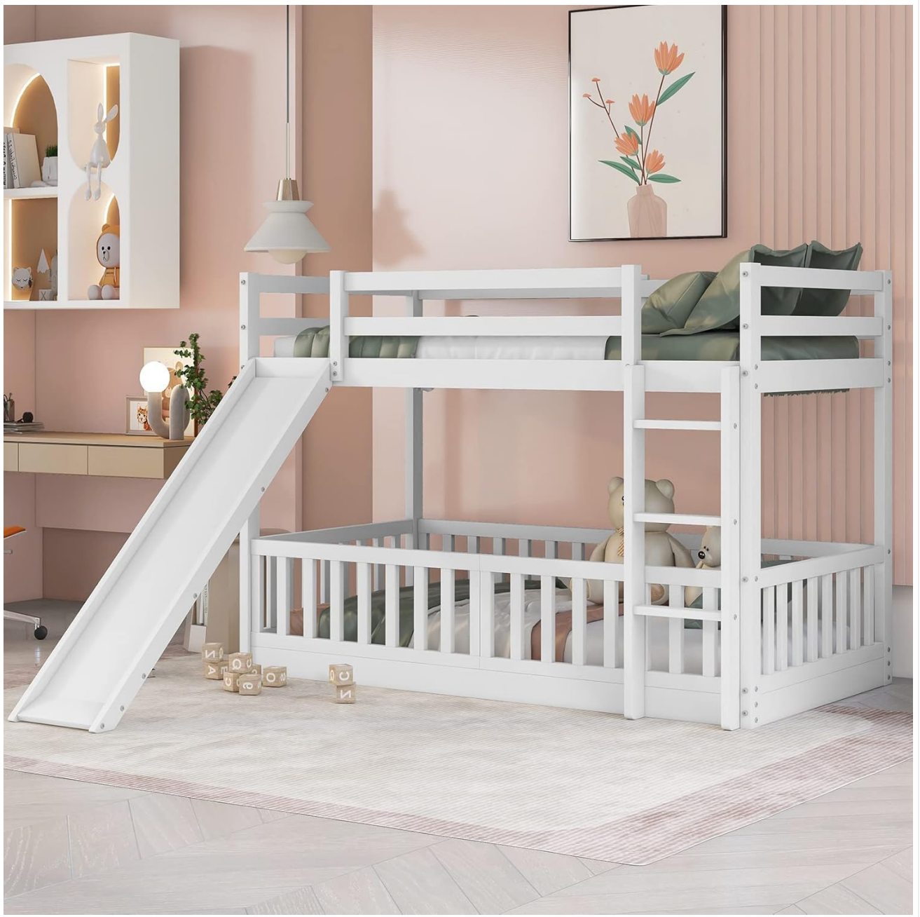
Figure 2.1: Bellemave Twin Over Twin Floor Bunk Bed with Slide (White)