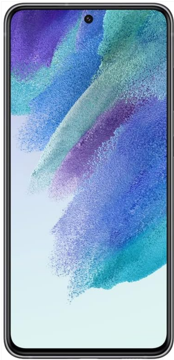
Figure 1: Front view of the Samsung Galaxy S21 FE 5G smartphone.