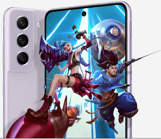
Figure 6: High-performance processor for gaming and multitasking.

1 Requires optimal 5G network connection, available in select markets. Check with your carrier for availability and details. Download and streaming speeds may vary based on content provider, server connection and other factors.