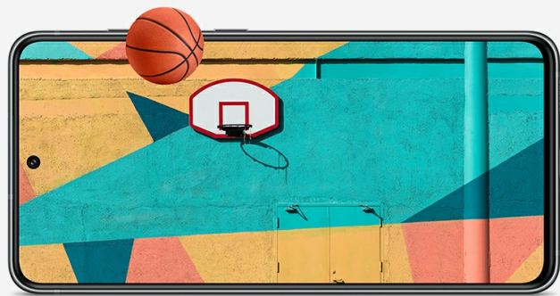
Figure 2: The Dynamic AMOLED 2X display of the Galaxy S21 FE 5G.

Get more out of your mobile experience with scrolling that's bright, fast and silky smooth. Do more of what you love on a screen that's super durable and easy on the eyes, whether you're outside or inside – day or night.